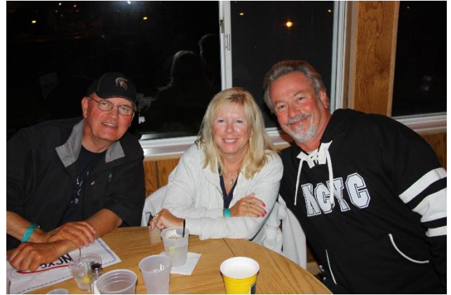
Candidates were campaigning