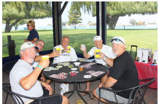
We even broke out the bingo machine out of the attic and played a couple games!