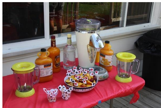
Peachy Patio drinks Saturday afternoon – chicken dinner to follow