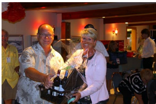
The prizes were amazing!