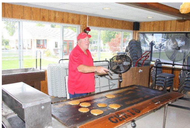
Flying Pancake breakfast Saturday Morning