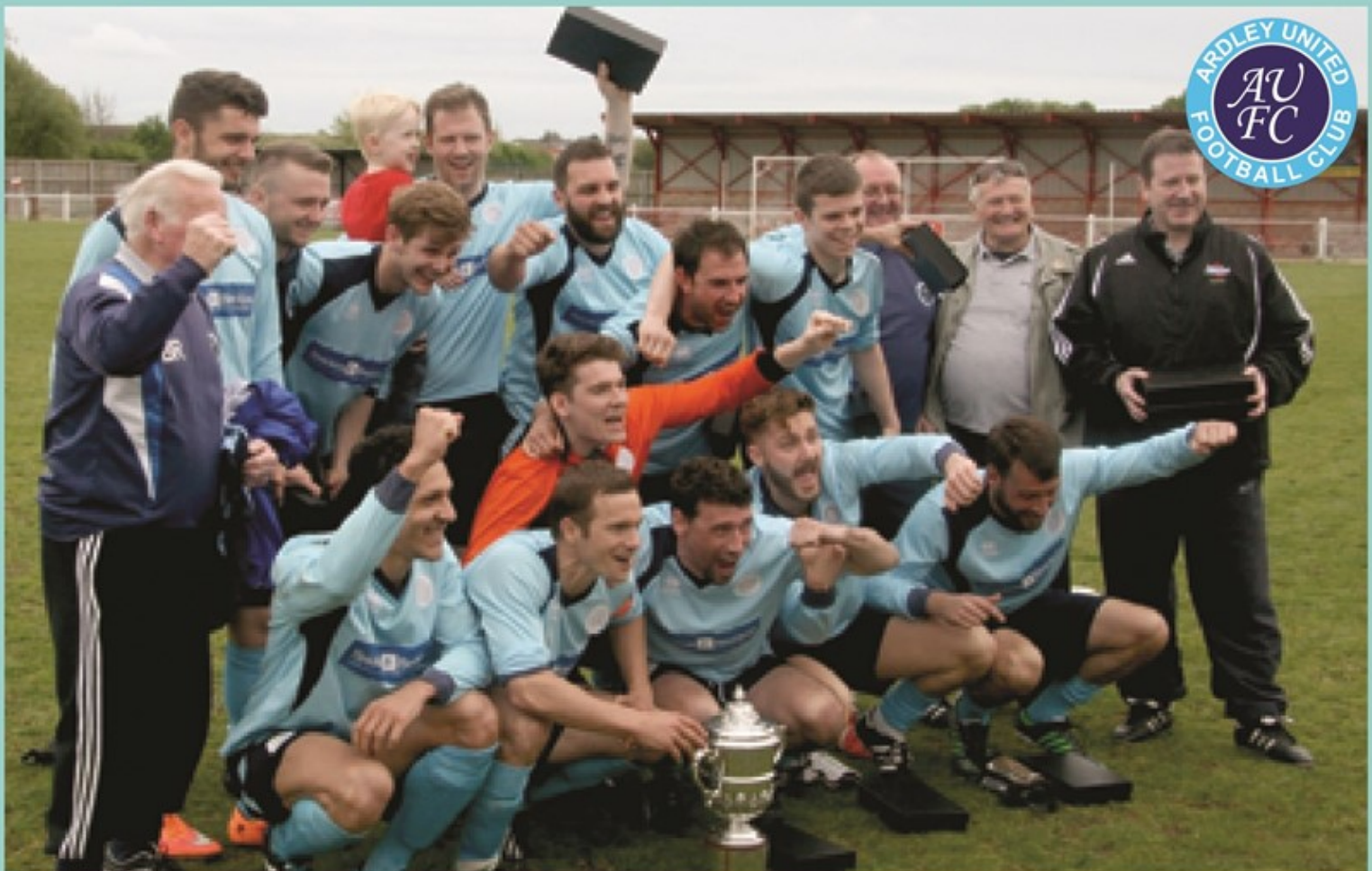
Ascot United and Ardley United faced each other for the second year in a row in the Bluefin Sport Hellenic Challenge Cup Final. This year Ardley took the title with a 2-0 victory at Didcot Town's Loop Meadow Stadium.