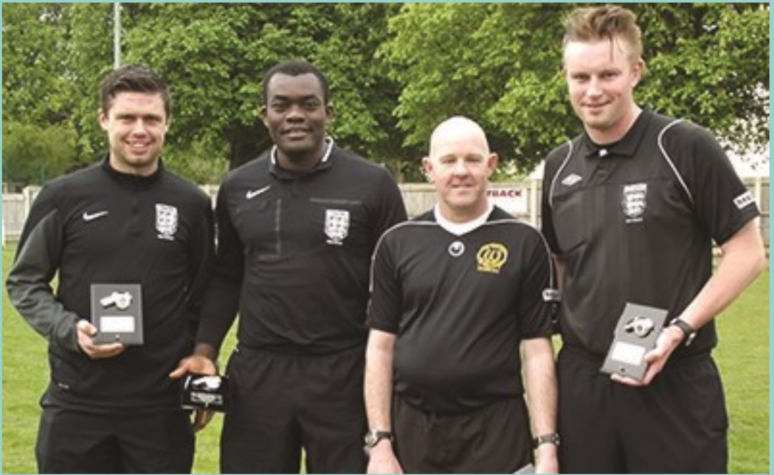
Bluefin Supplementary Cup Match Officials