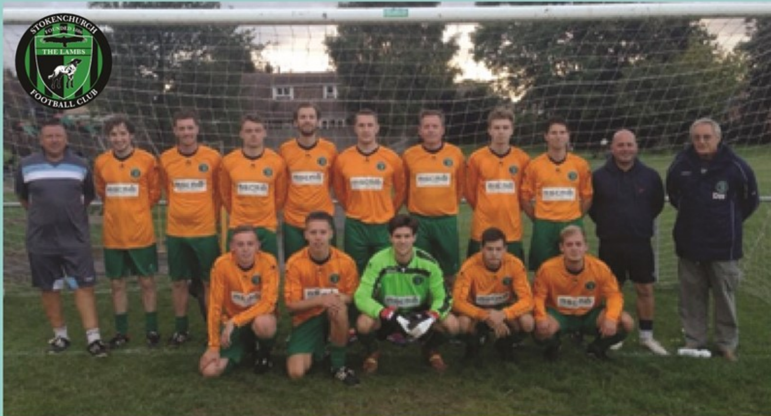
Stokenchurch 2014/15 Division Two East Champions. Initial season in the Hellenic League winning the title at the first attempt.