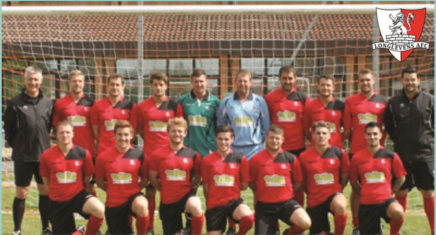
Longlevens AFC 2014/15 Division One West Champions. First season in the Hellenic League and promotion to the Premier Division at the first attempt.