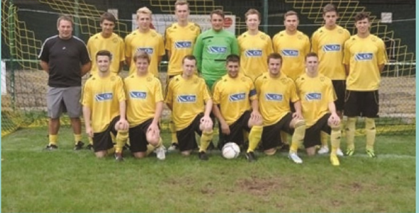
Division One West North Leigh United 2014/15 Flying Press Floodlit Cup Winners. 2-0 victory over Premier Division Binfield - Game played at Kidlington FC