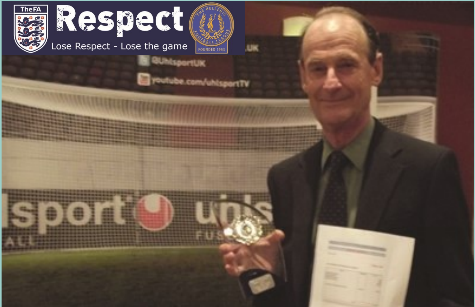
Division One Respect & Fair Play Award –