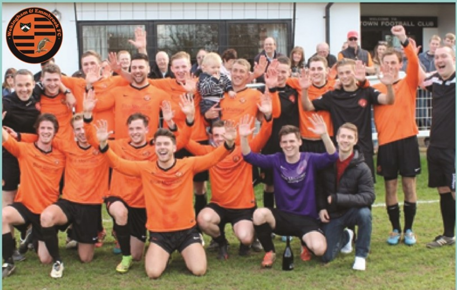
Wokingham & Emmbrook 2014/15 Division One East Champions. Returning to the Premier Division after two seasons in Division One.