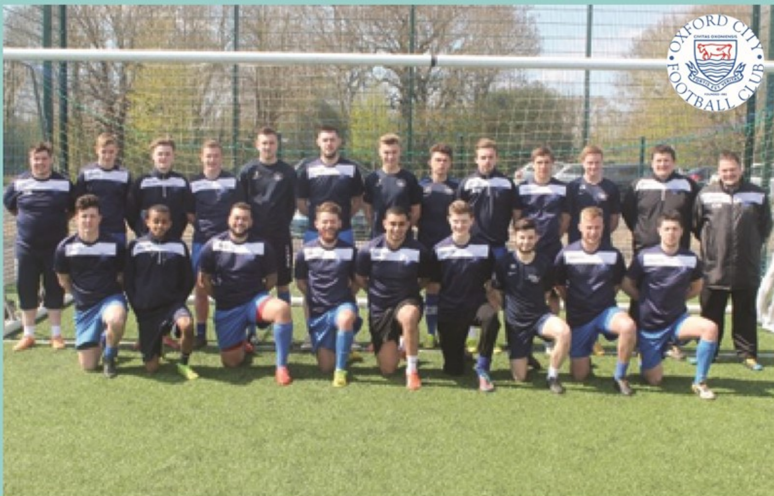
Oxford City Nomads Development team 2014/15 Division One West Champions. Title winners in their second season of Hellenic football.