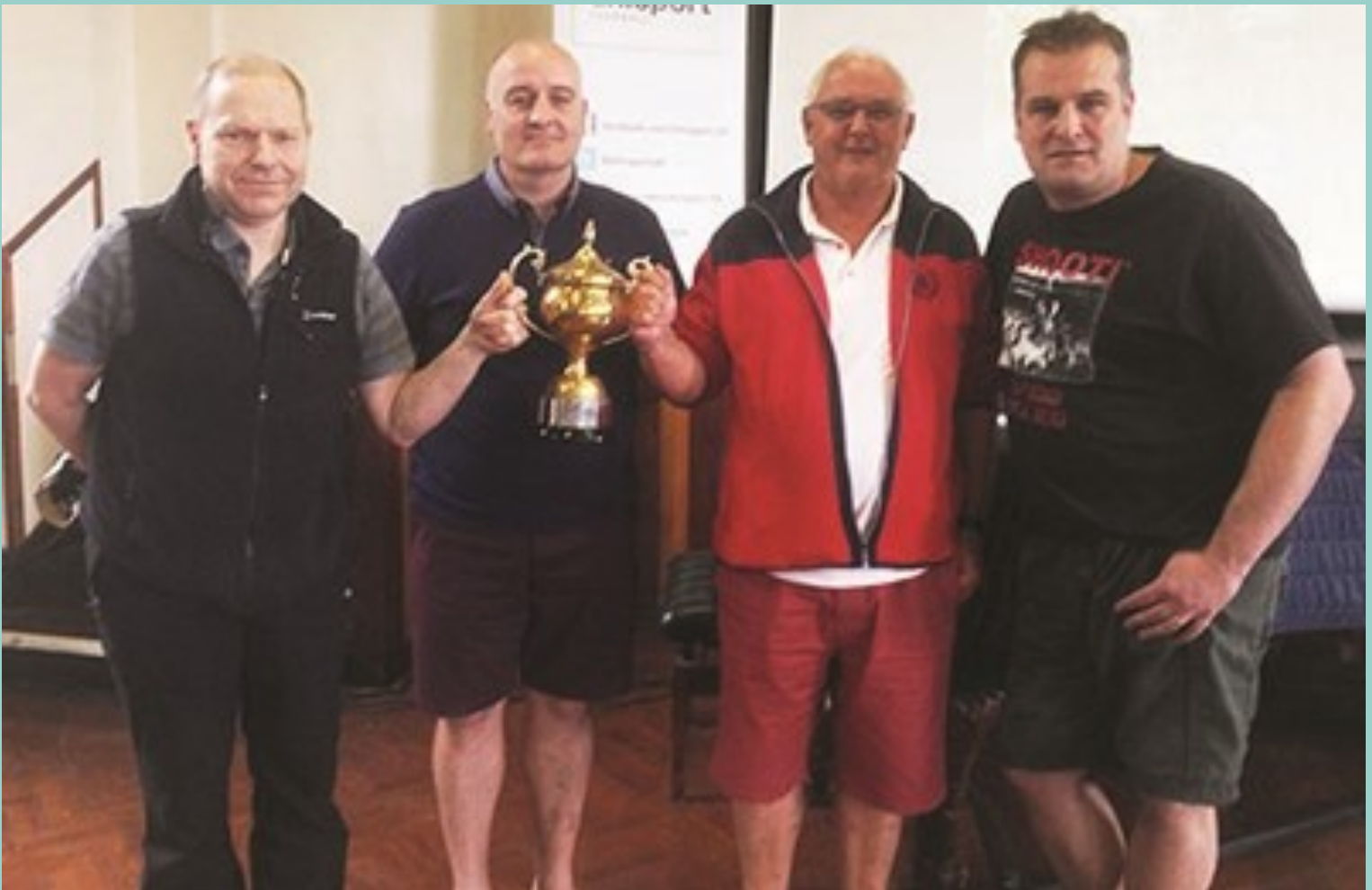
Highworth Town - Winners Of The Hungerford Cup 2014/15