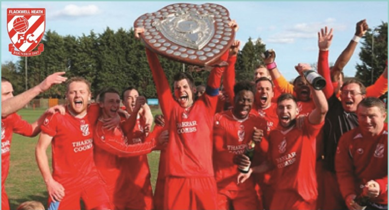
Flackwell Heath 2014/15 Premier Division Champions. Twelve points clear of the rest along with a +100 goal difference. They chose not to take up promotion to Step 4.