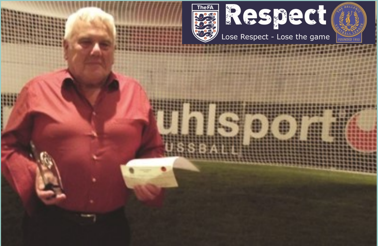
Premier Division Respect & Fair Play Award –