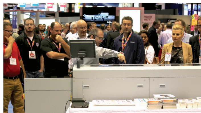
Crowds gathered to see the capabilities of the new Standard Horizon SmartSlitter, an all-in-one smart sheet processing system that can crease, perforate, and cut in one pass.

production of payment forms, tear-off coupons, mailings and security applications.