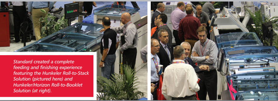
Standard created a complete feeding and finishing experience featuring the Hunkeler Roll-to-Stack Solution (pictured here) and Hunkeler/Horizon Roll-to-Booklet Solution (at right).