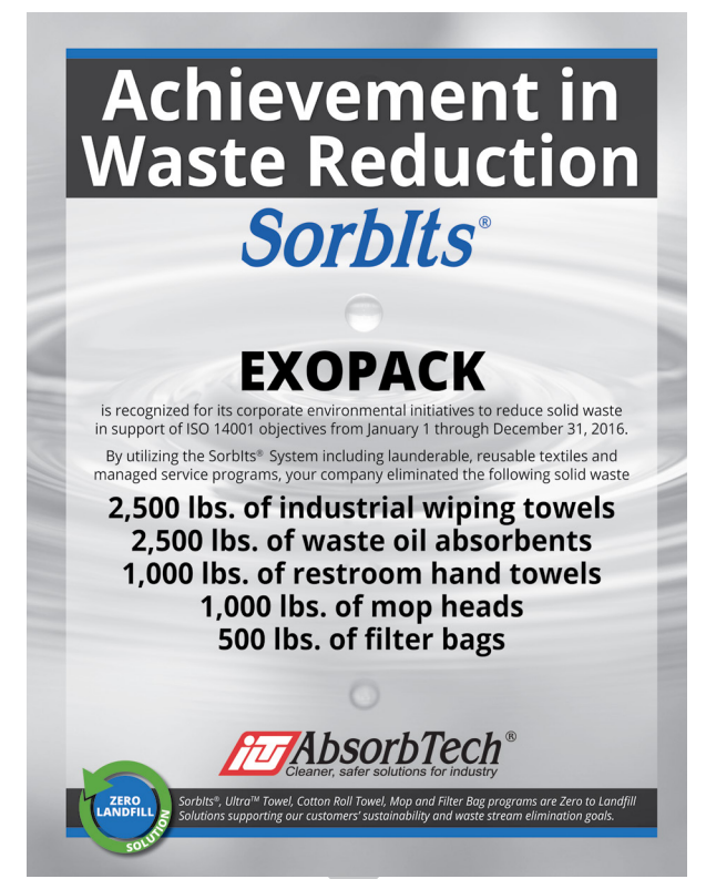
Sample Waste Reduction Certificate