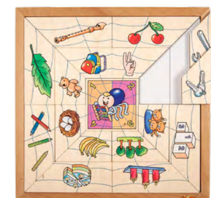
SPIDER SORTING THE FOUR SEASONS

E522907 Compare and sort bears in various colours and sizes.