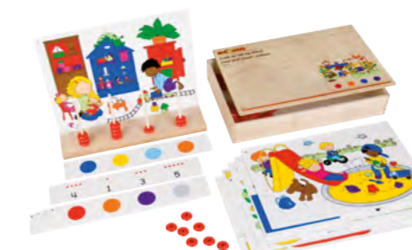
FIND AND COUNT ON COLOUR

E523238 Wooden dominoes that feature coloured circles.