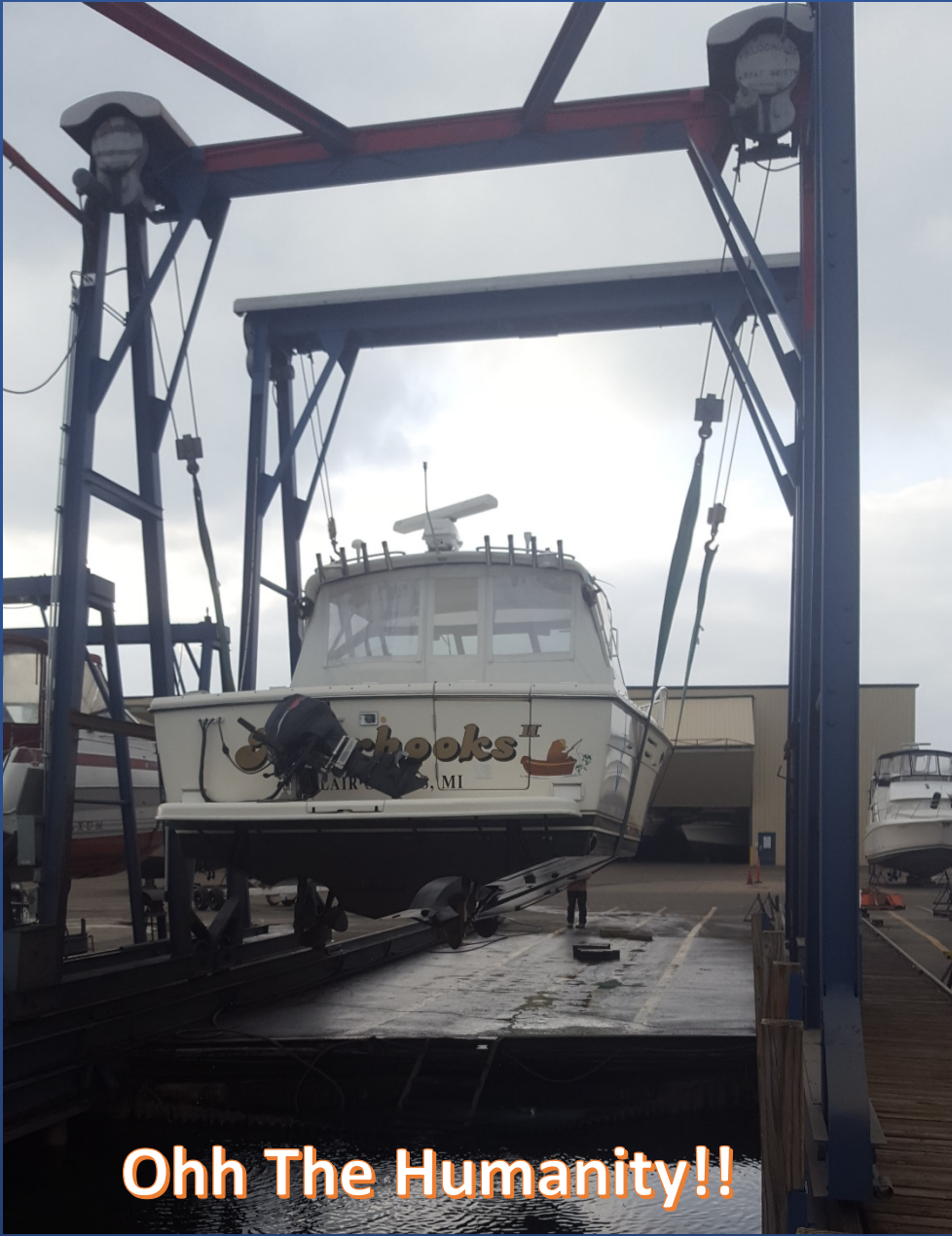
Ohh The Humanity!!