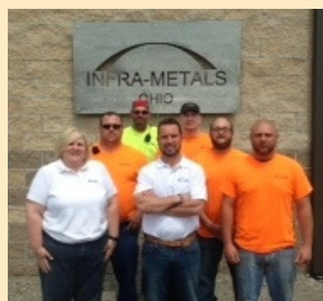
New Boston, Ohio