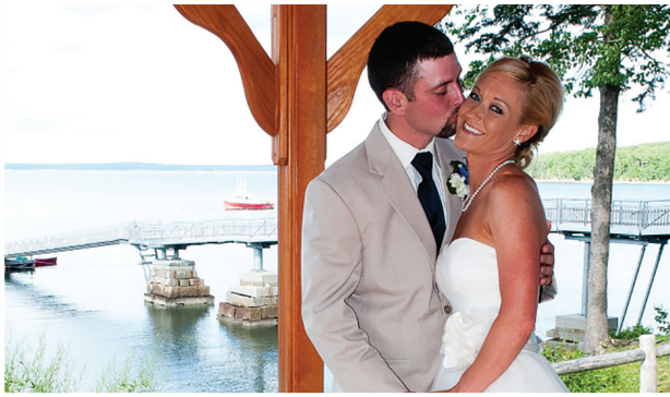
Bell Imaging & Design LLC