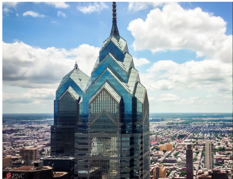
ONE LIBERTY PLACE Over 1 million sf Philadelphia, PA