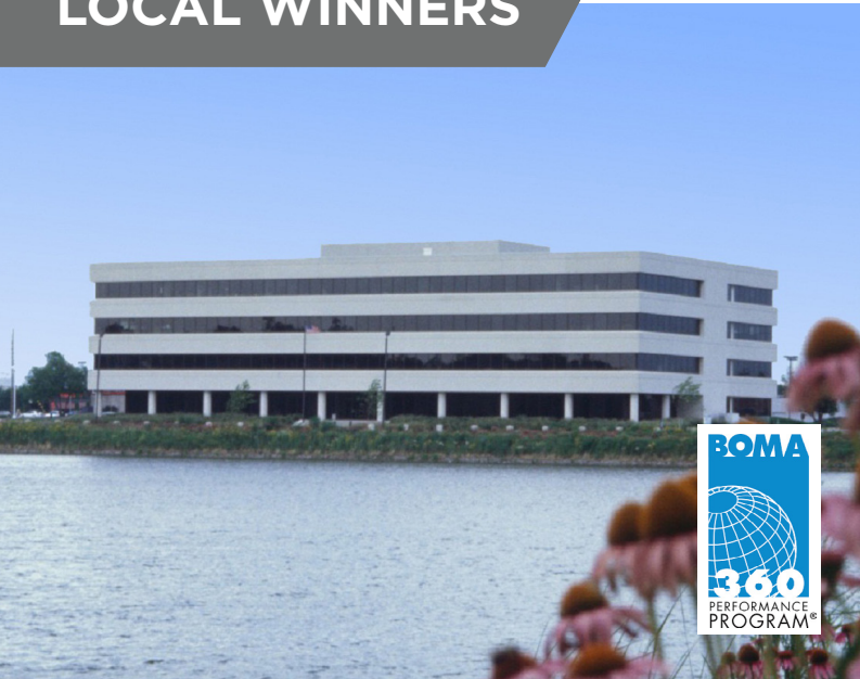
CASTLETON OFFICE PARK Suburban Office Park (Low-Rise) Indianapolis, IN