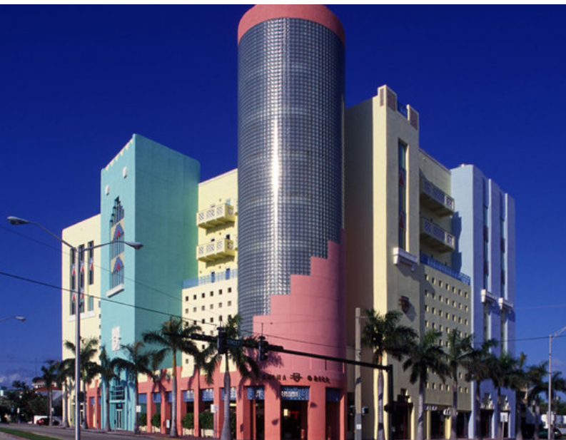
404 WASHINGTON Under 100,000 sf Miami, FL