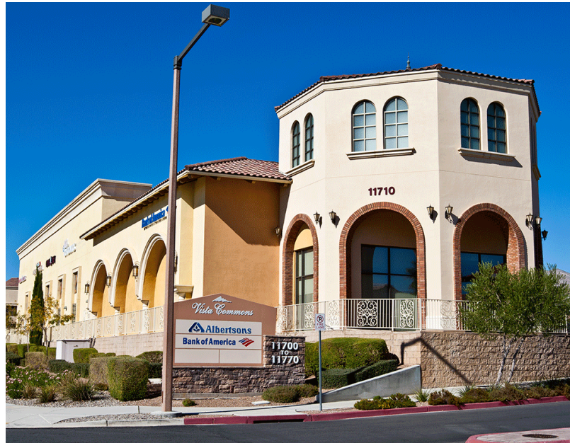
VISTA COMMONS Retail Las Vegas, NV