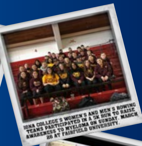
IONA COLLEGE'S WOMEN'S AND MEN'S ROWING TEAMS PARTICIPATED IN A 5K RUN TO RAISE AWARENESS TO MYELOMA ON SUNDAY, MARCH 26 AT FAIRFIELD UNIVERSITY.