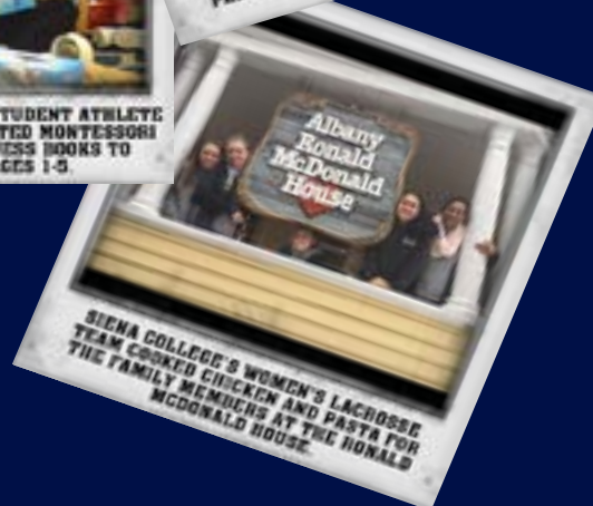
SIENA COLLEGE'S WOMEN'S LACROSSE TEAM COOKED CHICKEN AND PASTA FOR THE FAMILY MEMBERS AT THE RONALD MCDONALD HOUSE.