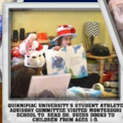
QUINNIPIAC UNIVERSITY'S STUDENT ATHLETE ADVISORY COMMITTEE VISITED MONTESSORI SCHOOL TO READ DR. SEUSS BOOKS TO CHILDREN FROM AGES 1-5.