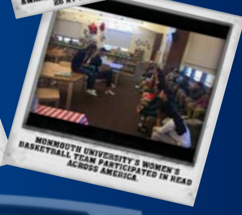
MONMOUTH UNIVERSITY'S WOMEN'S BASKETBALL TEAM PARTICIPATED IN HEAD ACROSS AMERICA.

Under the Geico GoodWorks Program structure, MAAC member schools who have completed community service projects will be featured each month throughout the academic year. Monthly releases will be published and archived on MAACSports.com that highlight the volunteer efforts of MAAC schools during that month.