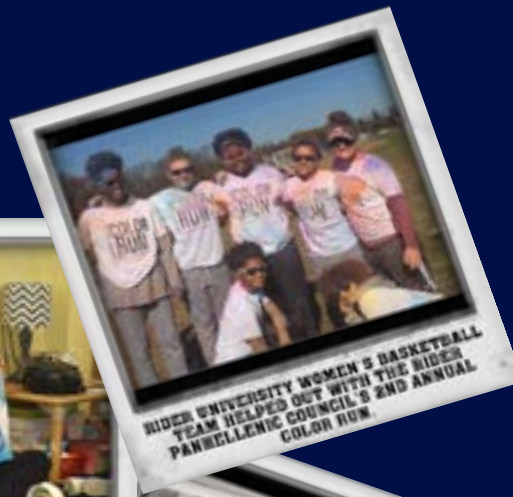
RIDER UNIVERSITY WOMEN'S BASKETBALL TEAM HELPED OUT WITH THE RIDER PANKHELLENIC COUNCIL'S 2ND ANNUAL COLOR RUN.