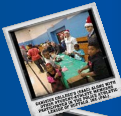
CANISUS COLLEGE'S (SAC) ALONG WITH OTHER STUDENT-ATHLETE MEMBERS PARTICIPATED IN THE POLICE ATHLETIC LEAGUE OF BUFFALO, INC. (PAL).