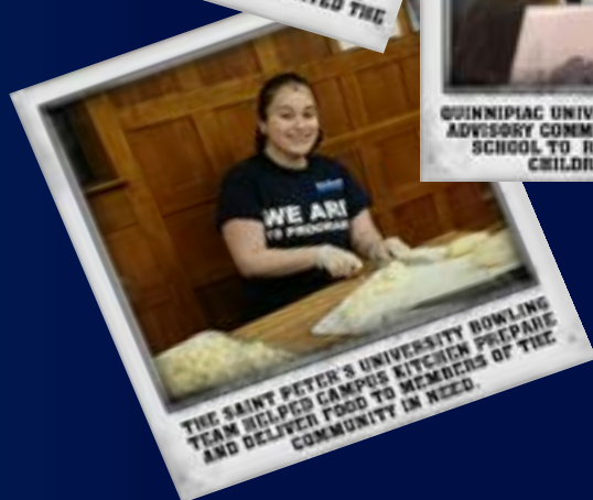
THE SAINT PETER'S UNIVERSITY BOWLING TEAM HELPED CAMPUS KITCHEN PREPARE AND DELIVER FOOD TO MEMBERS OF THE COMMUNITY IN NEED.