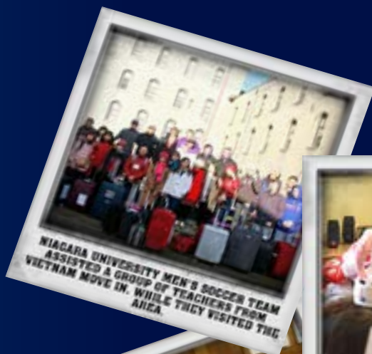
NIRAGA UNIVERSITY MEN'S SOCCER TEAM ASSISTED A GROUP OF TEACHERS FROM VIETNAM MOVE IN, WHILE THEY VISITED THE AREA.