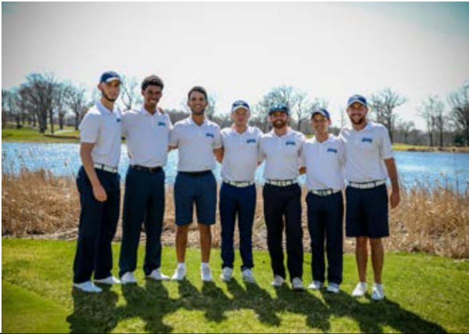
2016-17 MEN'S ROSTER