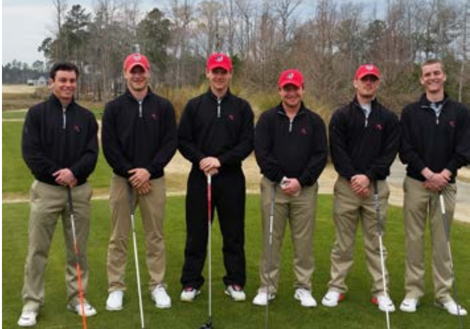
2016-17 MEN'S ROSTER