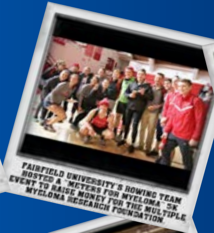
FAIRFIELD UNIVERSITY'S ROWING TEAM HOSTED A "METERS FOR MYELOMA" 5K EVENT TO RAISE MONEY FOR THE MULTIPLE MYELOMA RESEARCH FOUNDATION.