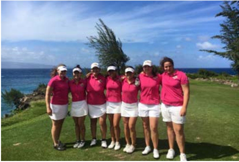
2016-17 WOMEN'S ROSTER