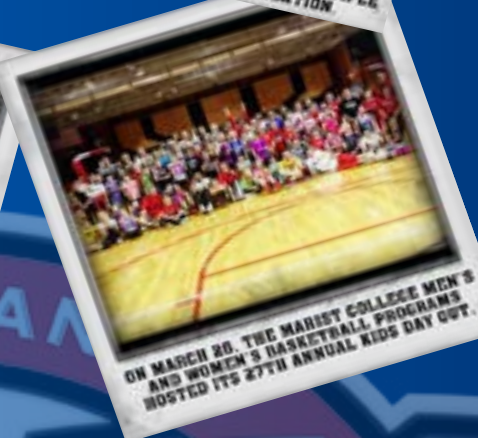
ON MARCH 26, THE MARIST COLLEGE MEN'S AND WOMEN'S BASKETBALL PROGRAMS HOSTED ITS 27TH ANNUAL KIDS DAY OUT.