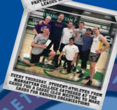
EVERY THURSDAY, STUDENT-ATHLETES FROM MANHATTAN COLLEGE GATHERED AT THE CARDS FOR A CAUSE CLUB MEETING TO MAKE CARDS FOR VARIOUS ORGANIZATIONS.