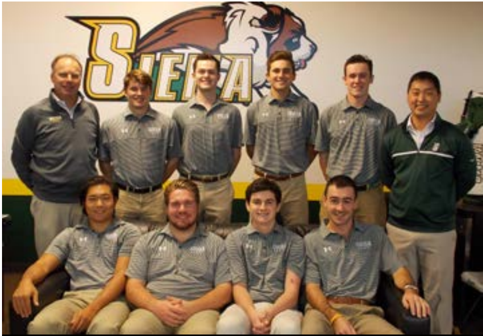
2016-17 MEN'S ROSTER