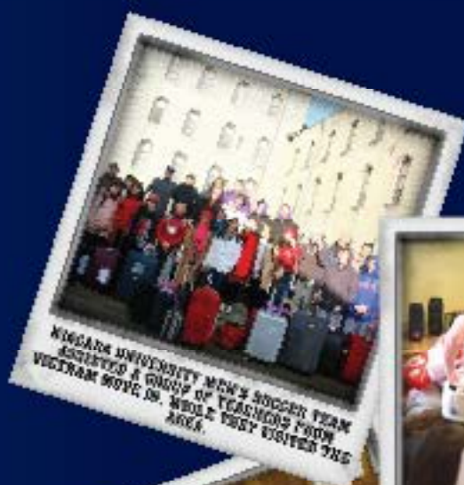
NIAGARA UNIVERSITY MEN'S SOCCER TEAM ASSISTED A GROUP OF TEACHERS FROM VIETNAM MOVE IN. WHILE THEY VISITED THE AREA.