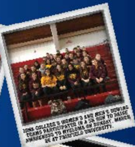
IONA COLLEGE'S WOMEN'S AND MEN'S ROWING TEAMS PARTICIPATED IN A SKI RUN TO RAISE AWARENESS TO MYELOMA ON SUNDAY, MARCH 26 AT FAYFIELD UNIVERSITY.