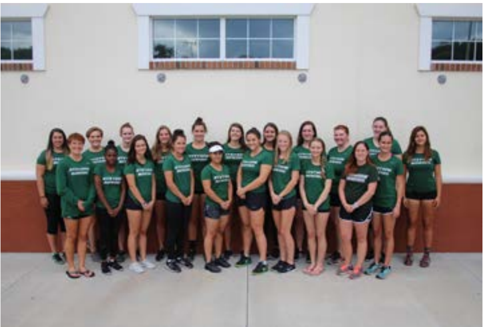
2017 WOMEN'S ROSTER