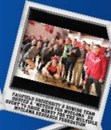
FAYFIELD UNIVERSITY'S ROWING TEAM HOSTED A "ROVERS FOR MYELOMA" SKI EVENT TO RAISE MONEY FOR THE MULTIPLE MYELOMA RESEARCH FOUNDATION.