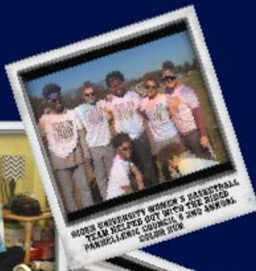
QUINNIPAC UNIVERSITY WOMEN'S BASKETBALL TEAM HELPED OUT WITH THE RIBBON PHILADELPHIC COUNCIL'S 2ND ANNUAL COLOR RUN.