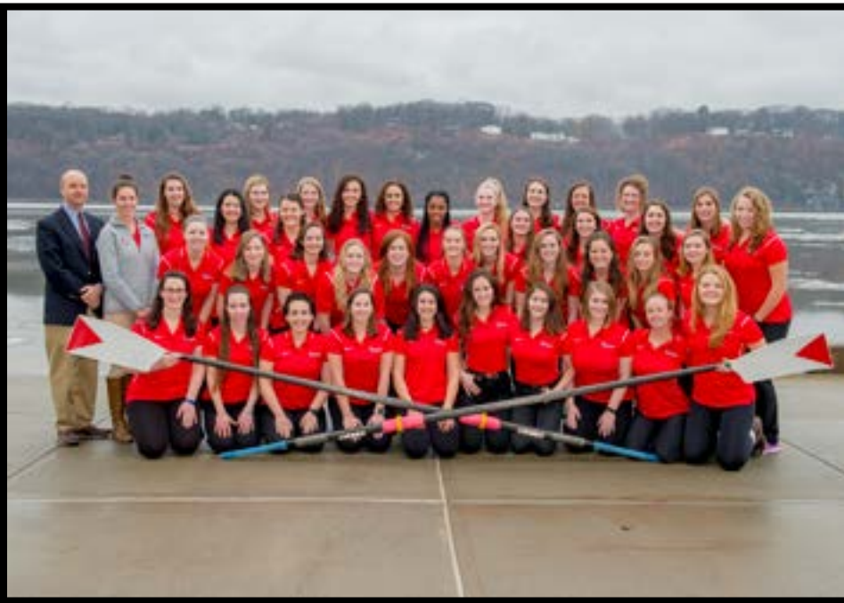
2017 WOMEN'S ROSTER