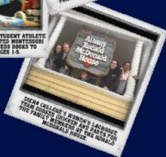
SIENA COLLEGE'S WOMEN'S LACROSSE TEAM DONATED GINGER AND PASTA FOR THE FAMILY MEMBERS AT THE RONALD McDONALD HOUSE.