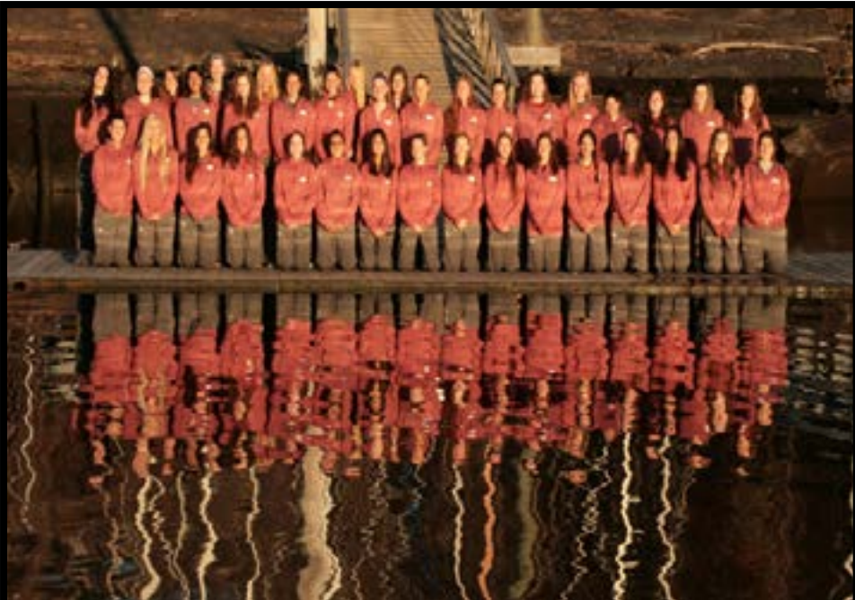
2017 WOMEN'S ROSTER