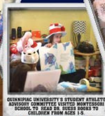
QUINNIPAC UNIVERSITY'S STUDENT ATHLETE ADVISORY COMMITTEE VISITED MONTESSORI SCHOOL TO READ DR. SEUSS BOOKS TO CHILDREN FROM AGES 1-3.