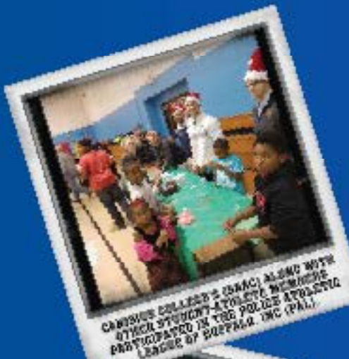
CANISUS COLLEGE'S (CAAC) ALONG WITH OTHER STUDENT-ATHLETE MEMBERS PARTICIPATED IN THE POLICE ATHLETIC LEAGUE OF BUFFALO, INC. (PAL).