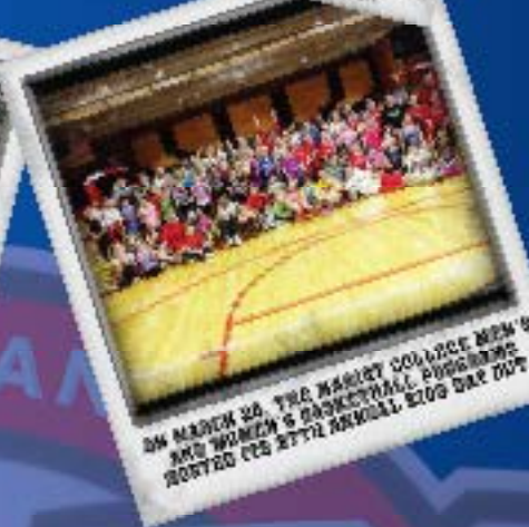
ON MARCH 20, THE MARIST COLLEGE MEN'S AND WOMEN'S BASKETBALL PROGRAMS HOSTED THE 5TH ANNUAL 5K5K 5K5K 5K5K.