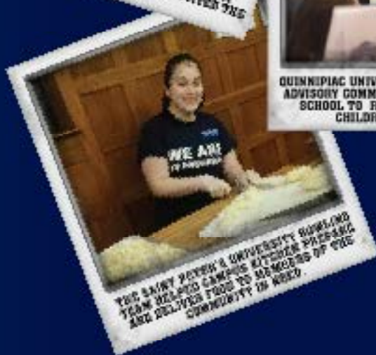
THE SAINT PETER'S UNIVERSITY BOWLING TEAM HELPED CAMPUS KITCHEN PREPARE AND DELIVER FOOD TO MEMBERS OF THE COMMUNITY IN NEED.