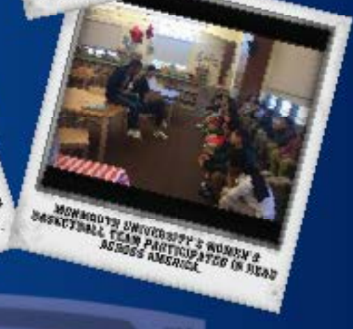
MONMOUTH UNIVERSITY'S WOMEN'S BASKETBALL TEAM PARTICIPATED IN HEAD-TO-HEAD CHALLENGE ACROSS AMERICA.

Under the Geico GoodWorks Program structure, MAAC member schools who have completed community service projects will be featured each month throughout the academic year. Monthly releases will be published and archived on MAACSports.com that highlight the volunteer efforts of MAAC schools during that month.