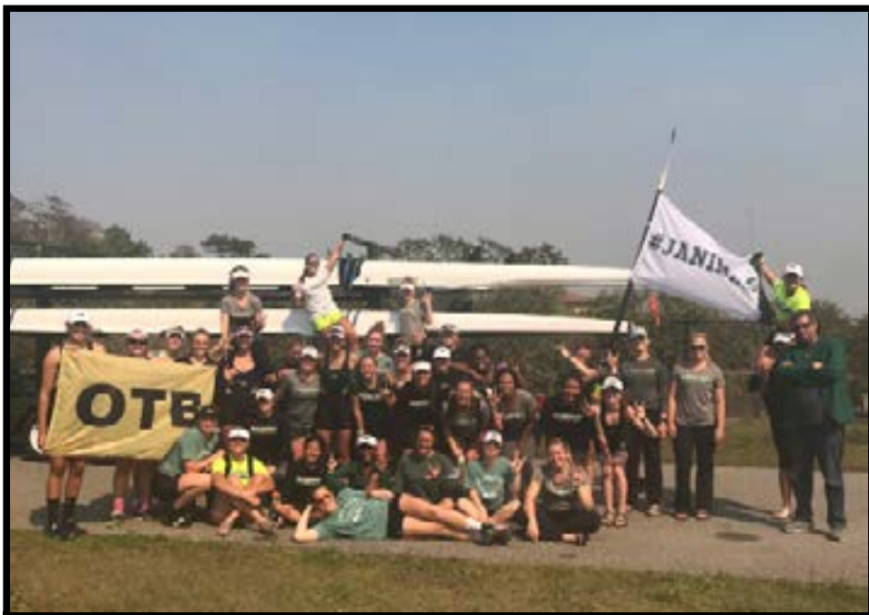
2017 WOMEN'S ROSTER