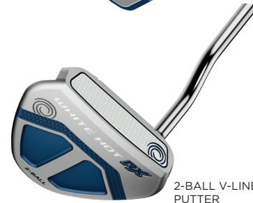
2-BALL V-LINE PUTTER