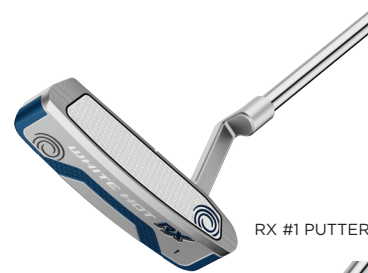
RX #1 PUTTER

#1 Putter in Golf claim based on combined wins and usage from 2004 – present on the PGA, EPGA, JGTO, Web.com, Champions and LPGA Tours, as reported by the Darrell Survey Co. and Sports Marketing Surveys, Inc. 150438