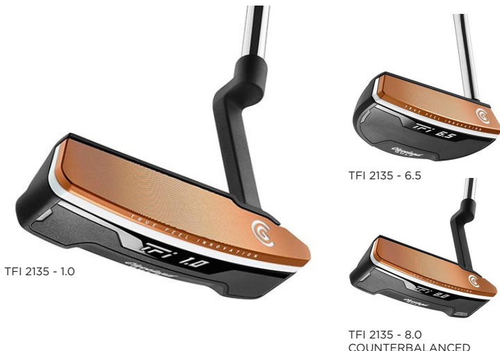
TFI 2135 - 1.0