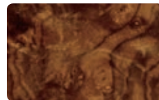
Brown Swirl Walnut Wood