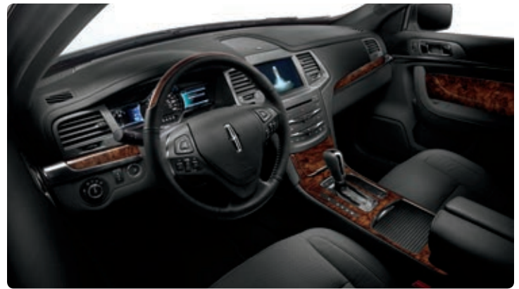
Charcoal Black Leather