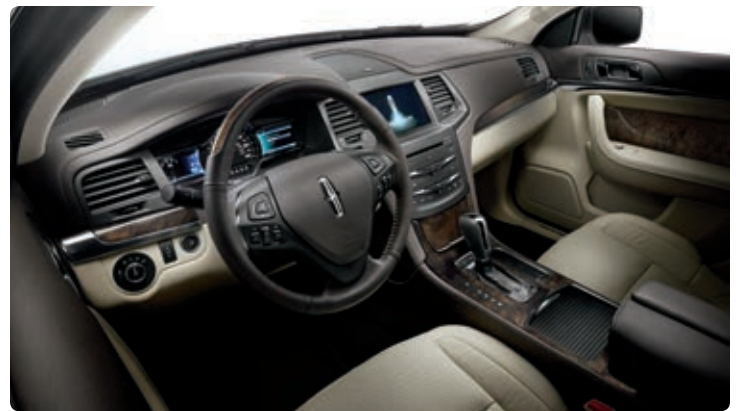
Light Dune Leather