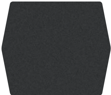
7. Magnetic Metallic