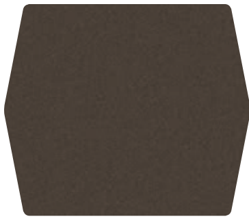
2. Java Metallic