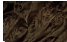
Prussian Burl Wood