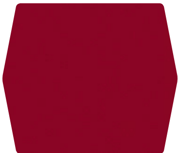
9. Ruby Red Metallic Tinted Clearcoat 1