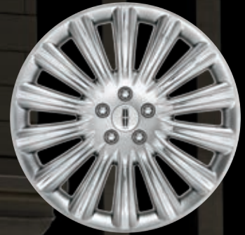
20" Premium Painted Aluminum with Chrome Inserts Available