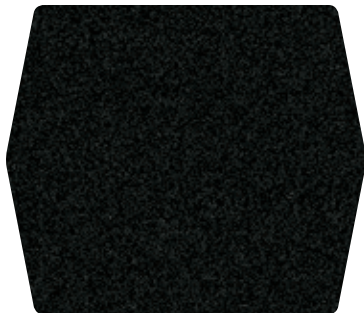
8. Tuxedo Black Metallic