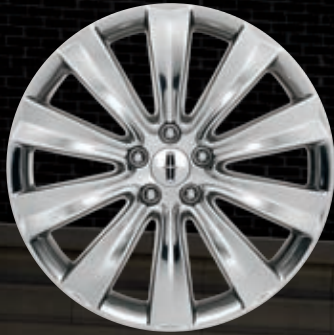
20" Polished Aluminum Standard on EcoBoost®