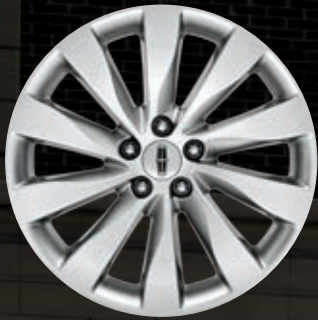
19" Premium Painted Aluminum Standard