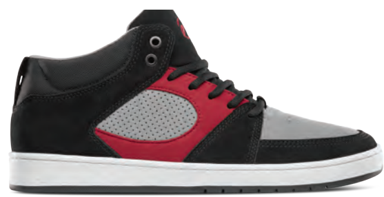
BLACK / GREY / RED 576 | Suede / Synthetic