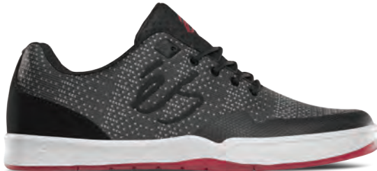
BLACK / WHITE / RED 978 | Textile, Synthetic