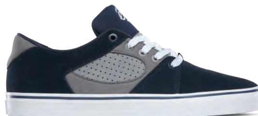
NAVY / GREY 407 | Suede, Synthetic