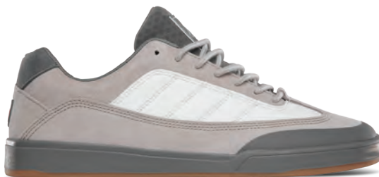
DARK GREY / GREY 063 | Suede, Synthetic