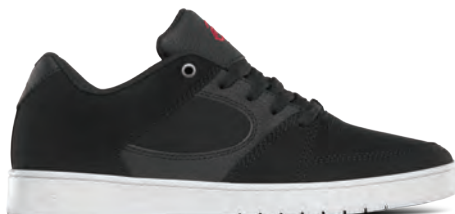
BLACK / WHITE / RED 978 | Synthetic