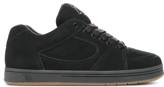
BLACK 001 | Suede | C/O