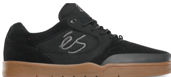
BLACK / GUM 964 | Suede, Textile, Synthetic