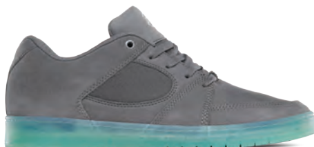
DARK GREY / BLUE 061 | Suede, Textile