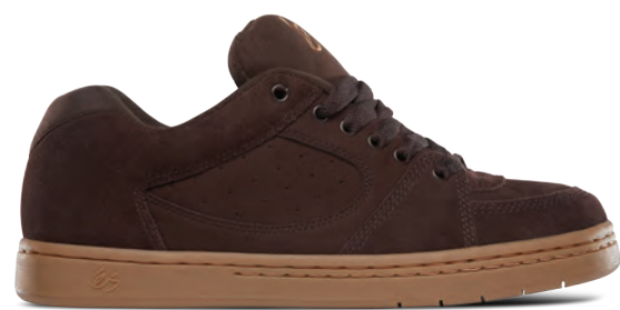
CHOCOLATE / GUM 247 | Suede, Textile