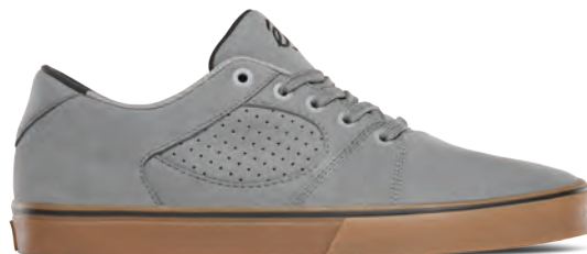
GREY / GUM 367 | Suede, Synthetic