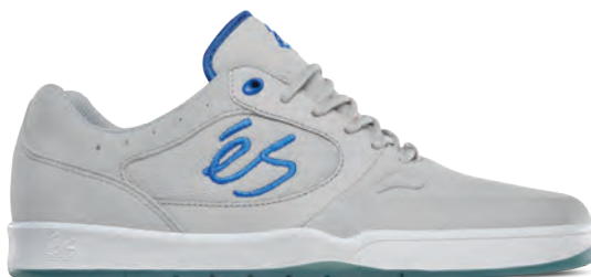
LIGHT GREY 050 | Suede, Textile, Synthetic