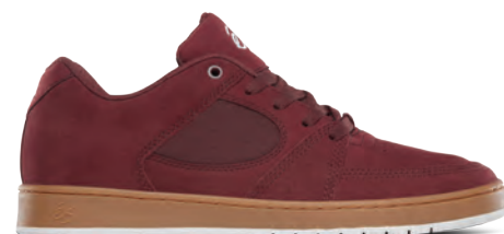
BURGUNDY / GUM 610 | Suede, Textile