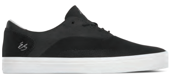
BLACK / DARK GREY 560 | Suede, Canvas