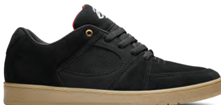
BLACK / GUM 964 | Suede, Textile | FA17 C/O