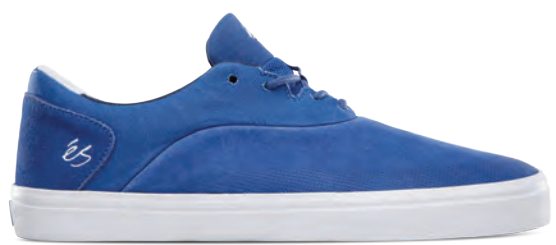
BLUE 400 | Suede, Canvas