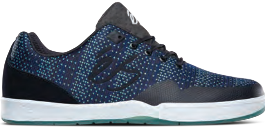
NAVY 401 | Textile, Synthetic | H017 C/O