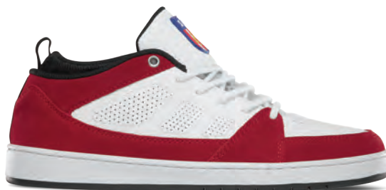
WHITE / RED 170 | Suede, Synthetic