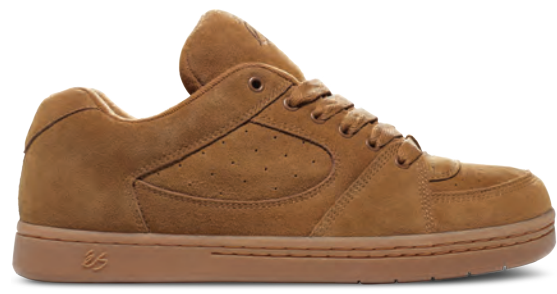
BROWN / GUM 212 | Suede | C/O