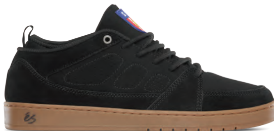
BLACK / GUM 964 | Suede, Synthetic