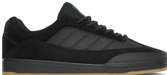
BLACK / BLACK / GUM 544 | Suede, Synthetic