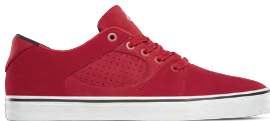
RED 600 | Suede, Synthetic