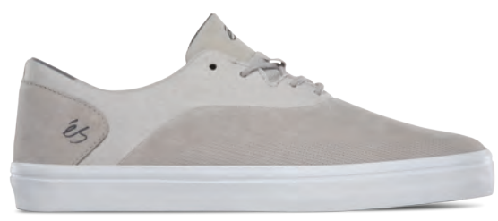
TAN 260 | Suede, Canvas