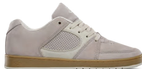
KHAKI 255 | Suede, Textile