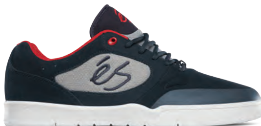
NAVY / GREY / WHITE 416 | Suede, Textile, Synthetic