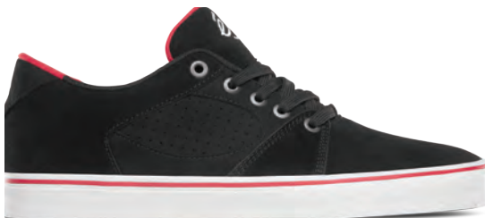
BLACK / WHITE / RED 978 | Suede, Synthetic