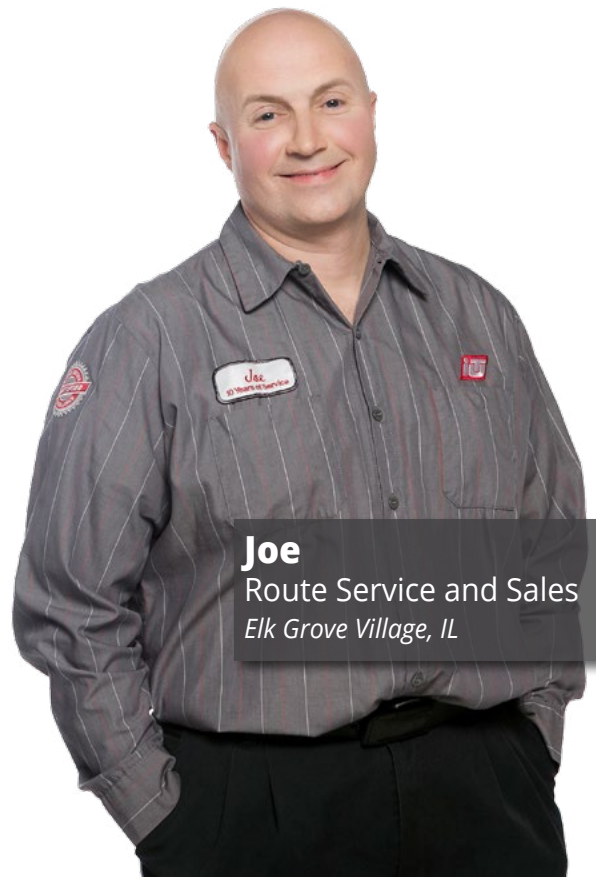
Joe Route Service and Sales Elk Grove Village, IL

Net Promoter Score - a proven method companies worldwide use to measure & improve loyalty. Across industries, a 69 out of 100 is considered exceptional.