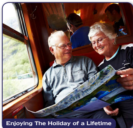
Enjoying The Holiday of a Lifetime