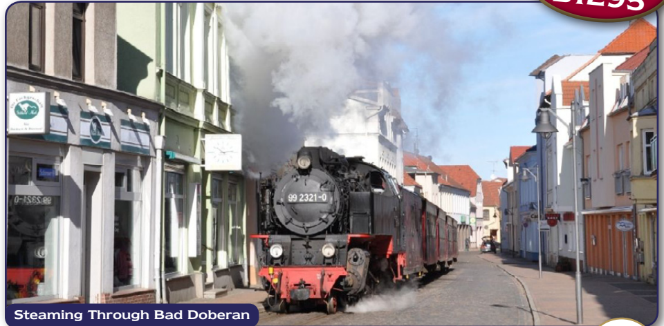
Steaming Through Bad Doberan