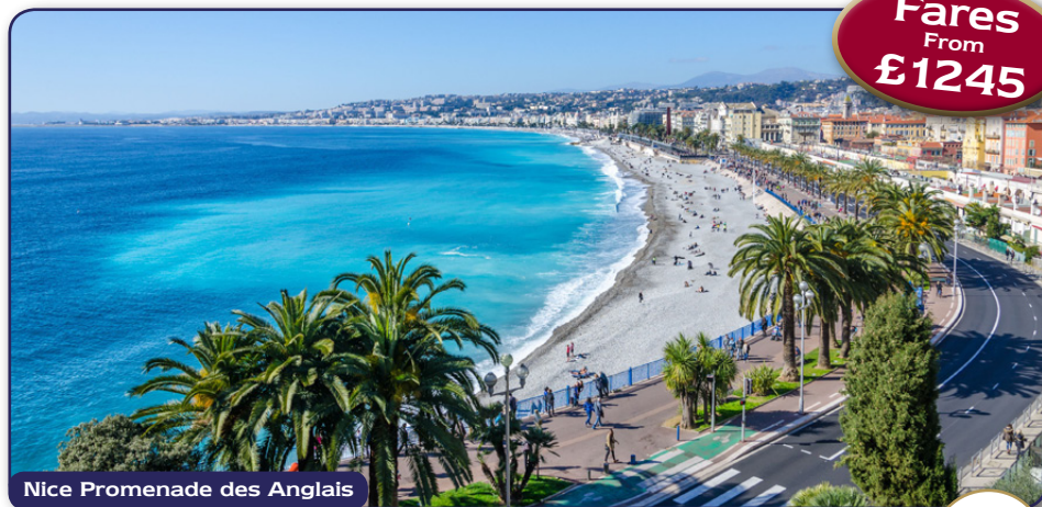
Nice Promenade des Anglais

The French Riviera! We visit some of the most famous destinations including a boat trip to sensational St Tropez and the scenic rail journey along the stunning coastal route to visit Monte Carlo.