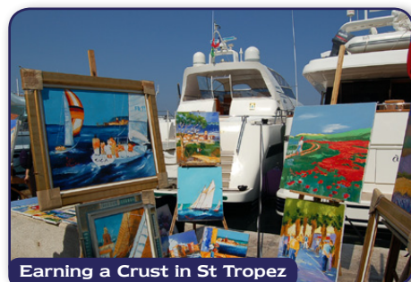
Earning a Crust in St Tropez

Situated in a heart of the town the hotel benefits from its superb location, right on the Mediterranean marina waterfront, a short stroll from the city centre and railway station. Each well-appointed room features cable satellite TV, internet access, air-conditioning, safe, minibar and hairdryer.