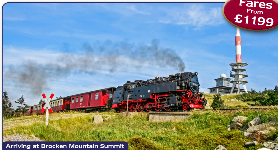
Arriving at Brocken Mountain Summit

A First Class rail holiday to enjoy picturesque towns and villages surrounded by a panoramic range of rocky crags romantic valleys, and fairytale woods - full of folklore, witches and steam trains.