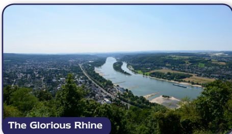
The Glorious Rhine

Today we head for the opposite bank of the Rhine by ferry and railway, travelling first