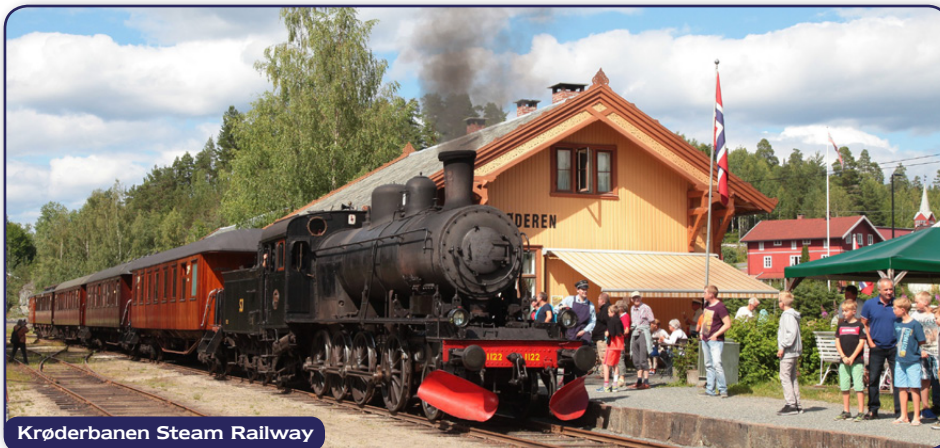
Krøderbanen Steam Railway