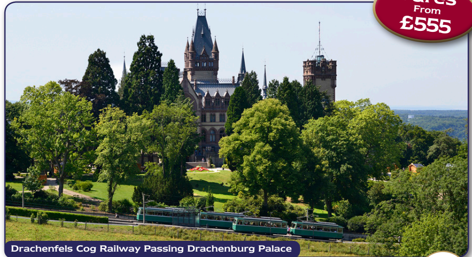
Drachenfels Cog Railway Passing Drachenburg Palace