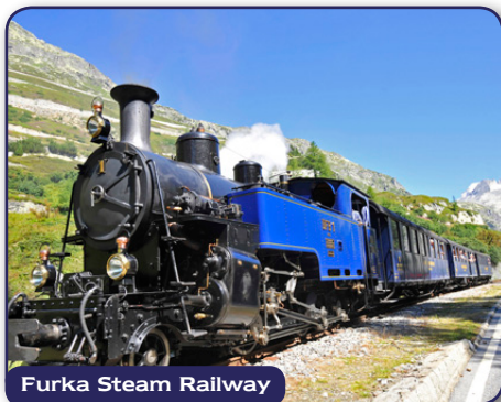
Furka Steam Railway

Joining a train to Thun, we set sail on Lake Thun towards Interlaken. On arrival we catch