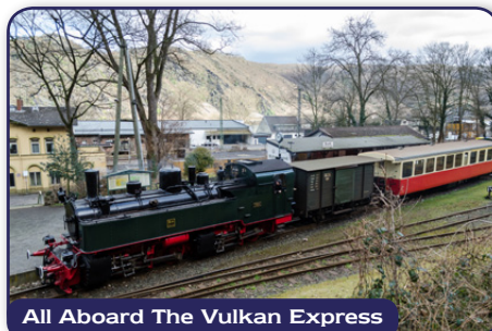
All Aboard The Vulkan Express

Leaving Remagen, we change trains onto the high speed line in Cologne. In Brussels we join the Eurostar service to London St Pancras. (B)