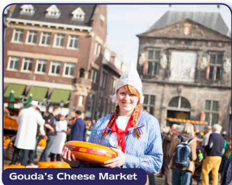
Gouda's Cheese Market

We journey to Keukenhof , "the most beautiful spring garden in the world", open just a few weeks each year, where awesome swathes of tulips, crocuses and daffodils burst out of the rolling countryside. Huge rivers of colour beneath great avenues of trees: some of the world's greatest collection of bulbs including over 1,000 varieties of tulip . Enjoy the 79 acres of park and gardens, strolling some