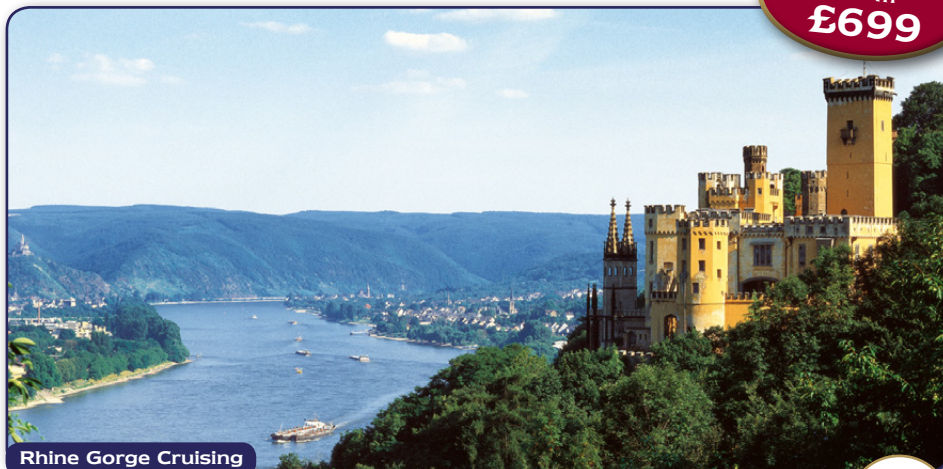
Rhine Gorge Cruising

Stay in a wine village at the heart of the Rhine Gorge, exploring the romantic Rhine and Moselle Valleys by rail and riverboat, and visiting a wide variety of winemakers to discover the region's wealth of wine culture.