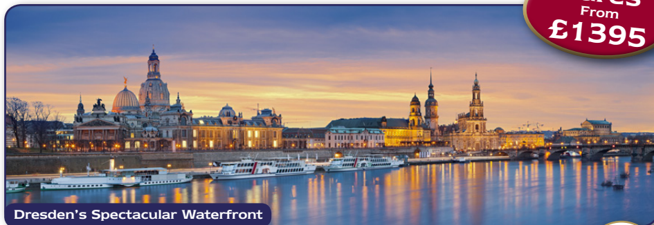
Dresden's Spectacular Waterfront

We have been taking steam enthusiasts to Saxony for many years to discover some of Germany's best narrow-gauge railways, but here is a tour with broader appeal, featuring funicular railways, steam lines, trams and river steam boats, plus Meissen porcelain, castles, gardens, the beautiful city of Dresden and the enthralling landscape of Saxon Switzerland. Introducing the Magnificent Seven!