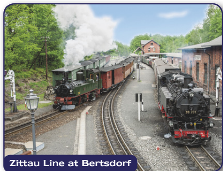
Zittau Line at Bertsdorf

Our rail adventure continues southwards into the Ore Mountains and the village of Cranzahl. Here we board the Fichtelbergbahn Steam Railway , taking a fabulously scenic 17 km route, skirting the border with the Czech Republic through the Ore Mountains to Oberwiesenthal, Germany's highest town (B,D)