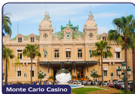
Monte Carlo Casino

After breakfast we take the TGV to Lille Europe and Eurostar to London St Pancras, arriving early evening. (B,E)