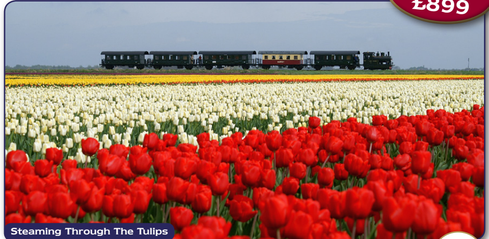
Steaming Through The Tulips

of the 15kms of footpaths to explore the many themed pavilions, flower shows and " inspirational " gardens with ideas to recreate at home. In the afternoon we transfer to our hotel in the cheese capital, Gouda , the Best Western Gouda, with dinner provided in the hotel restaurant. (B,D)