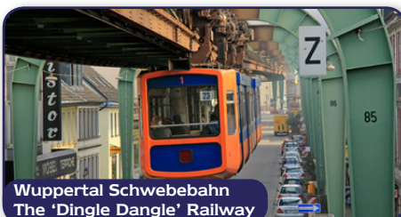
Wuppertal Schwebebahn The 'Dingle Dangle' Railway

This stylish, English-speaking, 4 star hotel is close by the historic Old Town, and features modern, comfortable en-suite rooms. Enjoy culinary delights in the buffet restaurant and relax in the Berliner Ziller bar or Top Fit Club.