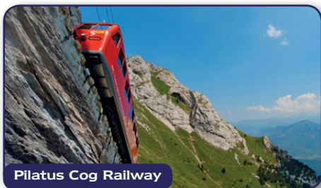
Pilatus Cog Railway

A day at leisure in Hergiswil allows you the opportunity to relax and unwind by lovely Lake