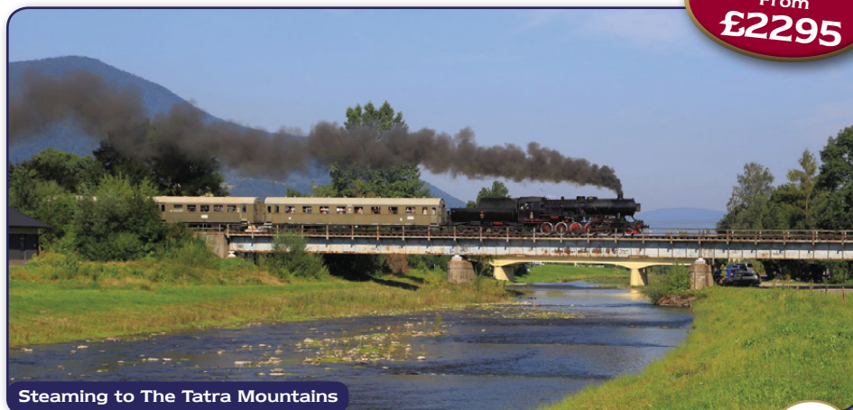
Steaming to The Tatra Mountains

Our brand new tour to Poland is centred for the first time around the Parowozjada Steam Festival at Chabowka , with steam excursions including Zakopane in the Tatra Mountains . Add to this an extended stay in beautiful Krakow , the Wieliczka Salt Mines , fascinating Warsaw and the unique city of Berlin , with a visit to the International Garden Show , for an extended rail and steam adventure.