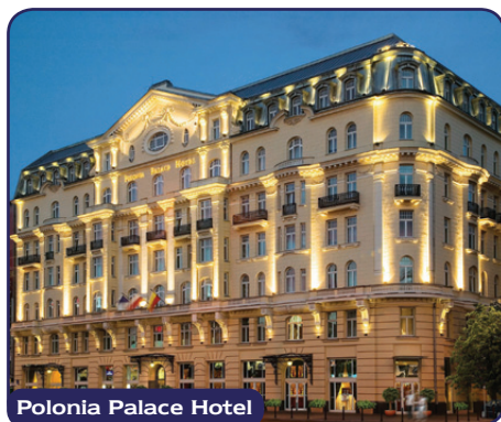
Polonia Palace Hotel