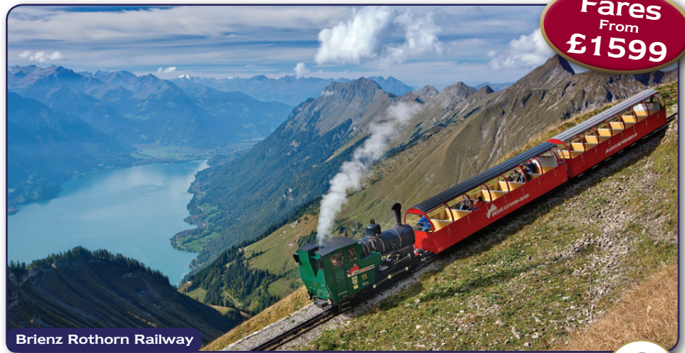
Brienz Rothorn Railway

Switzerland and steam trains - a delightful combination as we take you to the heart of this beautiful country to experience some amazing mountain rail journeys and glorious lake steamer cruises.