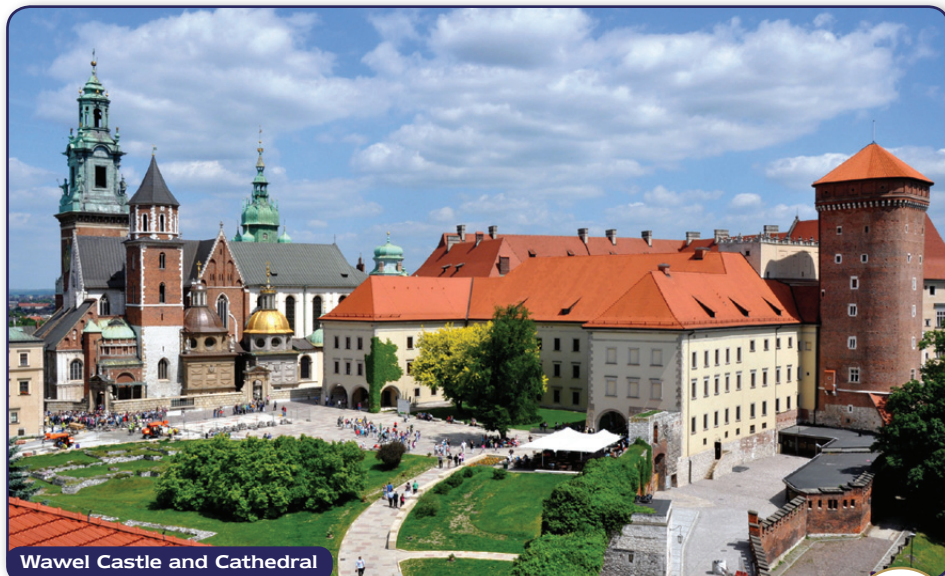
Wawel Castle and Cathedral