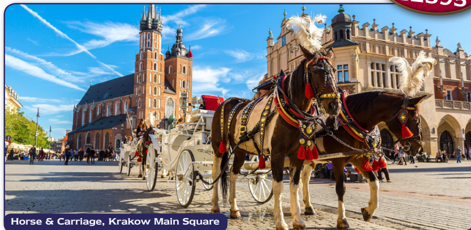
Horse & Carriage, Krakow Main Square