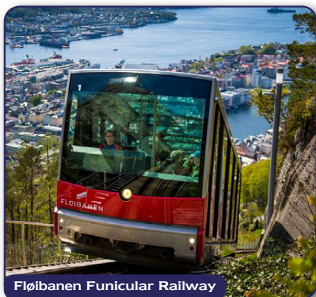
Fløibanen Funicular Railway

Leaving Bergen by Express Boat , we cruise through the coastal archipelago and into