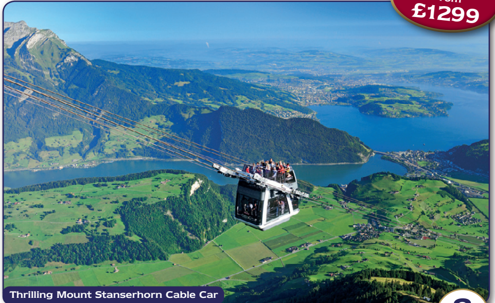
Thrilling Mount Stanserhorn Cable Car

Lucerne and maybe take full advantage of the hotel's leisure facilities . Alternatively, you can use your local transport pass to visit Lucerne itself, with its famous Chapel Bridge and Transport Museum. (B,D)