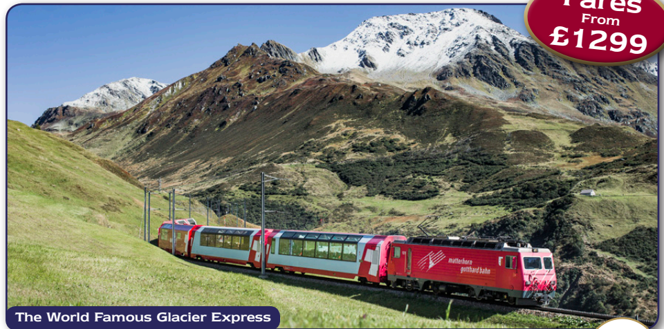
The World Famous Glacier Express

Two of the world's greatest railway journeys on one tour! Enjoy the classic Glacier Express journey across the Swiss Alps, followed by the Bernina Express in its full glory. Not forgetting Lausanne, Montreux and St Moritz , plus stays on Lake Geneva and in the Engadine Valley .