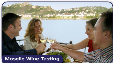
Moselle Wine Tasting

Today we make the short journey around the headland along the Rhine to Rudesheim , arguably the most famous village in the Rhine Valley. Here you will have free time to explore the beautiful quaint Drosselgasse, where you will find enticing speciality shops featuring the locally produced Riesling wine, and maybe visit Siegfried's Mechanical Music Museum, which houses 350 self-playing musical instruments spanning three centuries. We meet for a rustic-style lunch in a local wine cellar , where we also enjoy a tour and tasting of three local wines . (B,L,D)