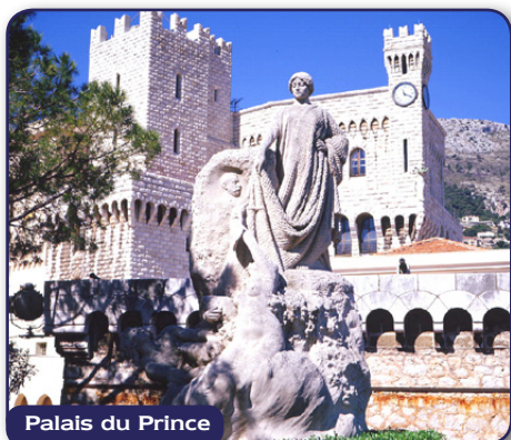
Palais du Prince

After breakfast we take to the water for a full day in St Tropez . The town is the playground of the rich and famous who, like you, are here to soak up the atmosphere and enjoy the wonderful surroundings. The marina is well worth visiting for the spectacle, and you never know who you may bump into! (B,D)