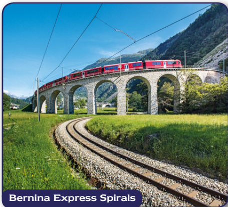
Bernina Express Spirals

One of the great railway journeys of the world awaits today. First we leave Lake Geneva,