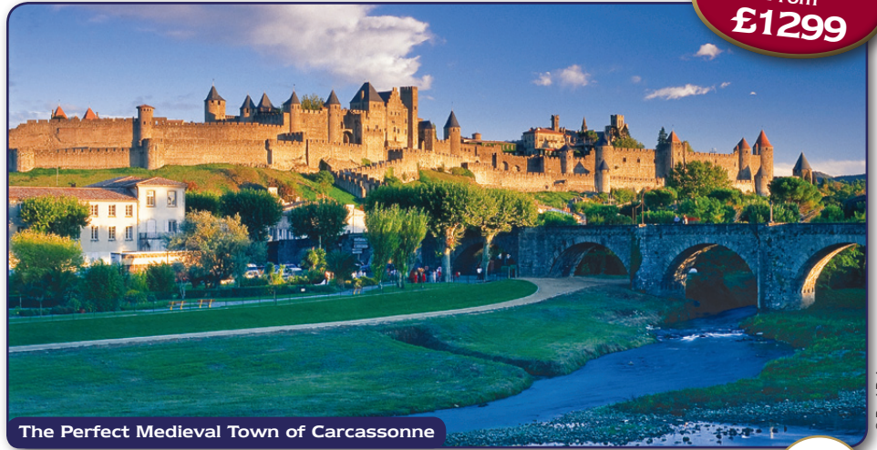
The Perfect Medieval Town of Carcassonne

Travel in First Class style to the South of France. Relax in a beachside hotel, explore the rocky coves of the Catalan Coast, tasting local specialities, visit colourful Barcelona, the Pyrenees and the perfect medieval walled city of Carcassonne.