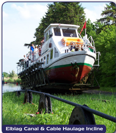
Elblag Canal & Cable Haulage Incline

We depart London St Pancras by Eurostar to Brussels and onwards along the high-speed line to Berlin for three nights at the InterCity Hotel Hauptbahnhof. (D)