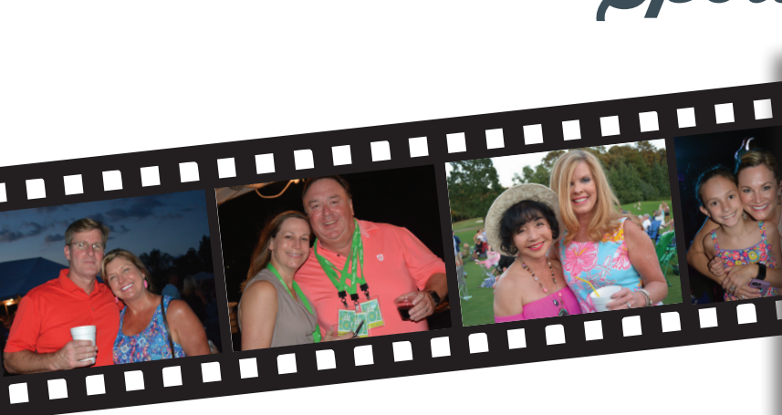
Groove on the Green