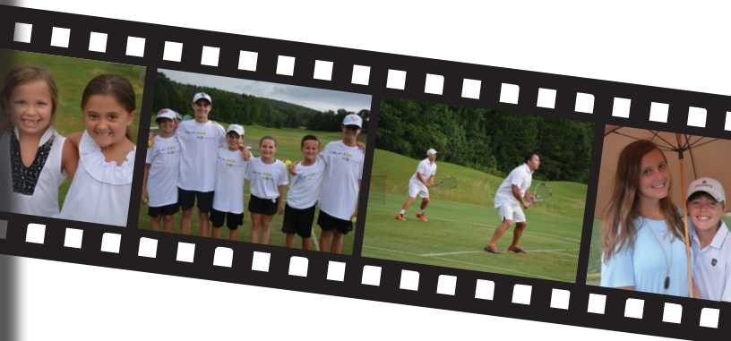
Inaugural Wimbledon at Greystone