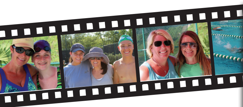
Greystone Gators Swim Meet