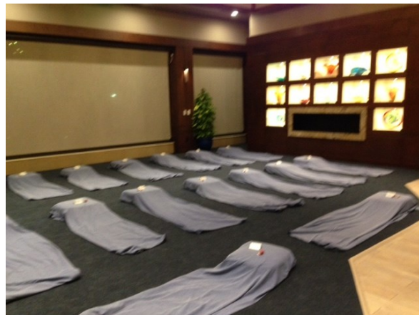
Left is the Grill Room, right is the Grill Room additional room ready for guests. The Club did a great job.