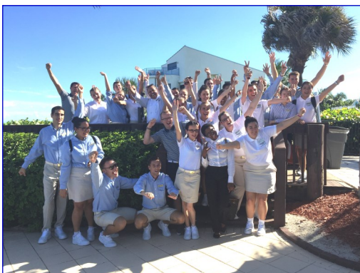
OUR NEW FOOD AND BEVERAGE TRAINEES ENJOYING FRENCHMAN'S CREEK