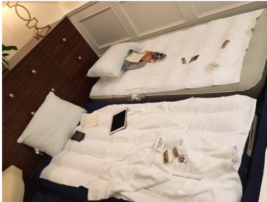
Candy to make the night sweeter