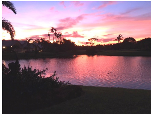
Sunset October 8th