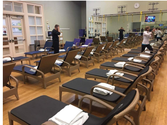
Staff housed in Fitness Center