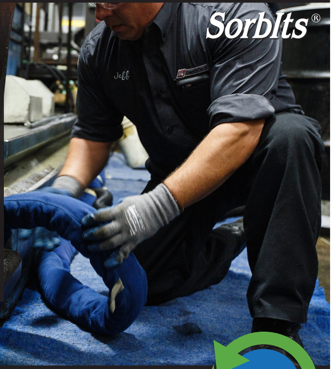
Pictured: SorbIts® SuperSocks™ and SorbIts® Natural Mats