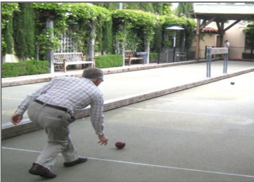
Bocce Ball 3:30 p.m.