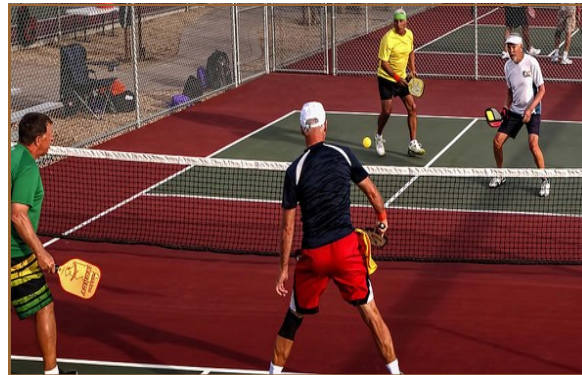
Pickle Ball 2:00 p.m.