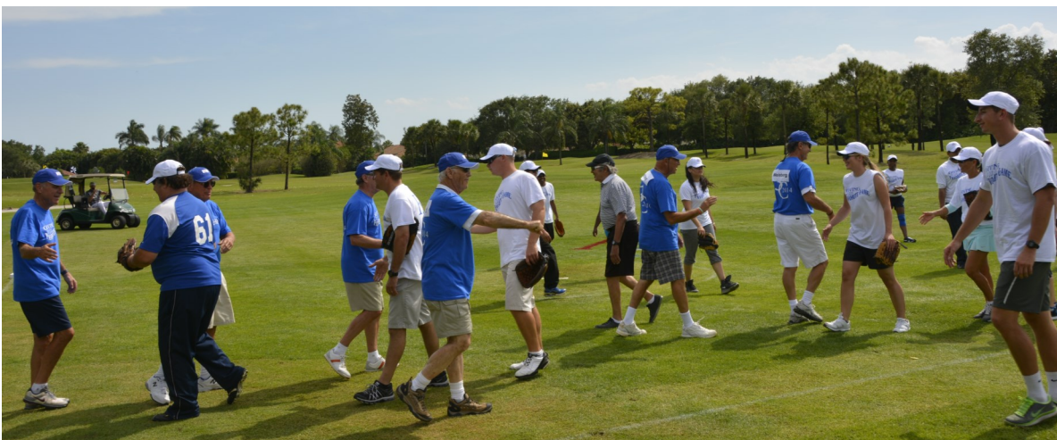
Softball Game with Booze and Bites