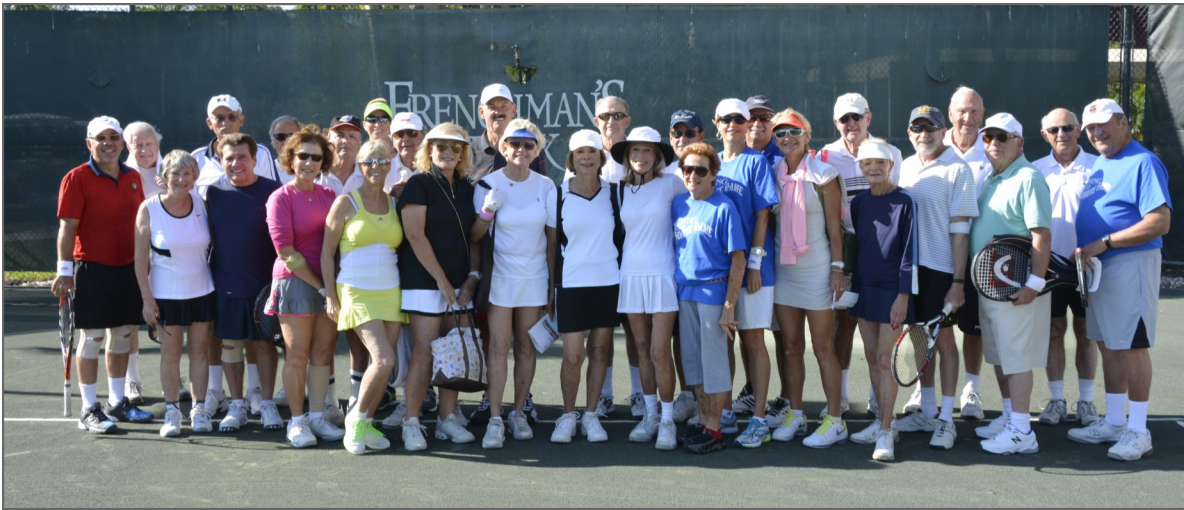
Pro-Am Tennis and Luncheon