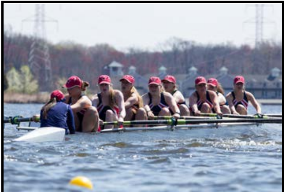
2015 WOMEN’S ROSTER

TWITTER: @RMUATHLETICS FACEBOOK: /RMUATHLETICS