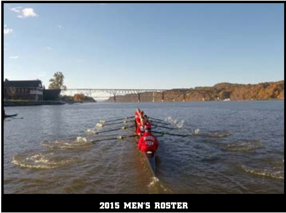
2015 MEN'S ROSTER