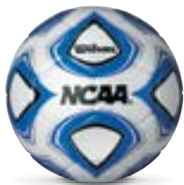
NCAA® FORTE FYBRID™ WTH9905XB: Official Size

The distance between your dreams and reality becomes a little shorter with Wilson®. We create soccer equipment with revolutionary technology and unparalleled craftsmanship. That's why we're the Official Match Ball of the NCAA® Championships.