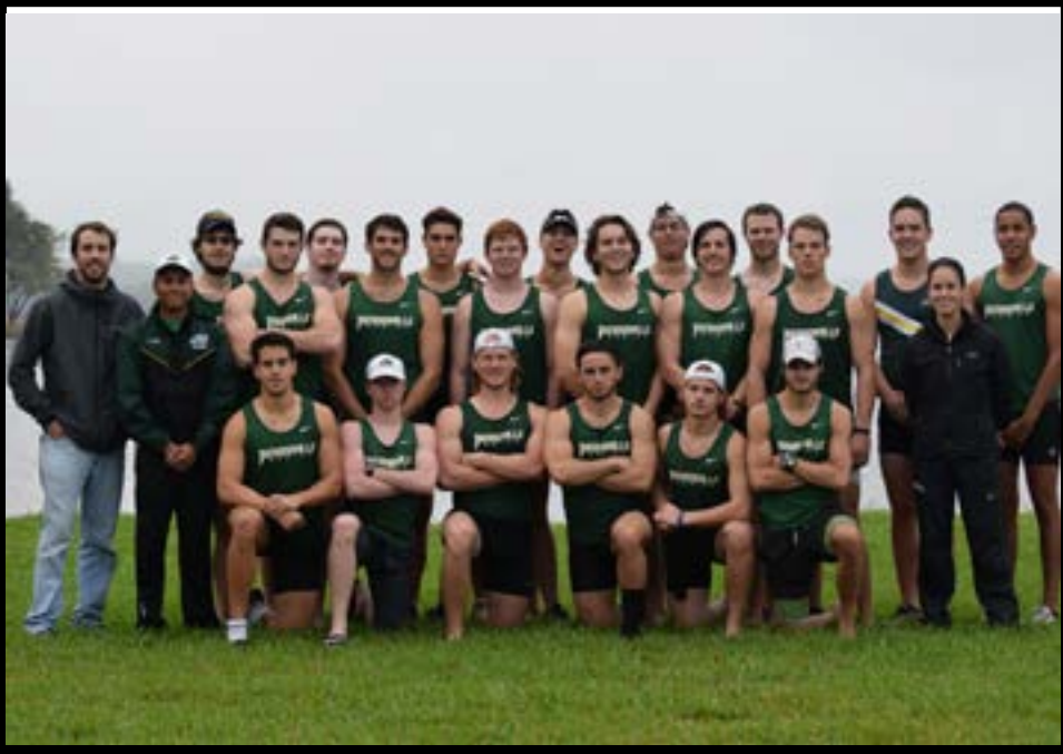
2015 MEN'S ROSTER