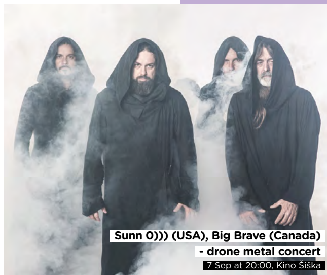
Sunn O))) (USA), Big Brave (Canada)