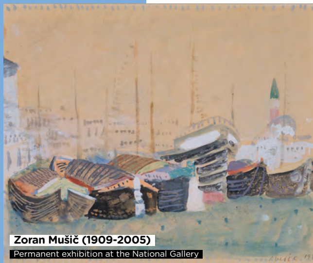
Zoran Mušič (1909-2005)

Permanent exhibition at the National Gallery