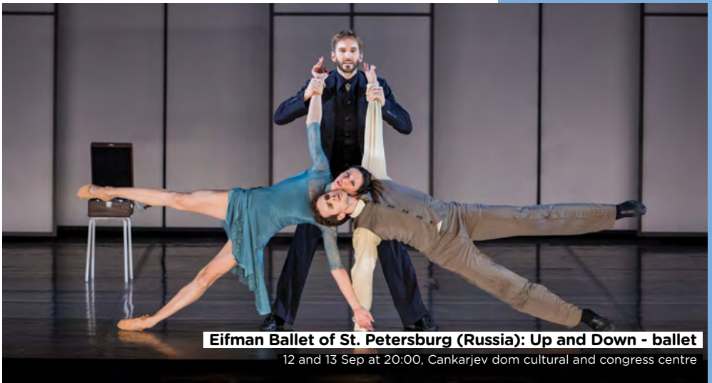
Eifman Ballet of St. Petersburg (Russia): Up and Down - ballet