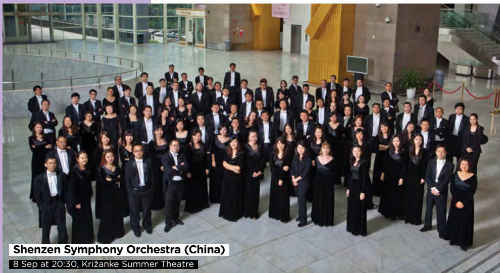
Shenzhen Symphony Orchestra (China)