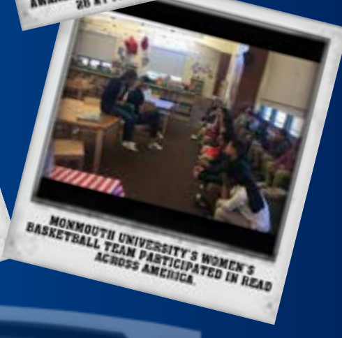
MONMOUTH UNIVERSITY'S WOMEN'S BASKETBALL TEAM PARTICIPATED IN READ ACROSS AMERICA.

Under the Geico GoodWorks Program structure, MAAC member schools who have completed community service projects will be featured each month throughout the academic year. Monthly releases will be published and archived on MAACSports.com that highlight the volunteer efforts of MAAC schools during that month.