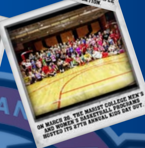
ON MARCH 20, THE MARIST COLLEGE MEN'S AND WOMEN'S BASKETBALL PROGRAMS HOSTED ITS 27TH ANNUAL KIDS DAY OUT.