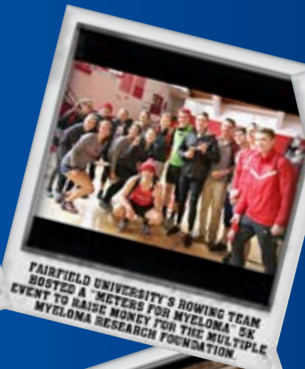
FAIRFIELD UNIVERSITY'S ROWING TEAM HOSTED A "METERS FOR MYELOMA" 5K EVENT TO RAISE MONEY FOR THE MULTIPLE MYELOMA RESEARCH FOUNDATION.