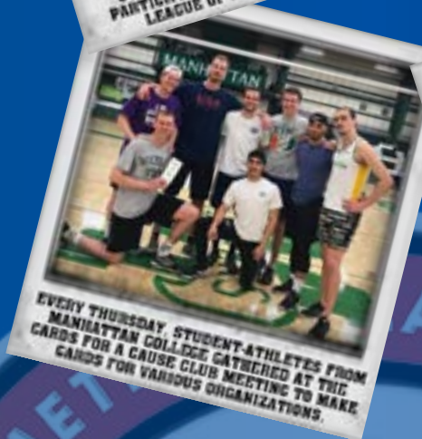
EVERY THURSDAY, STUDENT-ATHLETES FROM MANHATTAN COLLEGE GATHERED AT THE CARDS FOR A CAUSE CLUB MEETING TO MAKE CARDS FOR VARIOUS ORGANIZATIONS.