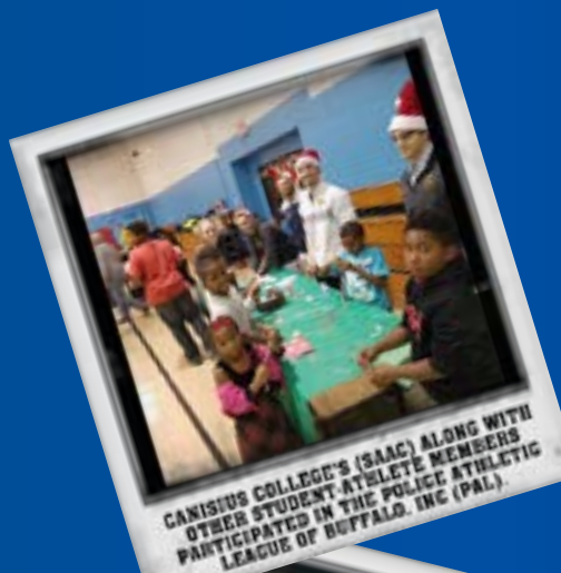
CANISIUS COLLEGE'S (SAAC) ALONG WITH OTHER STUDENT-ATHLETE MEMBERS PARTICIPATED IN THE POLICE ATHLETIC LEAGUE OF BUFFALO, INC. (PAL).