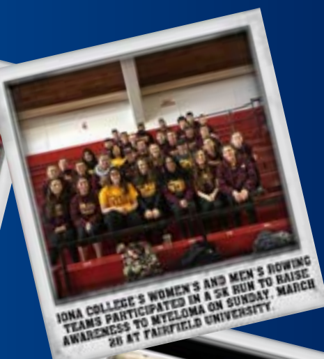
IONA COLLEGE'S WOMEN'S AND MEN'S ROWING TEAMS PARTICIPATED IN A 5K RUN TO RAISE AWARENESS TO MYELOMA ON SUNDAY, MARCH 20 AT FAIRFIELD UNIVERSITY.