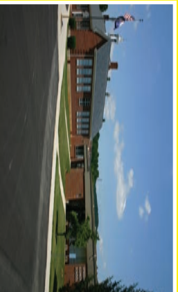
Speedwell Elementary School