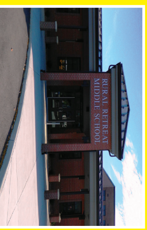
Rural Retreat Middle School