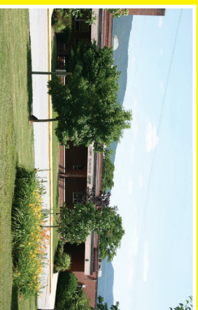
Wythe County Technology Center