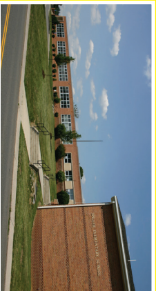
Spiller Elementary School