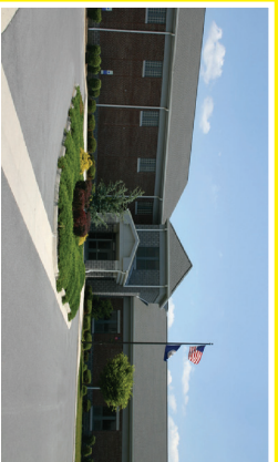
Rural Retreat Elementary School