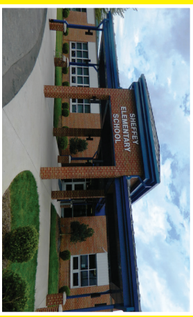
Sheffey Elementary School