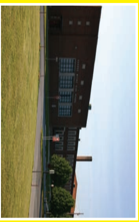
George Wythe High School