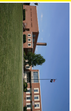
Fort Chiswell High School