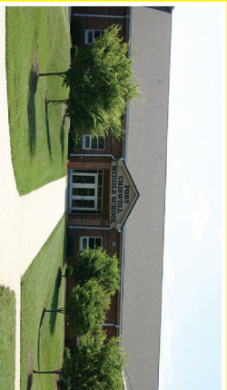
Fort Chiswell Middle School