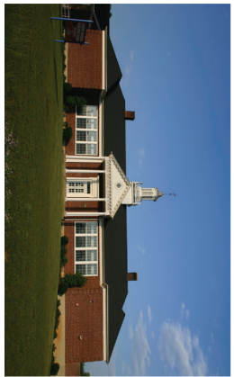
Jackson Memorial Elementary School