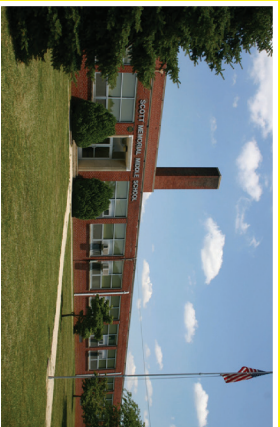
Scott Memorial Middle School