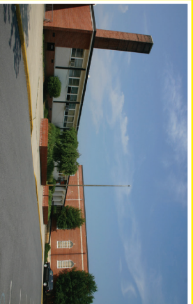
Rural Retreat High School