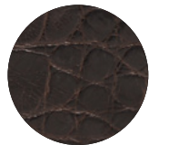
Chocolate Handles—Price Upon Request