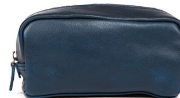
George Mini Dopp Kit—$115 7.5"L x 4"H x 2.5"W