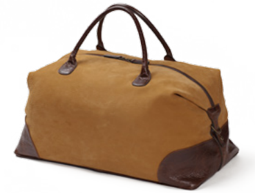
Nubuck Bison Tan—$925