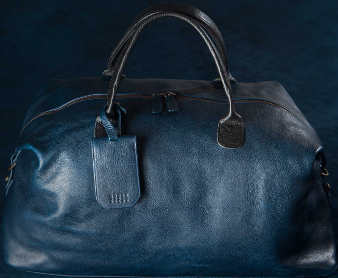
BENEDICT WEEKEND BAG—$860