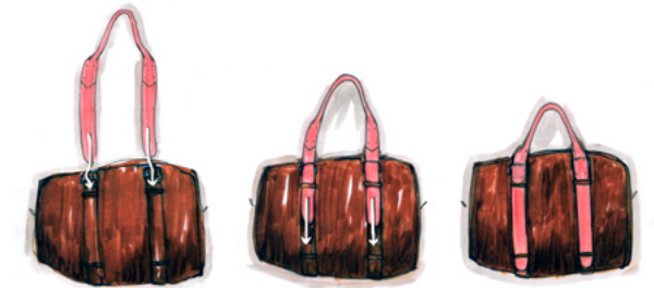
1. SELECT 2. SLIDE 3. SECURE

18"L x 13.5"H x 8.5"W Exterior: Italian Leather & Hardware Interior: Woven Jacquard Lining Includes Shoulder Strap