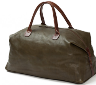
Titan Milled Olive—$860