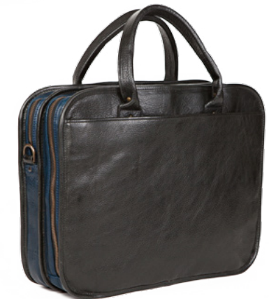
Miller Standard Attaché—$860 16.5"L x 12.5"H x 3.5"W (Includes Shoulder Strap)