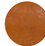
Modern Saddle Handles—$285