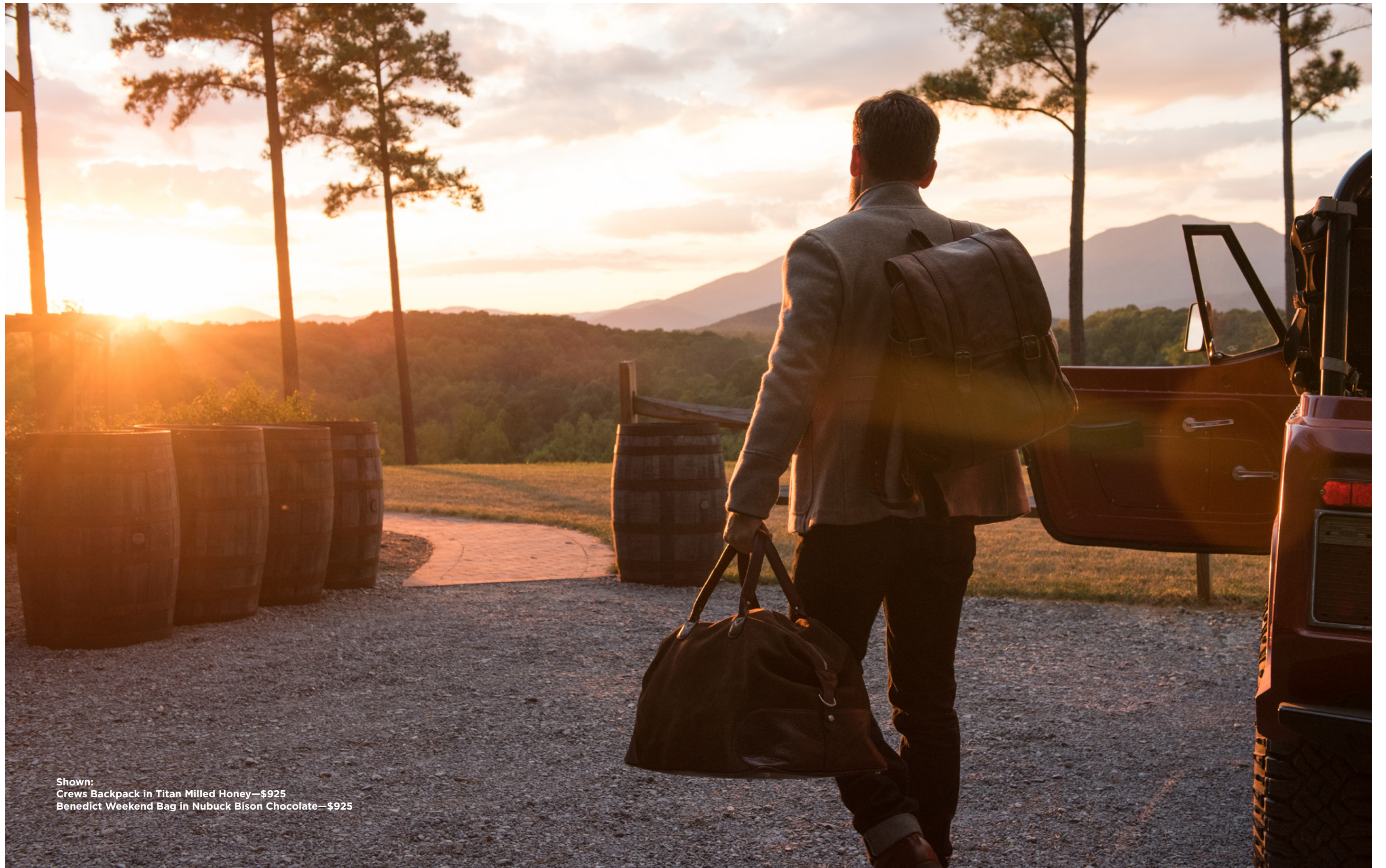
Shown: Crews Backpack in Titan Milled Honey—$925 Benedict Weekend Bag in Nubuck Bison Chocolate—$925