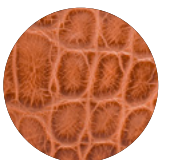
Tan Handles—Price Upon Request