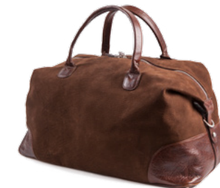
Nubuck Bison Chocolate—$925