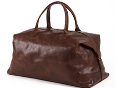
Titan Milled Brown—$860