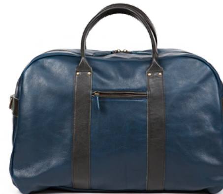
Taylor Duffel—$810 18"L x 13"H x 8"W (Includes Shoulder Strap)

For additional leathers, visit mooreandgiles.com