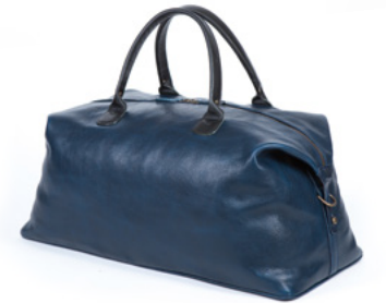
Titan Milled Navy—$860