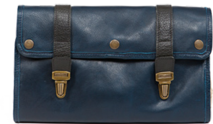
Austin Hanging Dopp Kit—$325 12.5"L x 18.5"H x 1.5"W (Open)