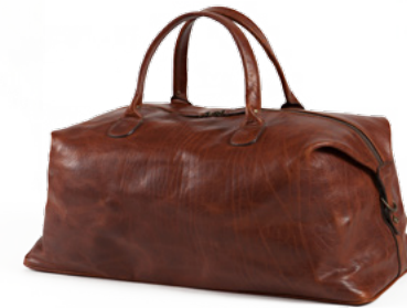
Titan Milled Honey—$860