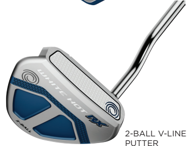
2-BALL V-LINE PUTTER