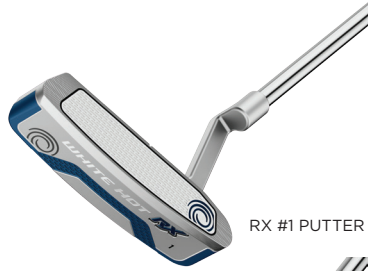
RX #1 PUTTER

#1 Putter in Golf claim based on combined wins and usage from 2004 — present on the PGA, EPGA, JGTO, Web.com, Champions and LPGA Tours, as reported by the Darrell Survey Co. and Sports Marketing Surveys, Inc. 150438