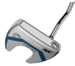
RX V-LINE FANG

#1 Putter in Golf claim based on combined wins and usage from 2004 — present on the PGA, EPGA, JGTO, Web.com, Champions and LPGA Tours, as reported by the Darrell Survey Co. and Sports Marketing Surveys, Inc. 150438