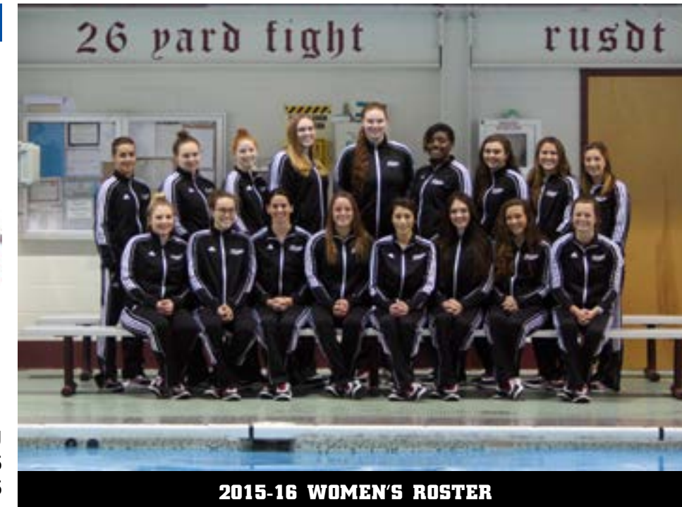
2015-16 WOMEN'S ROSTER