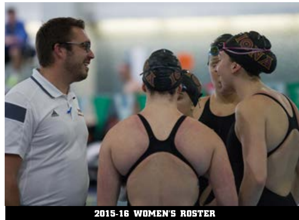
2015-16 WOMEN'S ROSTER