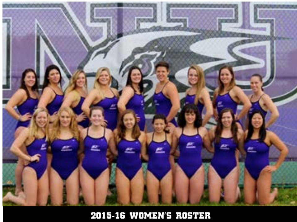
2015-16 WOMEN'S ROSTER