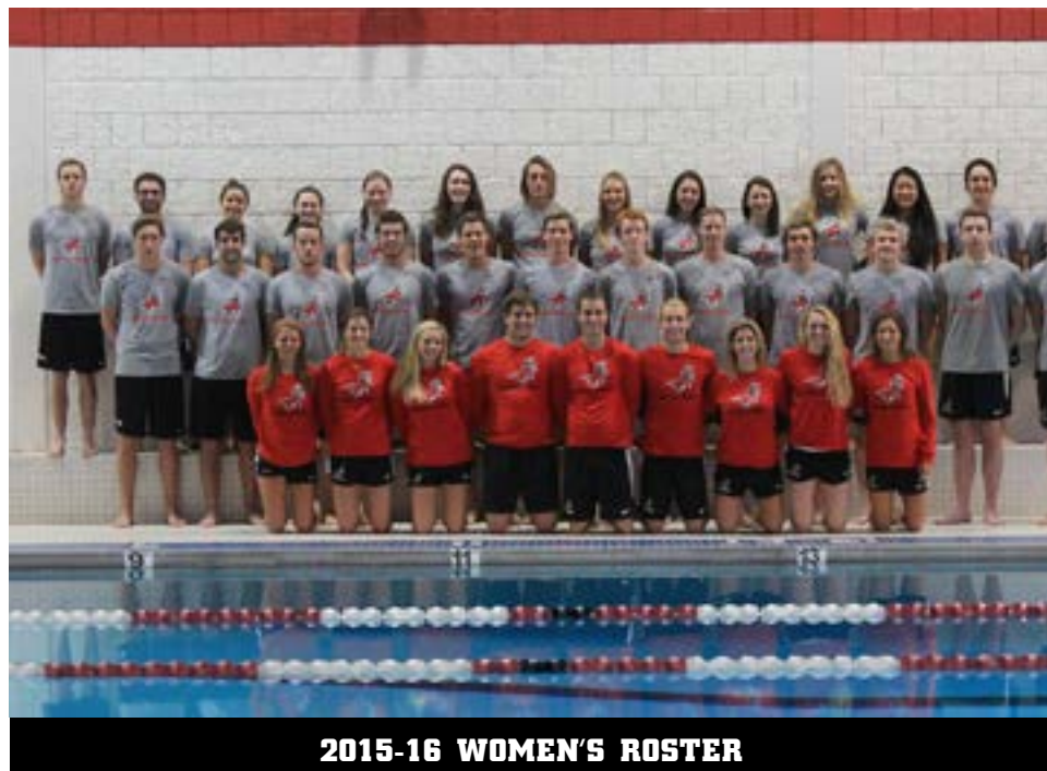
2015-16 WOMEN'S ROSTER

TWITTER: @FAIRFIELDSTAGS FACEBOOK: /FAIRFIELDUATHLETICS