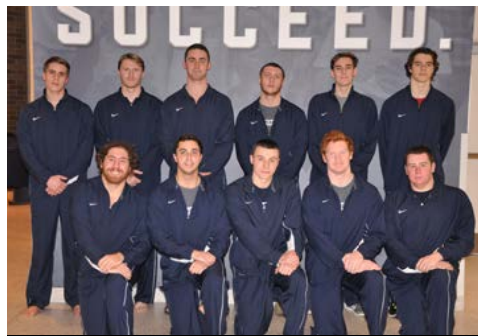
2015-16 MEN'S ROSTER