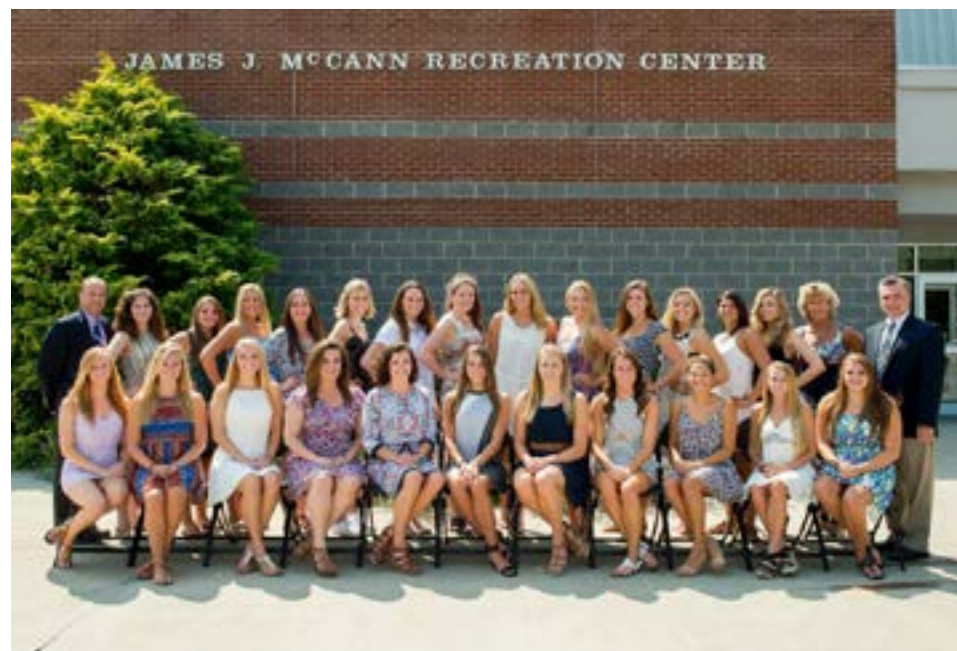
2015-16 WOMEN'S ROSTER