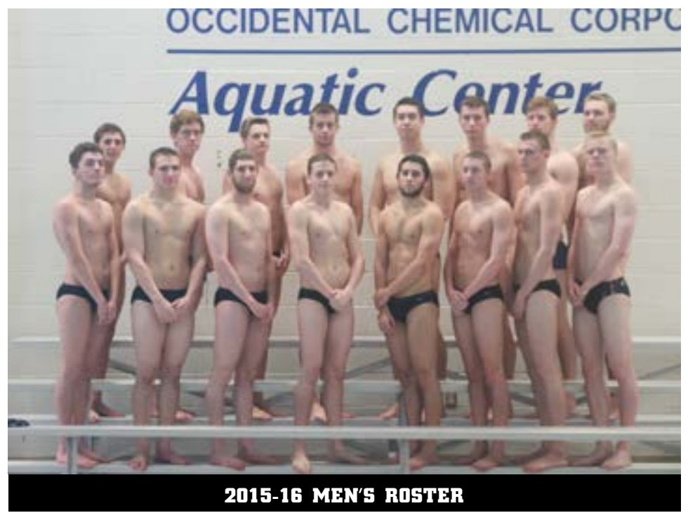
2015-16 MEN'S ROSTER

TWITTER: @NUPURPLEEAGLES FACEBOOK: /PURPLEEAGLES