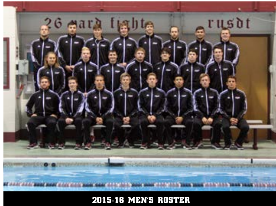
2015-16 MEN'S ROSTER