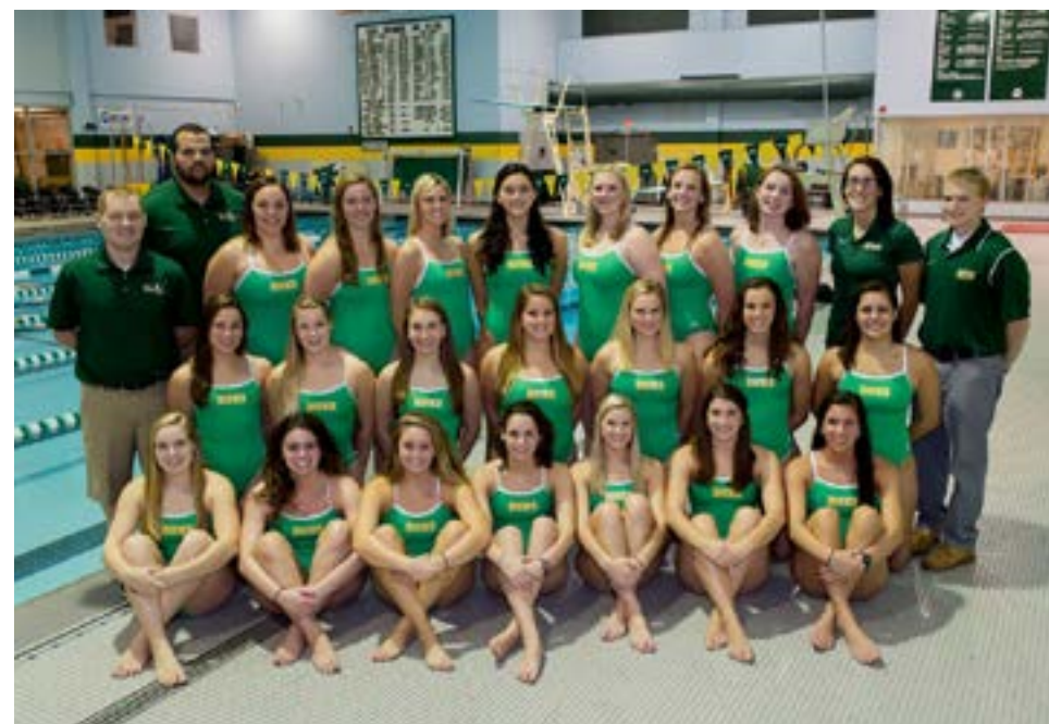
2015-16 WOMEN'S ROSTER