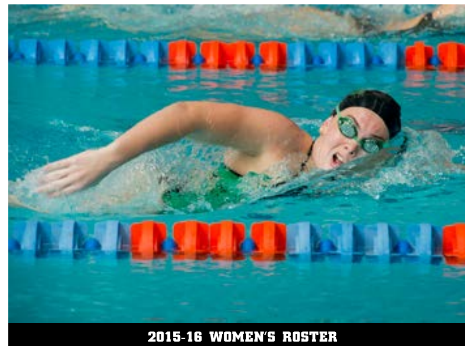
2015-16 WOMEN'S ROSTER