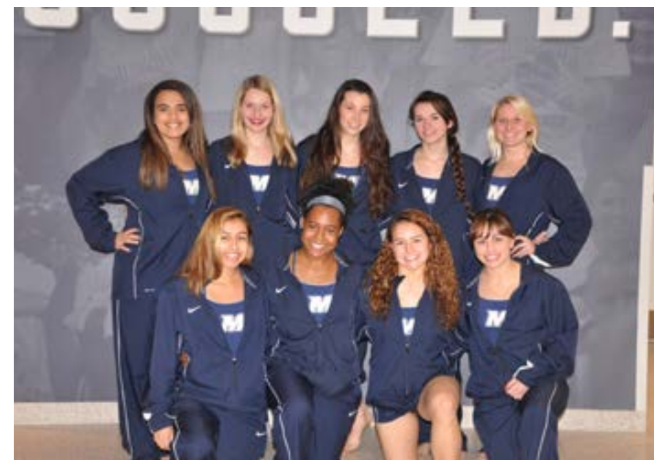
2015-16 WOMEN'S ROSTER