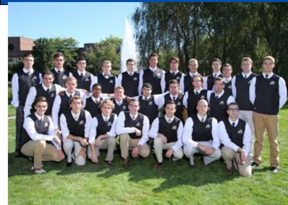
2015-16 MEN'S ROSTER