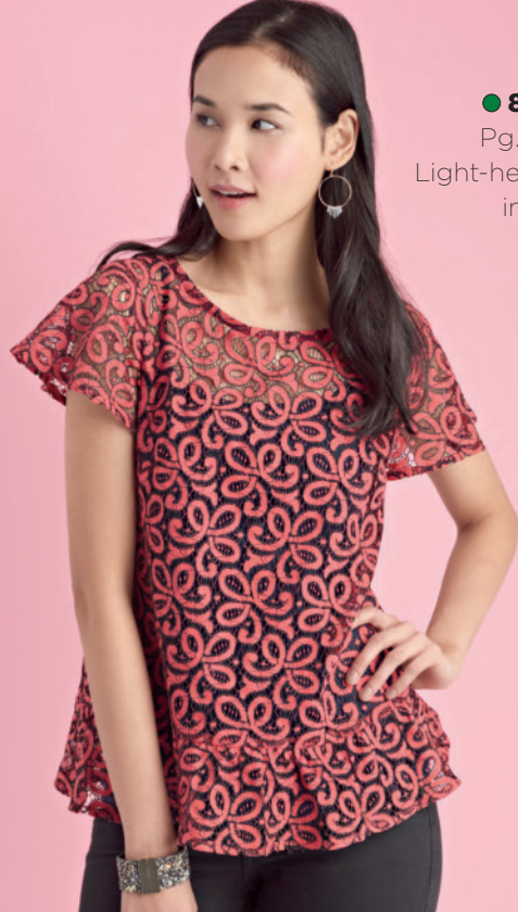
● 8417 / Pg. 261 / Light-hearted in lace.