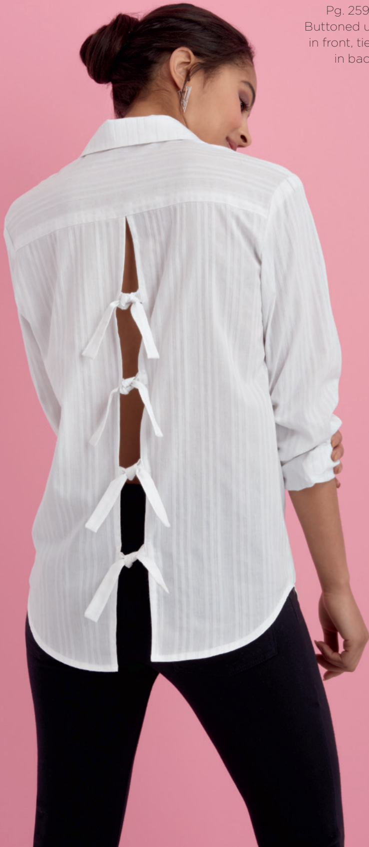
● 8416 / Pg. 259 / Buttoned up in front, tied in back.

Ready-to-wear details to make your top of-the-moment