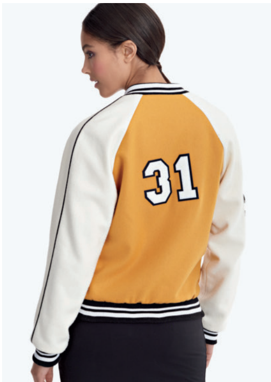
● 8418 / Pg. 257 / The varsity look is back!

Make your own fashion statement, whether trendy, sporty or minimalist.