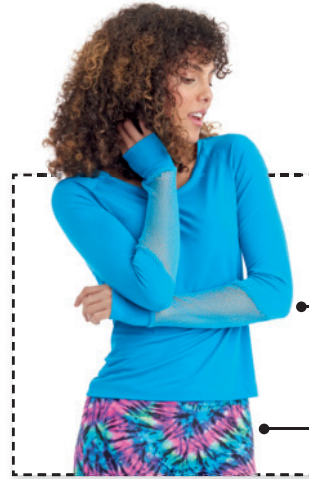
● 8423 / Pg. 258 Mesh top to keep you cool.