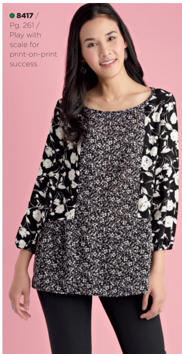
● 8417 / Pg. 261 / Play with scale for print-on-print success.