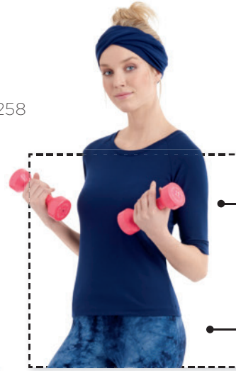
● 8423 / Pg. 258 Quarter sleeve top with head wrap.