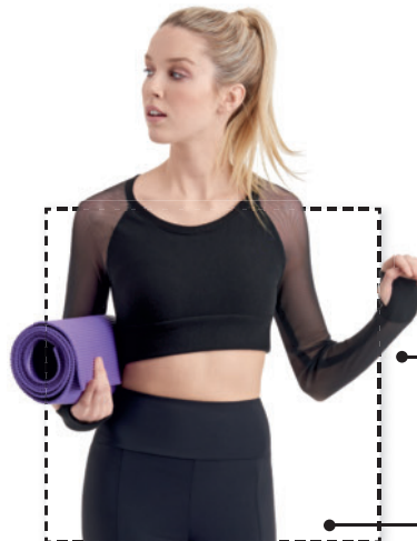
● 8423 / Pg. 258 Mesh crop top keep you cool.