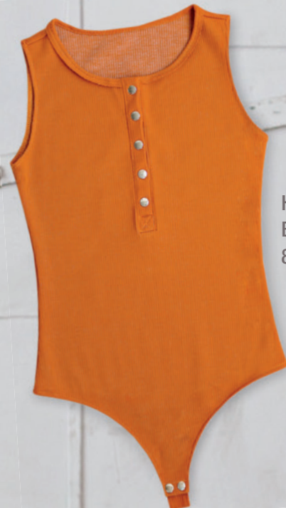
HENLEY BODYSUIT 8435

MORE OF MADDIE'S ADVENTURES ON INSTAGRAM @MMADALYNNE #BRAMAKINGWITHMADALYNNE