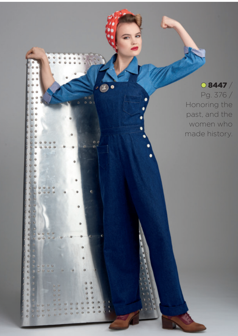
● 8447 / Pg. 376 / Honoring the past, and the women who made history.