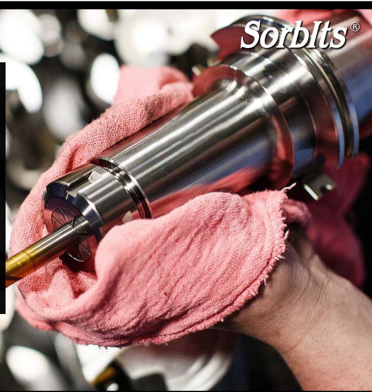
Pictured: Ultra™ Red Shop Towels