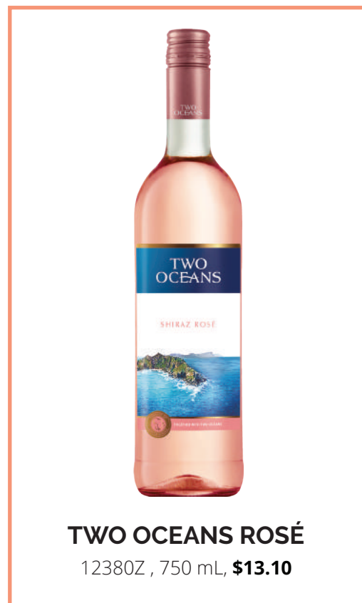
TWO OCEANS ROSÉ 12380Z , 750 mL, $13.10