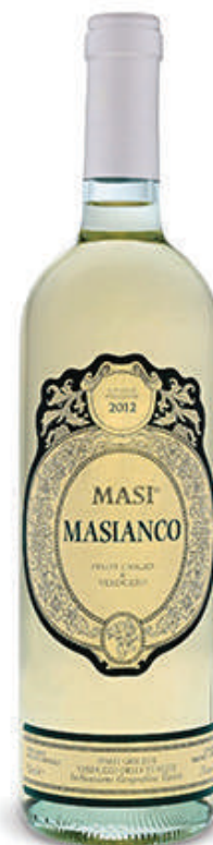
MASI MASIANCO 09485Z, 750 mL, $19.19