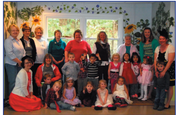
NRCA Floyd Head Start sponsored a Tea Party for the Floyd County Fine HeArts artists. Staff and children posed with members of Fine HeArts in front of the garden mural created by the artists for the Head Start classroom.

Also, 2014-2015 marked NRCA Head Start's first year of the federal Office of Head Start's new five-year grant cycle. The Office of Head Start shifted from a three-year review period to an annual review cycle. As a result of being a quality program, NRCA was one of only ninety-nine grantees nationwide awarded participation in the new Head Start Key Indicator Review, instead of the usual Comprehensive Review for the first review period.