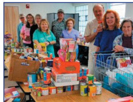
Volunteers sort and shelve donated food at the NRCA Floyd Food Pantry following the Stamp Out Hunger Food Drive .

I n the New River Valley, 1 in 8 people, including 1 in 5 children, are at risk of hunger. On May 13, 2015, local residents assembled bags non-perishable food and placed them by their mail boxes for the National Association of Letter Carriers' annual Stamp Out Hunger Food Drive . The mail carriers picked up the bags of food throughout the day and delivered them to NRCA's food pantries to help feed hungry low-income families. People were so generous with their contributions to the postal food drive, our pantries received enough food to last several months. Thanks to the generous donors, the mail carriers who put in long hours hauling bags of heavy food, and the NRCA volunteers who stocked the shelves, we went from empty pantries to full!