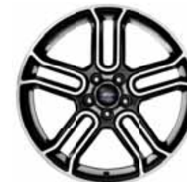
20" Painted-Black Aluminum with Machined Face Included with SEL Appearance Package