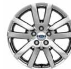
18" Chrome-Clad Aluminum Standard on Limited