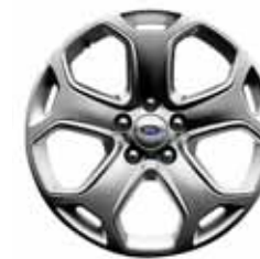
18" Painted Aluminum Standard