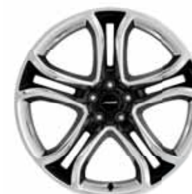
22" Polished Aluminum with Tuxedo Black Spoke Accents Standard on Sport