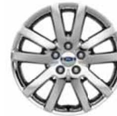
18" Chrome-Clad Aluminum Available