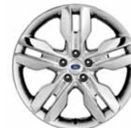
20" Chrome-Clad Aluminum Available on Limited