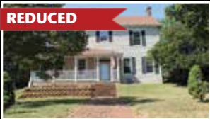
808682 - Beautiful remodeled home in one of Elkin's oldest neighborhoods. House had lots of older appeal with modern updates. A newly remodeled galley kitchen. A must see. $239,900