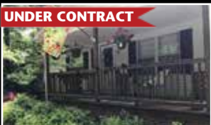
836452 - Partially wooded lot provides privacy, mature landscaping, fenced in level backyard, LG deck & porch. Heat pump, kitchen appliances, MBR/MBA w/ walk-in closet. Garage/workshop, carport, storage building. $95,000