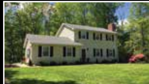
816169 - Remodeled kitchen w/ new windows, new doors, and paved driveway. Large MBR, huge bonus room, FP, and a 23'x9' deck. Close to shopping, schools, & churches. $169,900