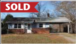
824389 - Perfect move in ready starter home in a great location. Convenient to shopping and schools. A must see! $72,500