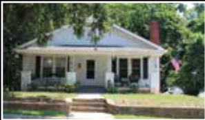
804286 - Beautiful, move-in ready home inside the city limits with lots of modern updates. Newly remodeled kitchen w/ granite counter tops & landscaped patio perfect for relaxing or cookouts. $129,900