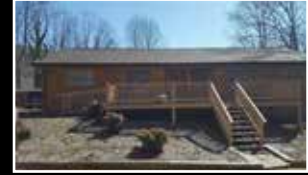
827447 - Nestled at the foot of the mountain these two Duplex include two rentals each with two bedrooms and one bath. Currently all four rentals have tenants that are on month to month. Both have well and septic. Please call for an appointment today! $215,000