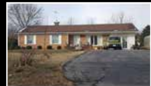
829995 - Must see! Great 3 bedroom 1 bath home with full basement. There is an unfinished bathroom in basement. Storm windows throughout (2013), new heat pump(2012), new roof (2011), new hot water heater (2013) All plumbing has been updated. Plenty of room inside with additional multiple buildings for storage outside on this 3+ acre parcel! $159,900