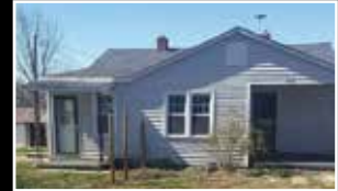
829888 - Perfect starter home or rental property. 3 bedroom, 1 bath home with gas logs in the living room. $59,900