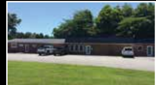
800018 - Commercial building located on Hwy 21 in State Road. A total of 3 separate spaces for rent. One has a tenant w/ 2 yr lease. Separate heat pumps, and separate bathrooms. Call for an appointment today. $249,000