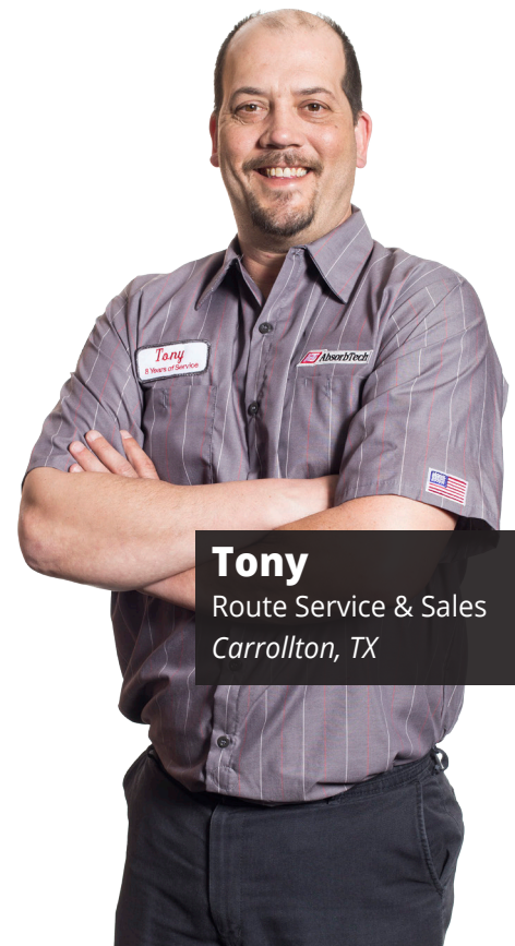
Tony Route Service & Sales Carrollton, TX