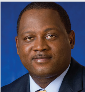
The Honourable Donville O. Inniss Minister of Industry, International Business, Commerce and Small Business Development, Barbados

Senator, The Honourable Maxine P. O. McClean is the Minister of Foreign Affairs, and Foreign Trade, Barbados. She is a graduate of the University of the West Indies, where she achieved a BSc in Public Administration and Ohio University, where she received an MBA and an MA in International Affairs. She also received a Fulbright Fellowship to Louisiana State University in 1986. During her academic career, she taught several management courses at UWI within the Department of Management Studies, in the Executive MBA and Executive Development Programmes of the Centre for Management Development, Barbados Institute of Management and Productivity, and Louisiana State University. Minister McClean has served as a Management Consultant with her own consulting firm, Strategic Interventions Inc.