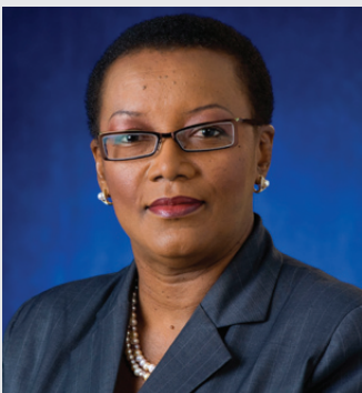
Senator, The Honourable P. O. Maxine McClean Minister of Foreign Affairs and Foreign Trade, Barbados