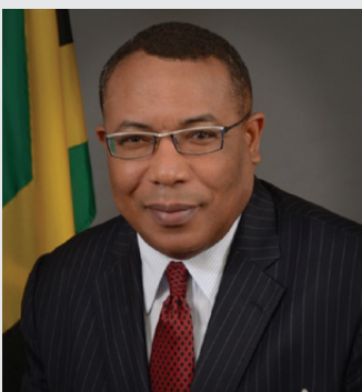
The Honourable G. Anthony Hylton Minister of Industry, Investment, and Commerce, Jamaica

The Honourable Donville O. Inniss was appointed Minister of Industry, International Business, Commerce and Small Business Development in March 2013. Prior to this appointment he served as Minister of Health and Minister of State, Ministry of Foreign Affairs and International Business. Prior to entering elective politics, Minister Inniss has worked for 20 years in the areas of Industrial Development, International Business and Export Promotion. Minister Inniss has also served as CEO, Managing Director and Chairman of several international companies based in Barbados, and for nine years operated his own management company. Minister Inniss has earned an MBA in General Management and a BSc in Public Administration from the University of the West Indies, Cave Hill Campus. He has also completed training in investment promotion, taxation, law and finance.