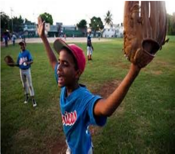
Kids enjoying a game of baseball on a hot summer afternoon.

Fortunately, I have a special program for Home Owners wanting to move and Buyers wanting to buy in Today's market that turns the tables on this CATCH 22.