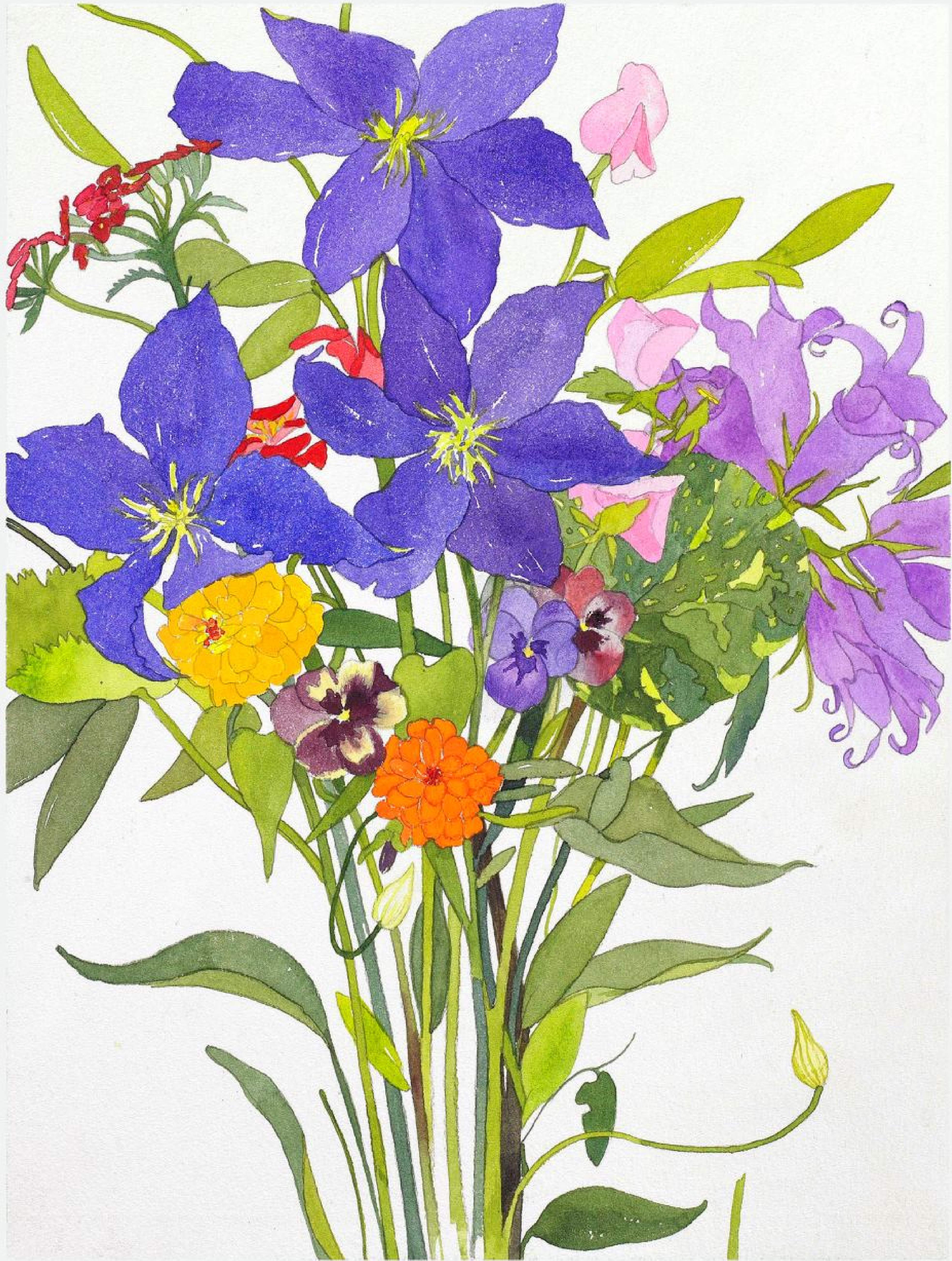
Blue Clematis 11 3 / 4 x 8 3 / 4 inches