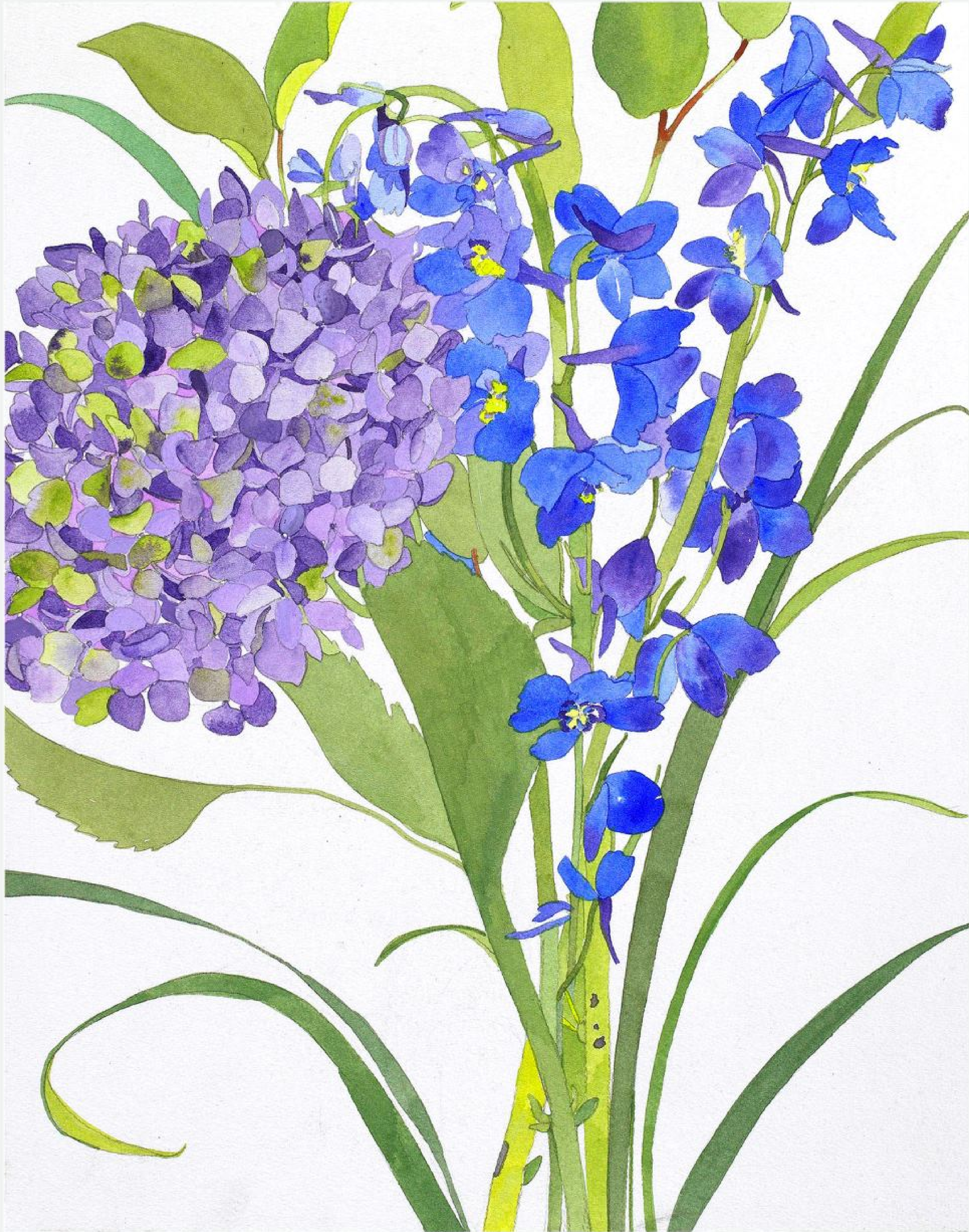
Hydrangea, Delphinium II 13 3 / 4 x 10 3 / 4 inches