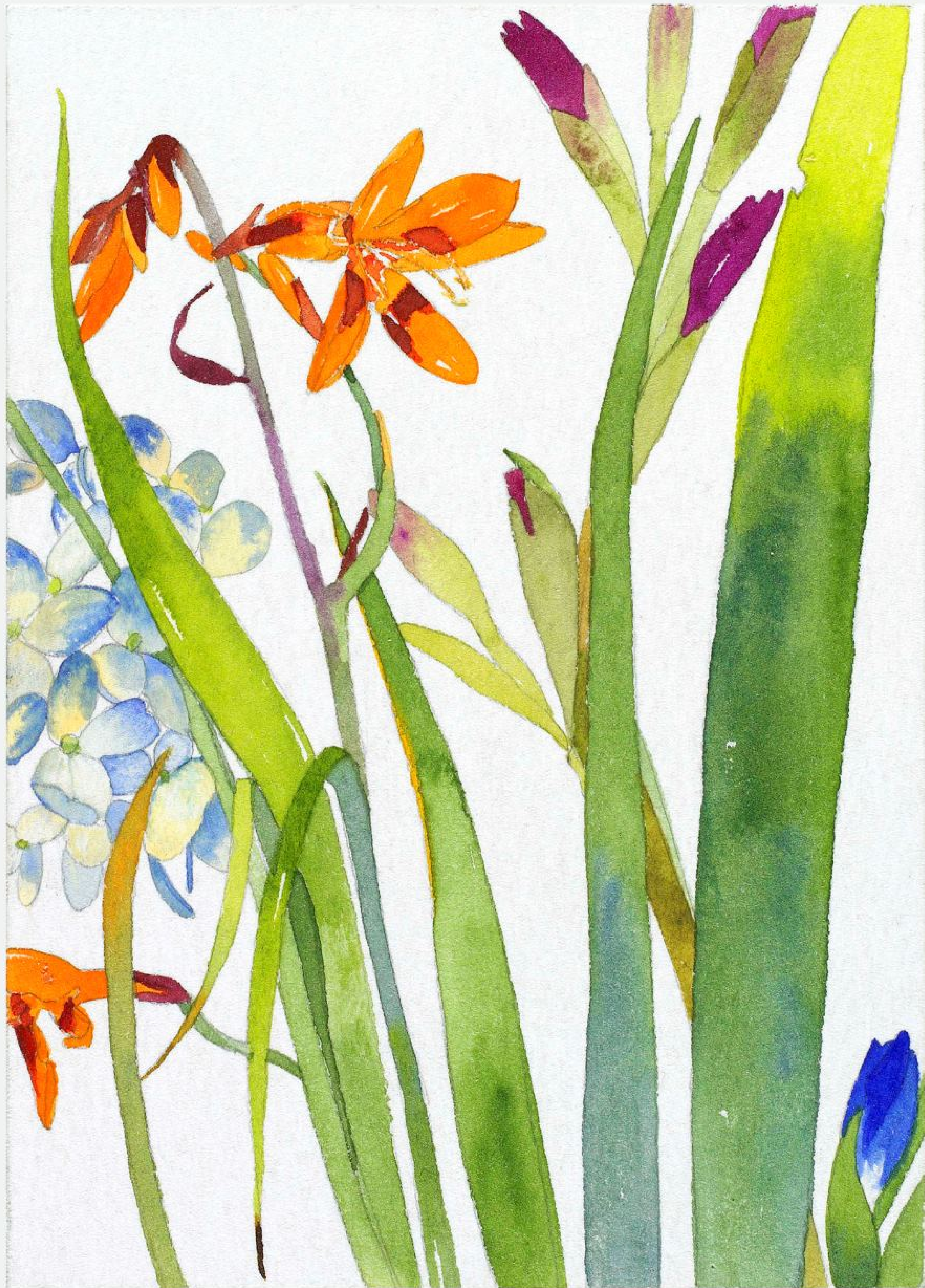
Orange Lily 7 x 5 inches