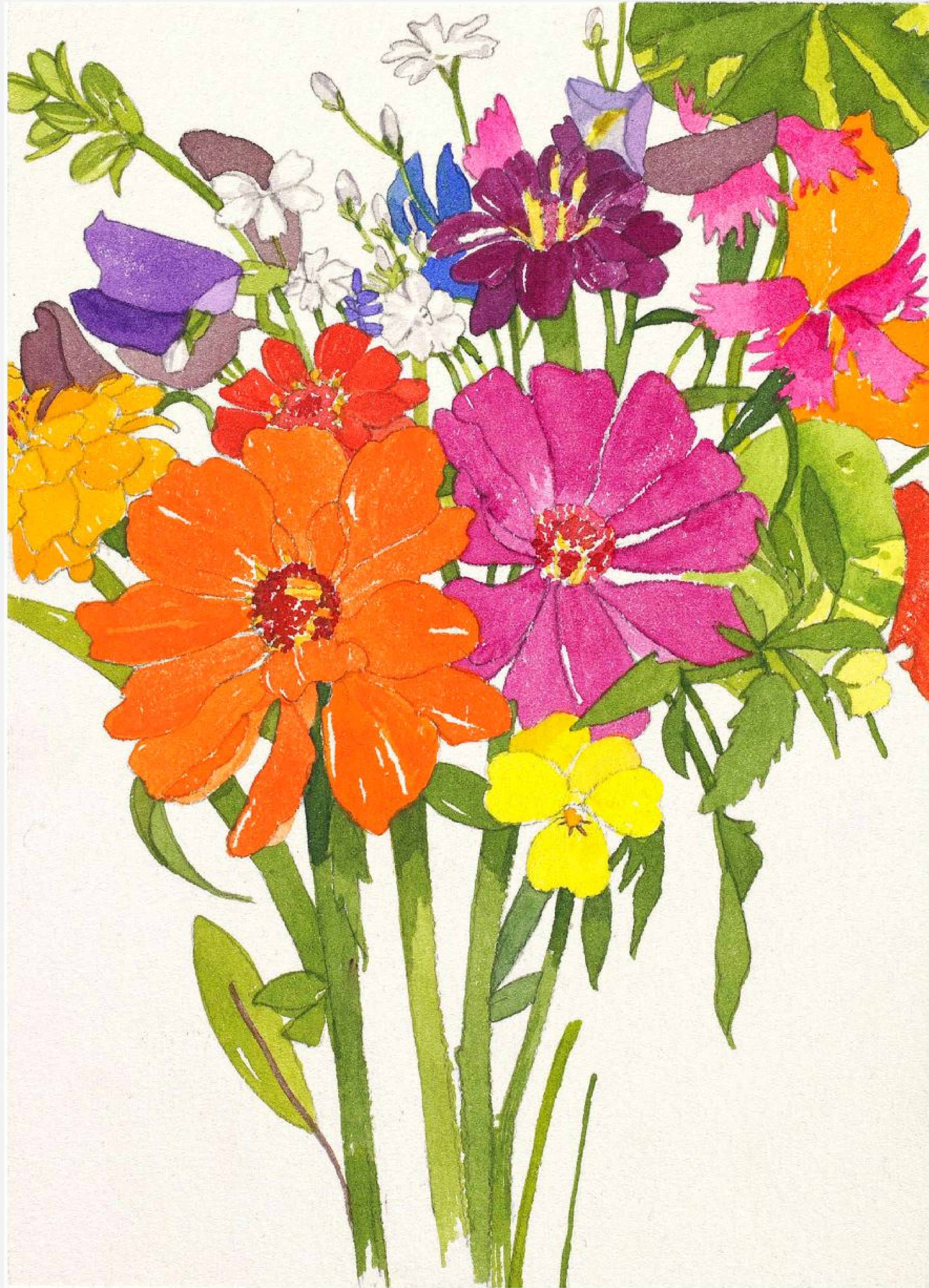
Zinnias with Yellow Viola 7 x 5 inches