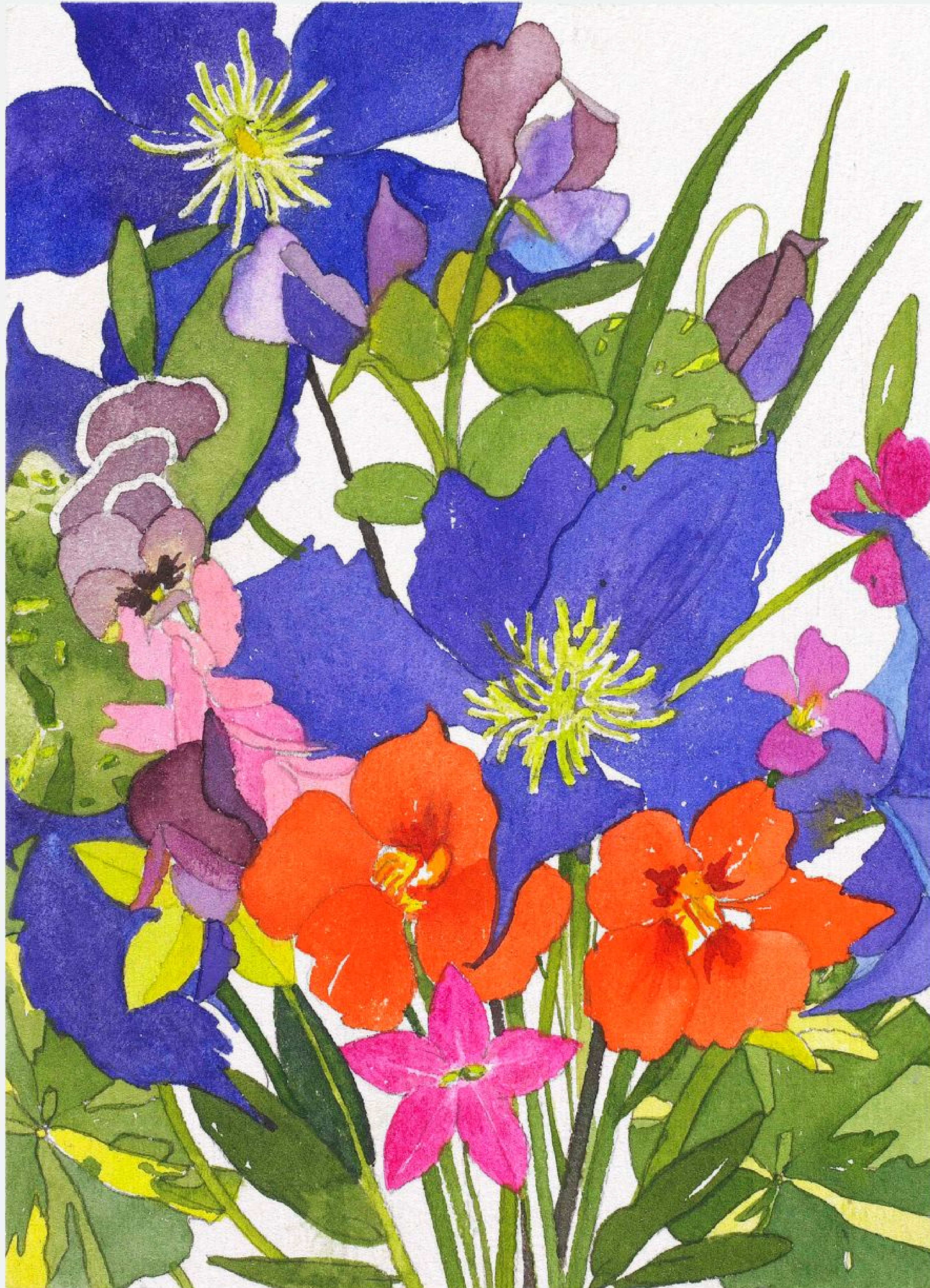
Orange Nasturtium with Clematis 7 x 5 inches