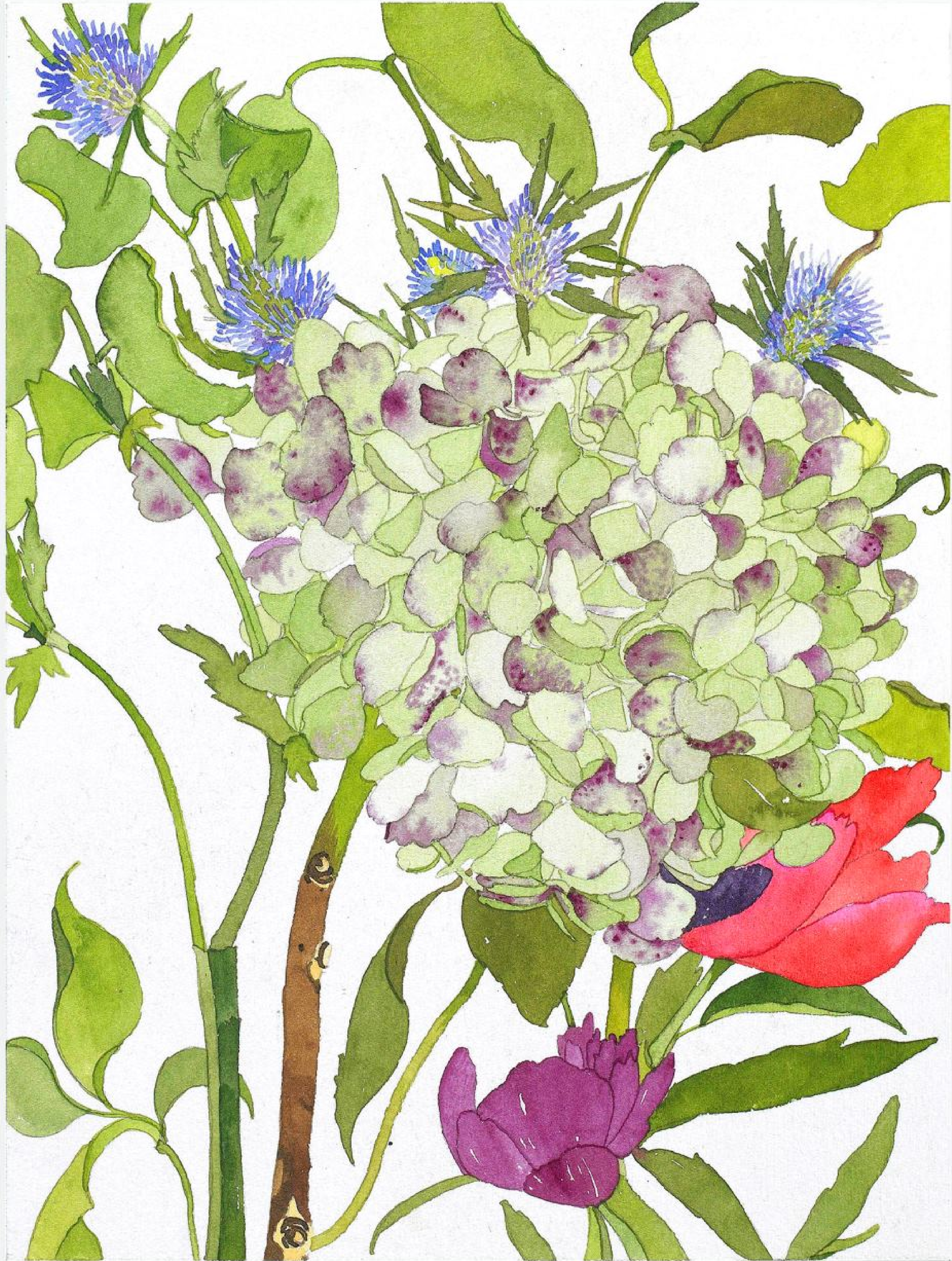
Hydrangea, Thistle 11 3 / 4 x 8 3 / 4 inches