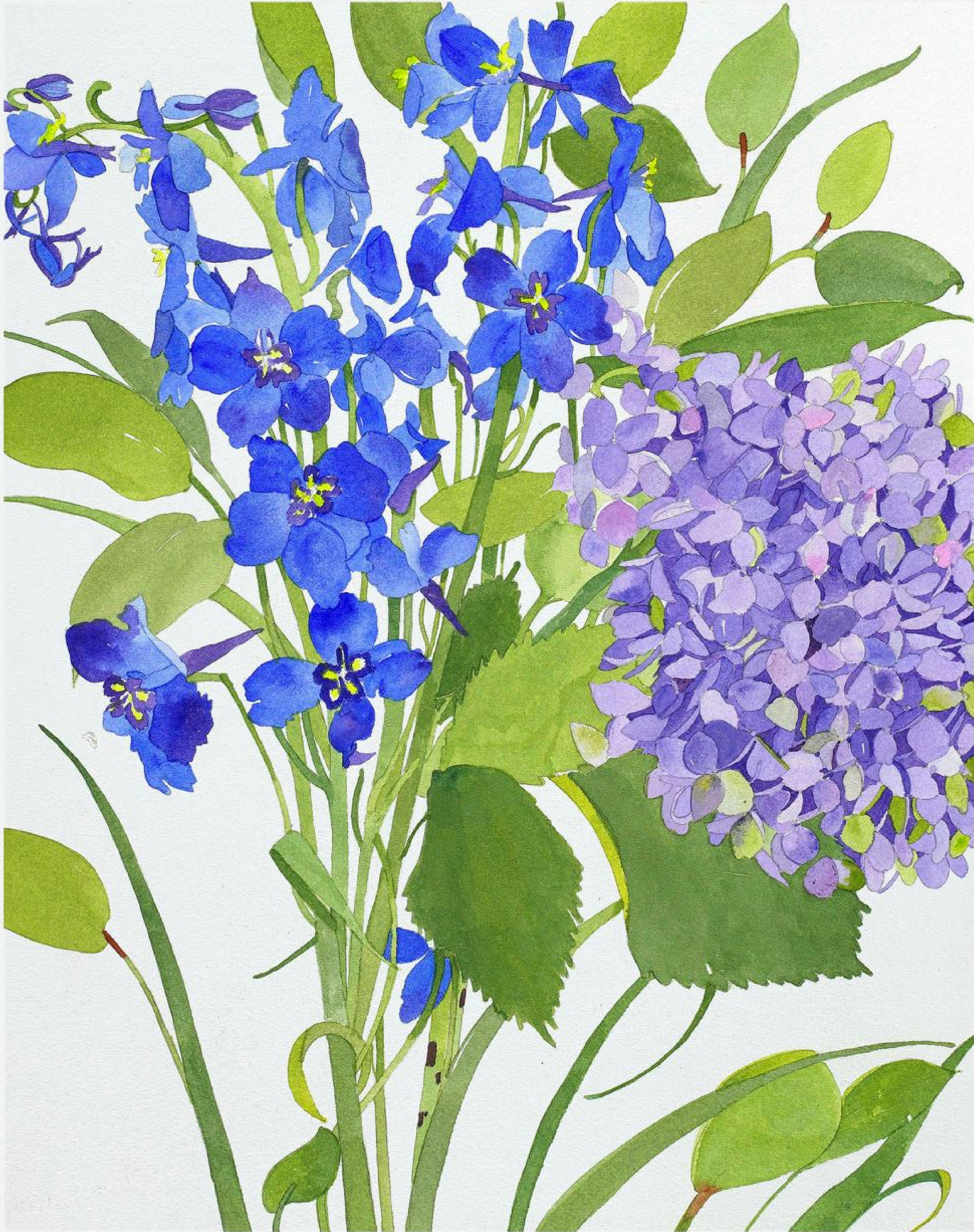
Hydrangea, Delphinium I 13 3 / 4 x 10 3 / 4 inches