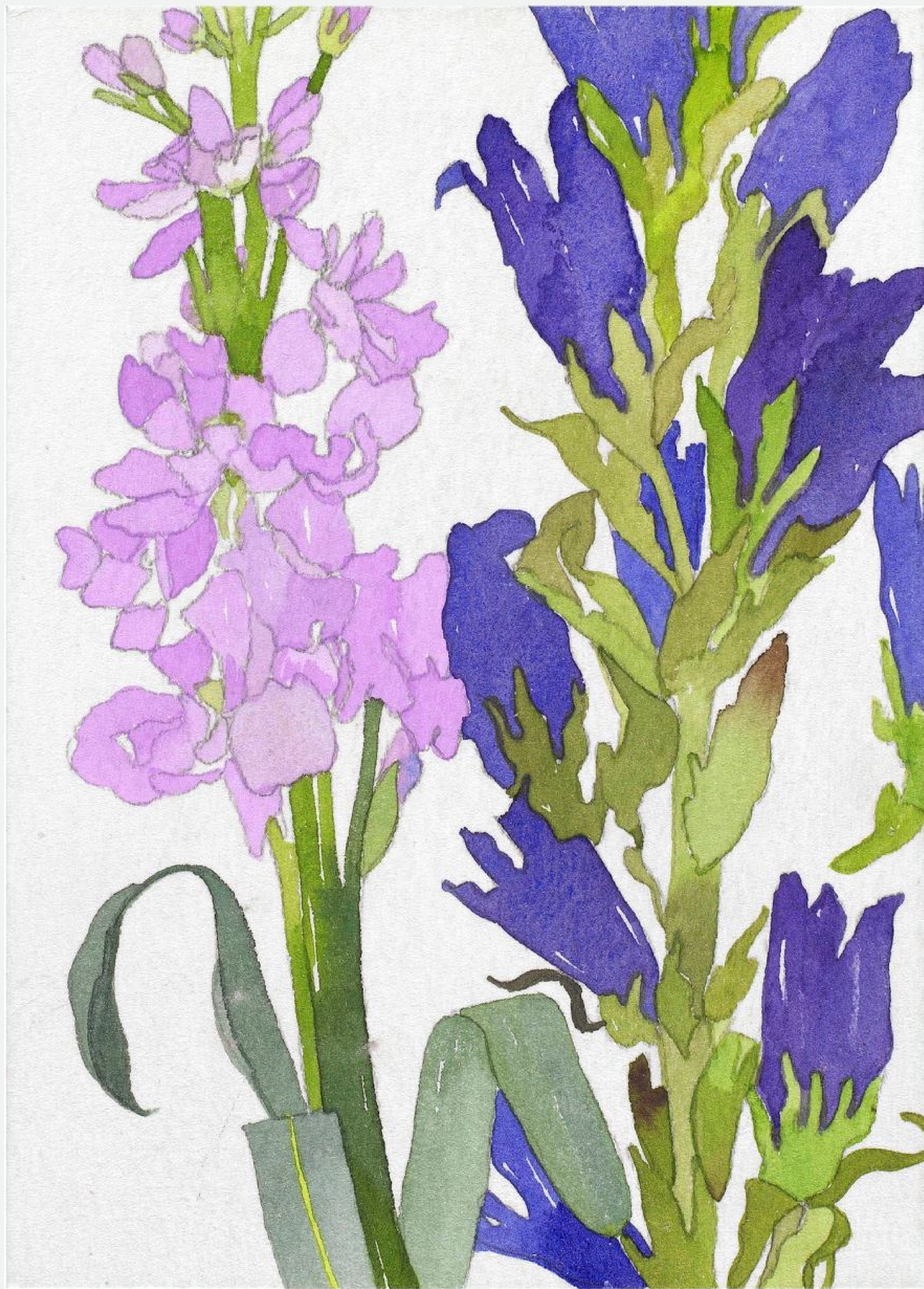
Stock, Campanula 7 x 5 inches