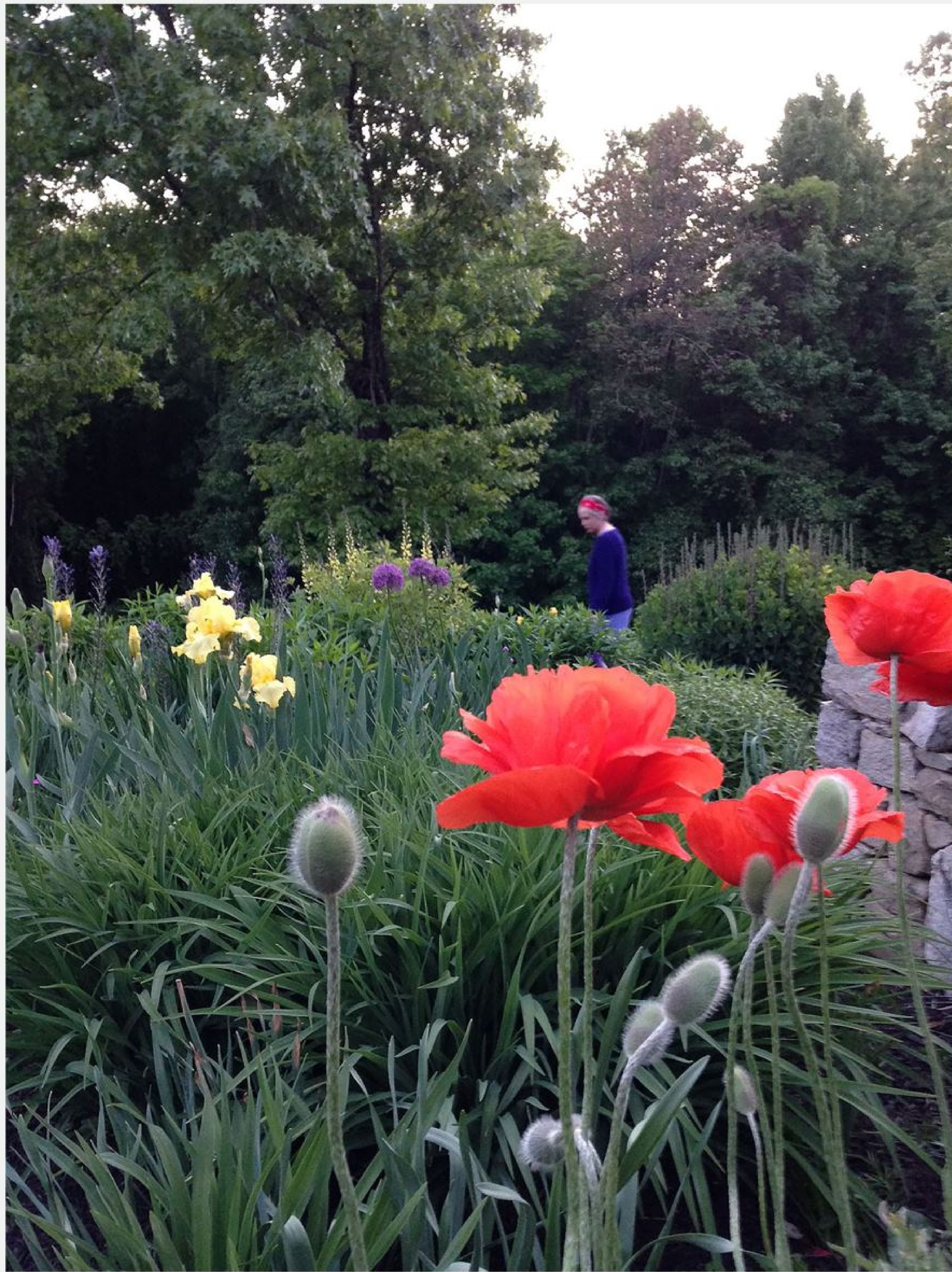
The Artist in her Garden