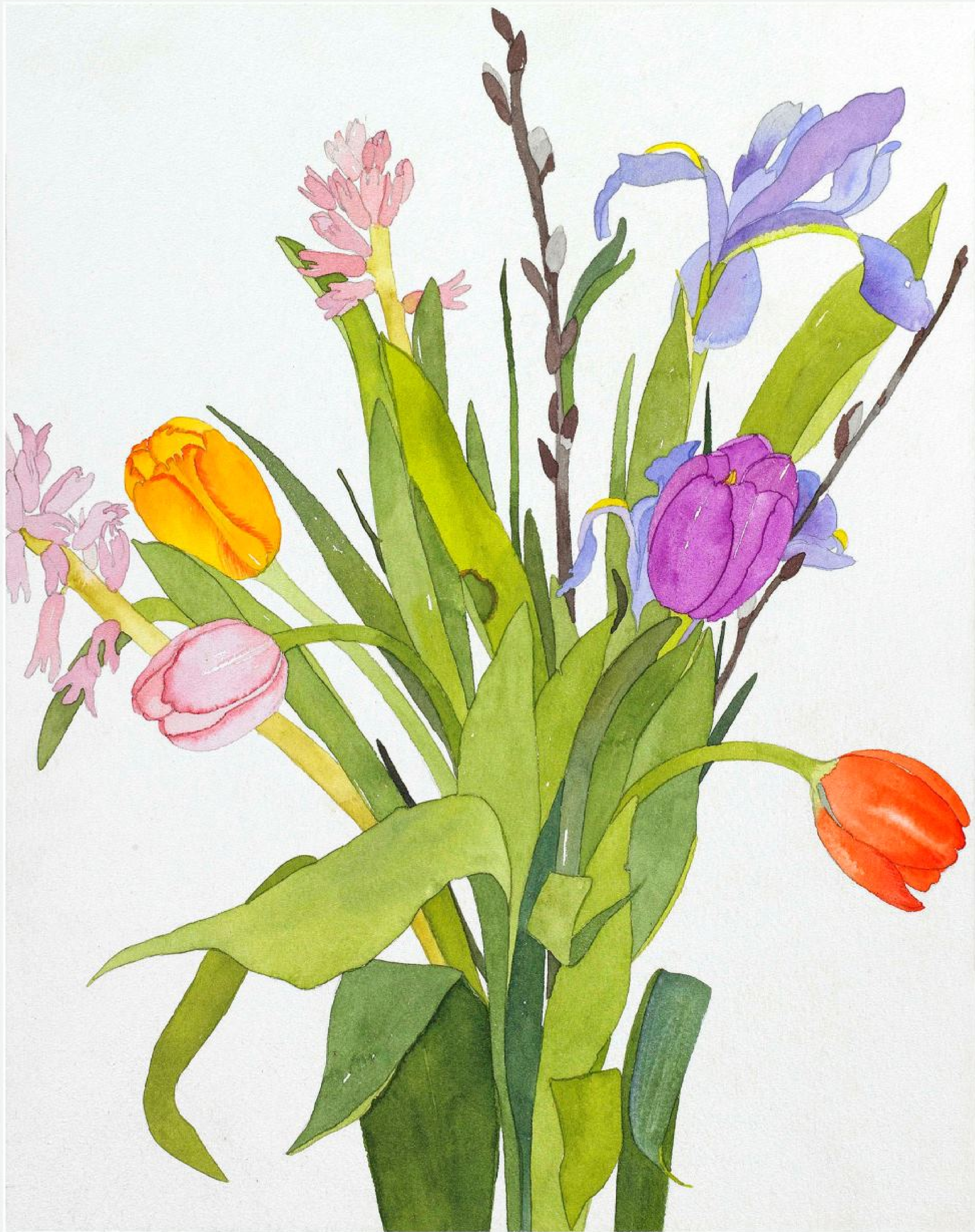
Tulips, Blue Iris 13 3 / 4 x 10 3 / 4 inches