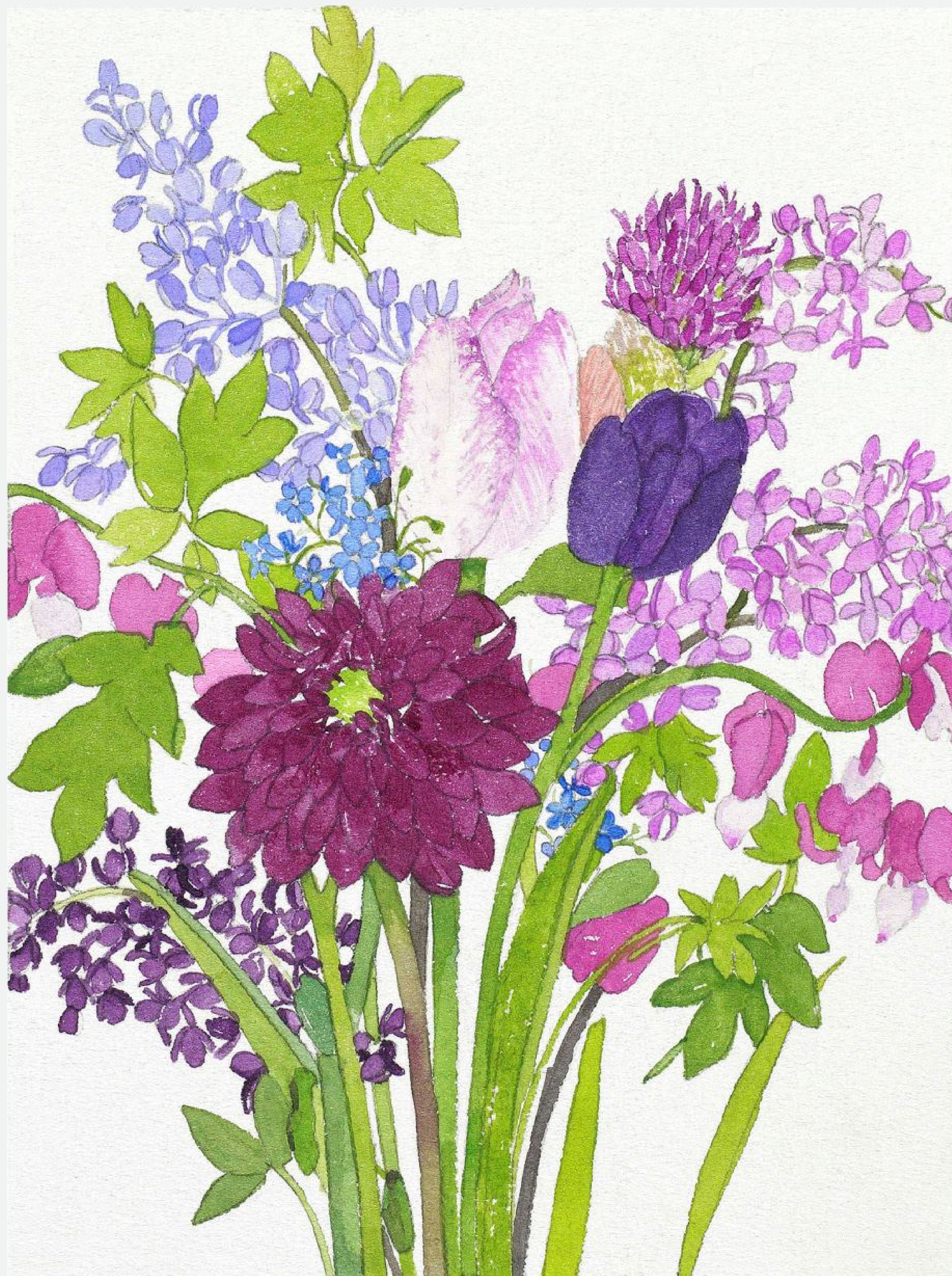
Little Black Tulip 7 3 / 4 x 5 3 / 4 inches