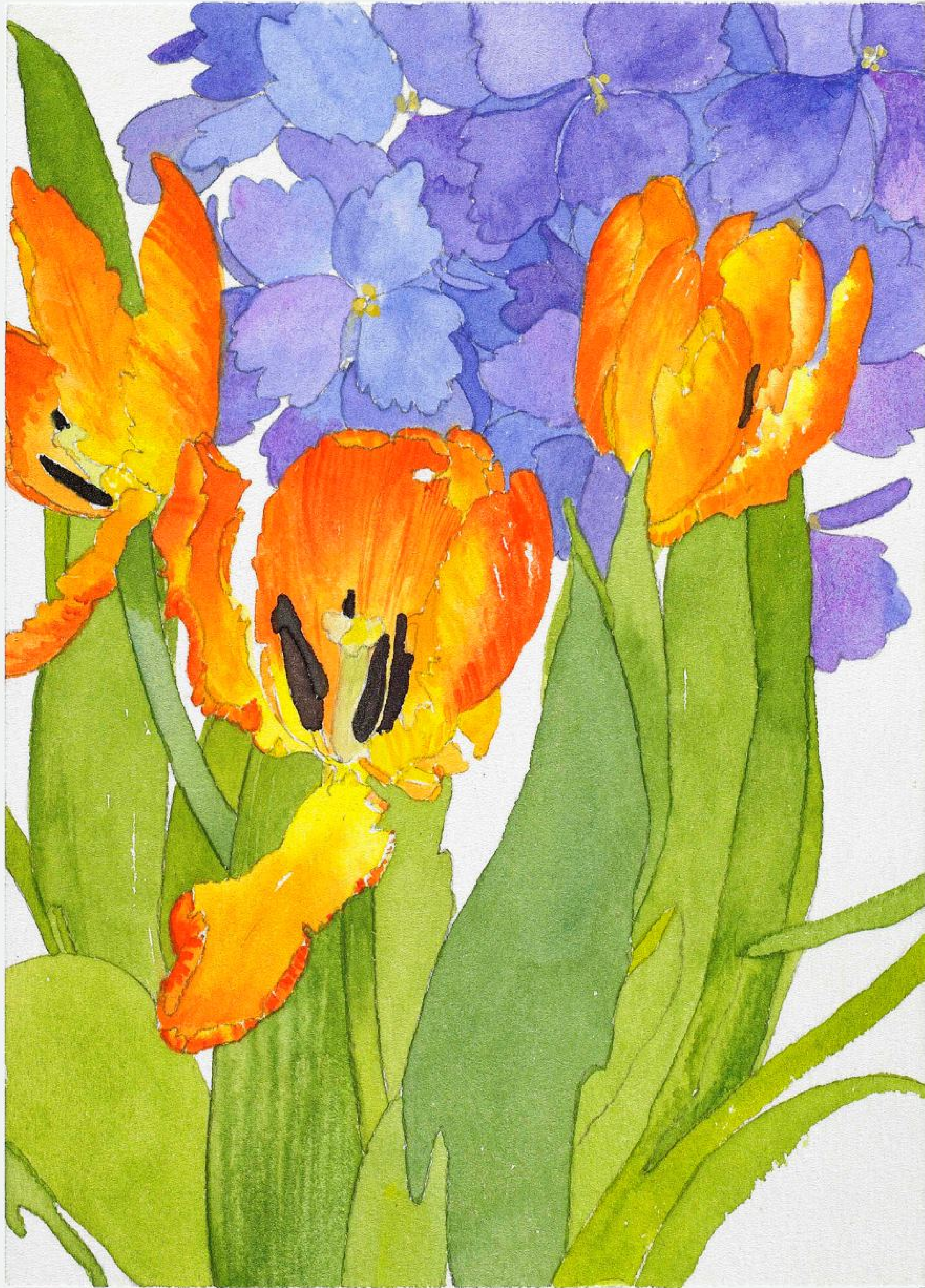
Open Orange Tulip 7 x 5 inches