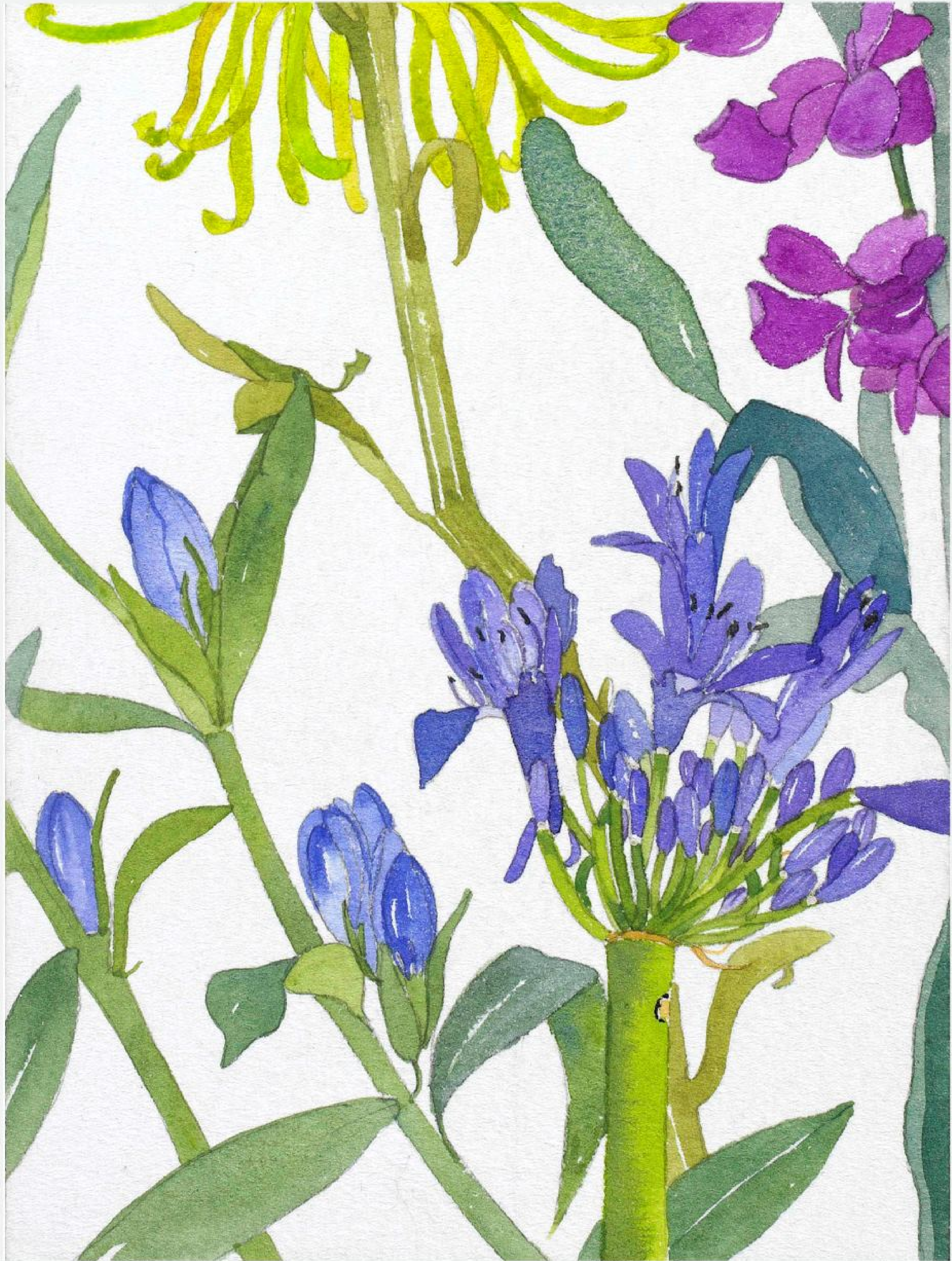
Part of a Spider Mum 7 3 / 4 x 5 3 / 4 inches