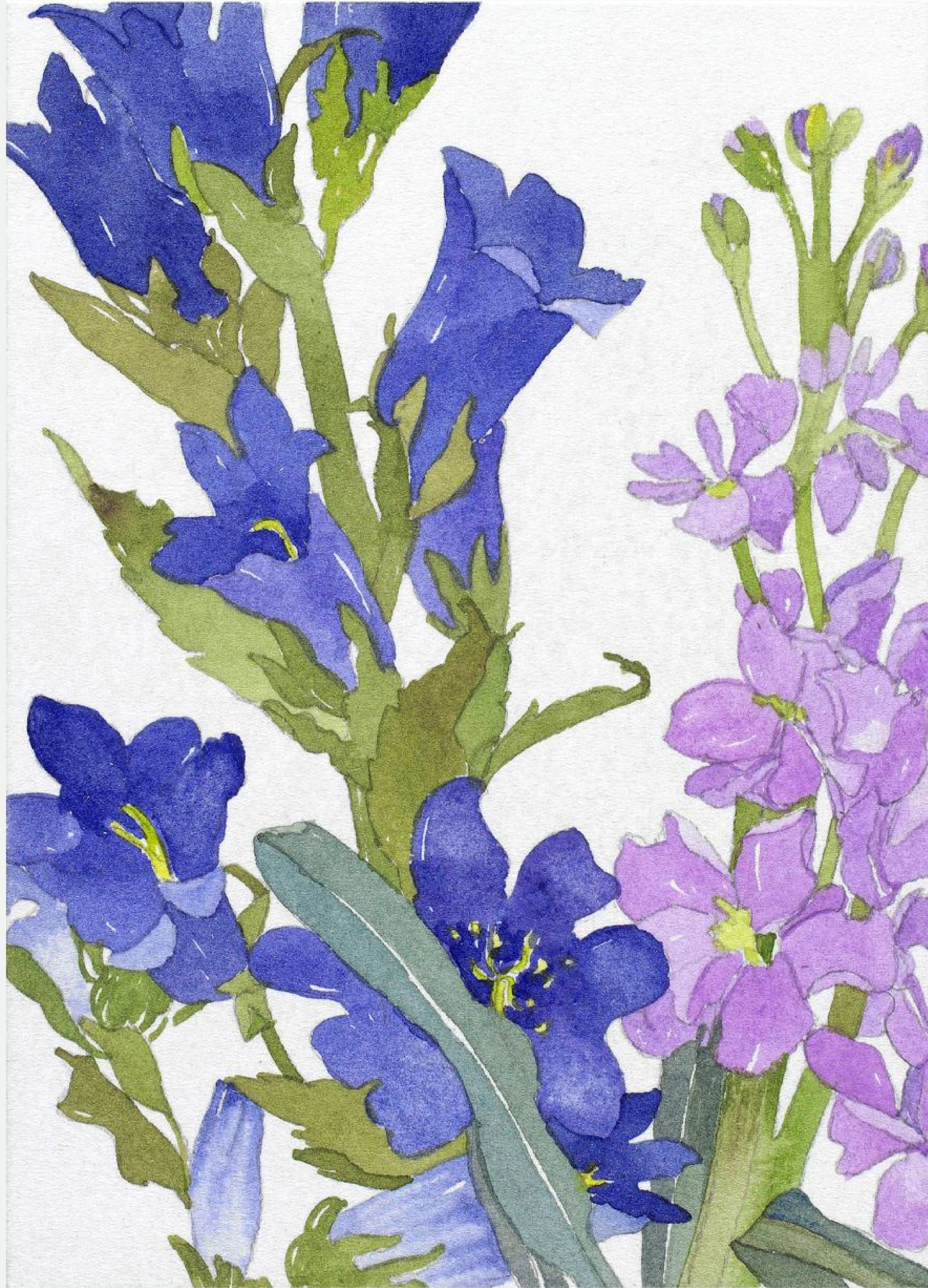
Campanula, Stock 7 x 5 inches