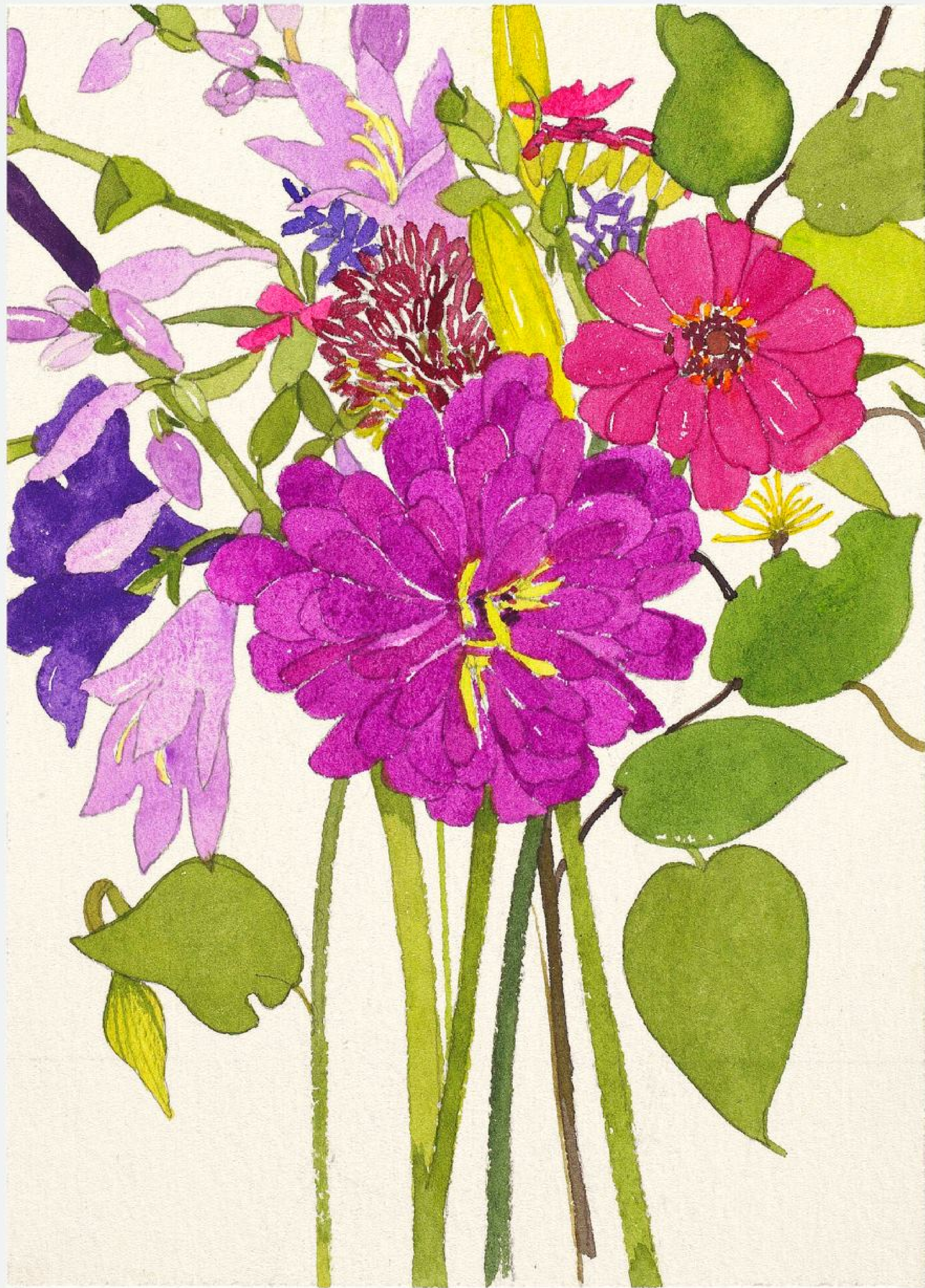
Pink Zinnia 7 x 5 inches