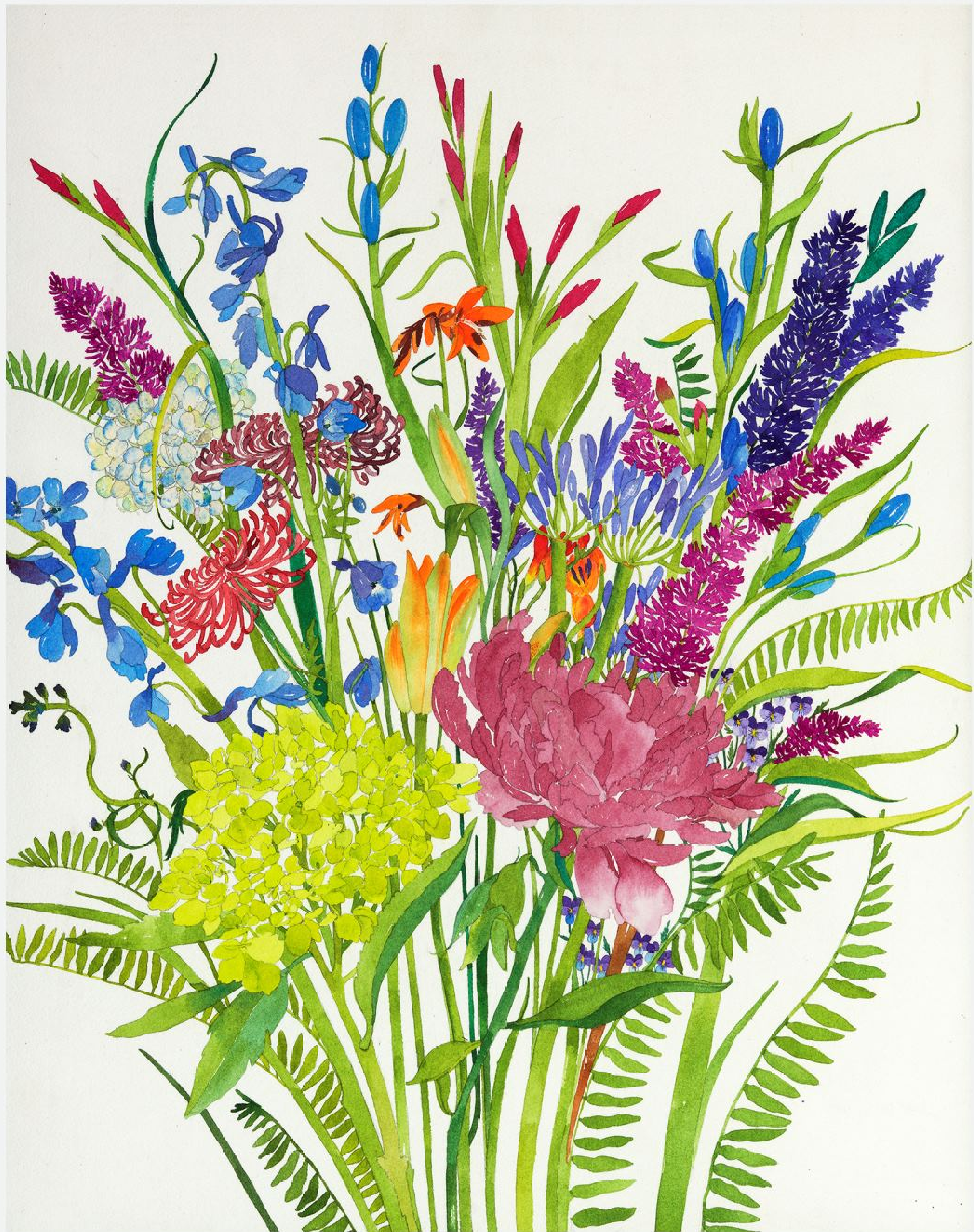
Hydrangea, Peony 19 1/2 x 15 3/4 inches