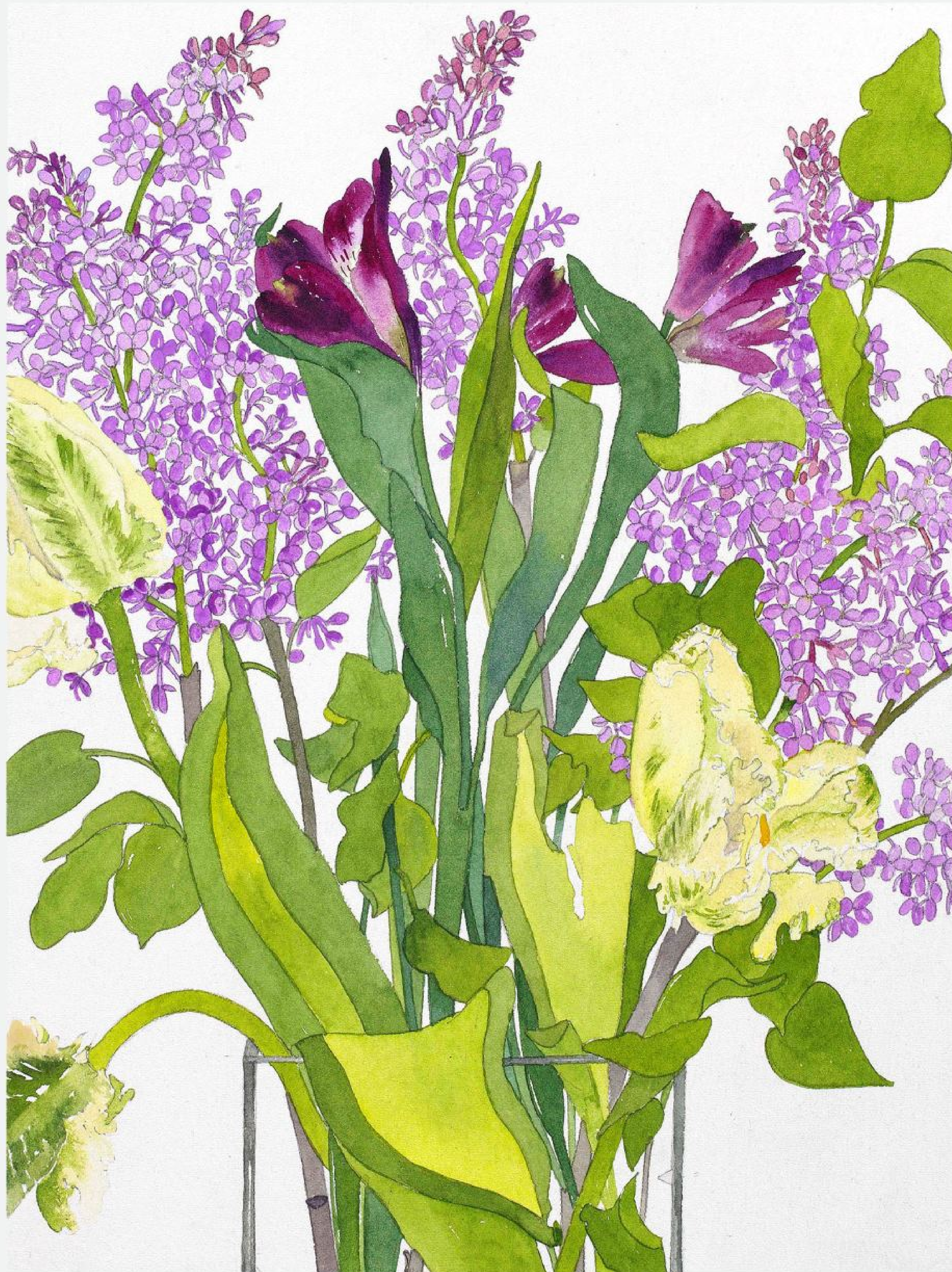
Lilac, Green Parrots 11 3 / 4 x 8 3 / 4 inches