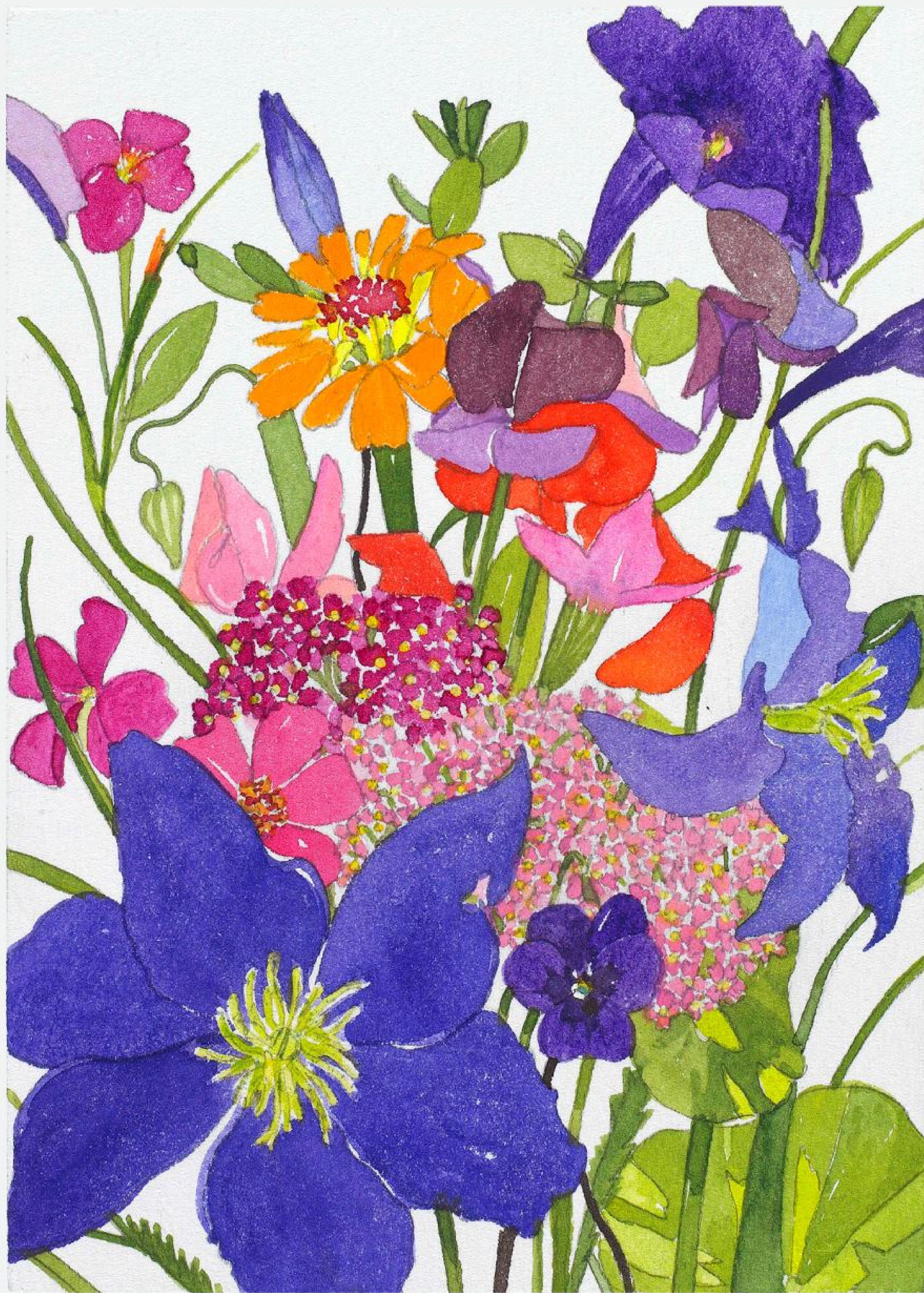
Blue Clematis with Yarrow 7 x 5 inches