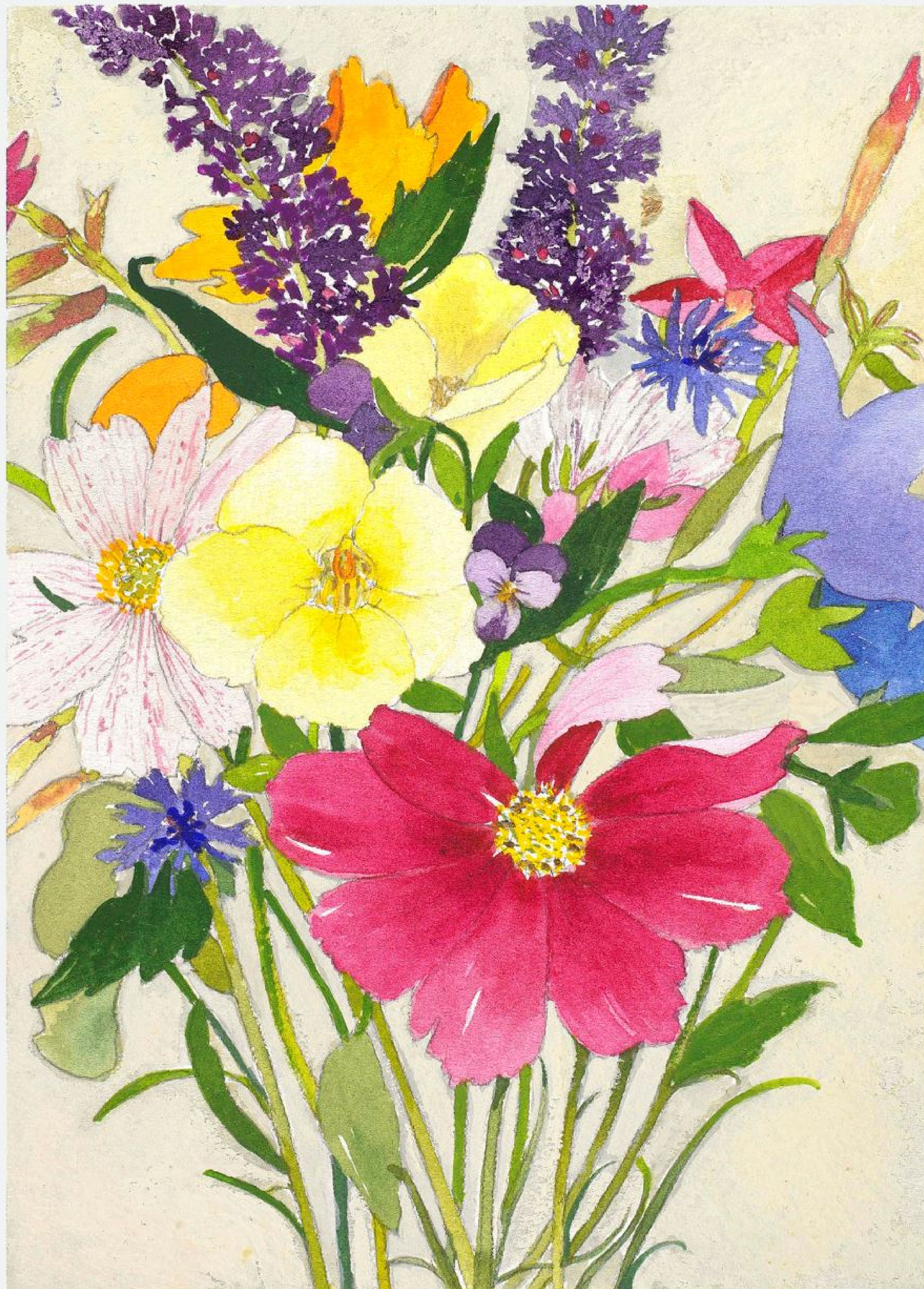
Cosmos 7 x 5 inches