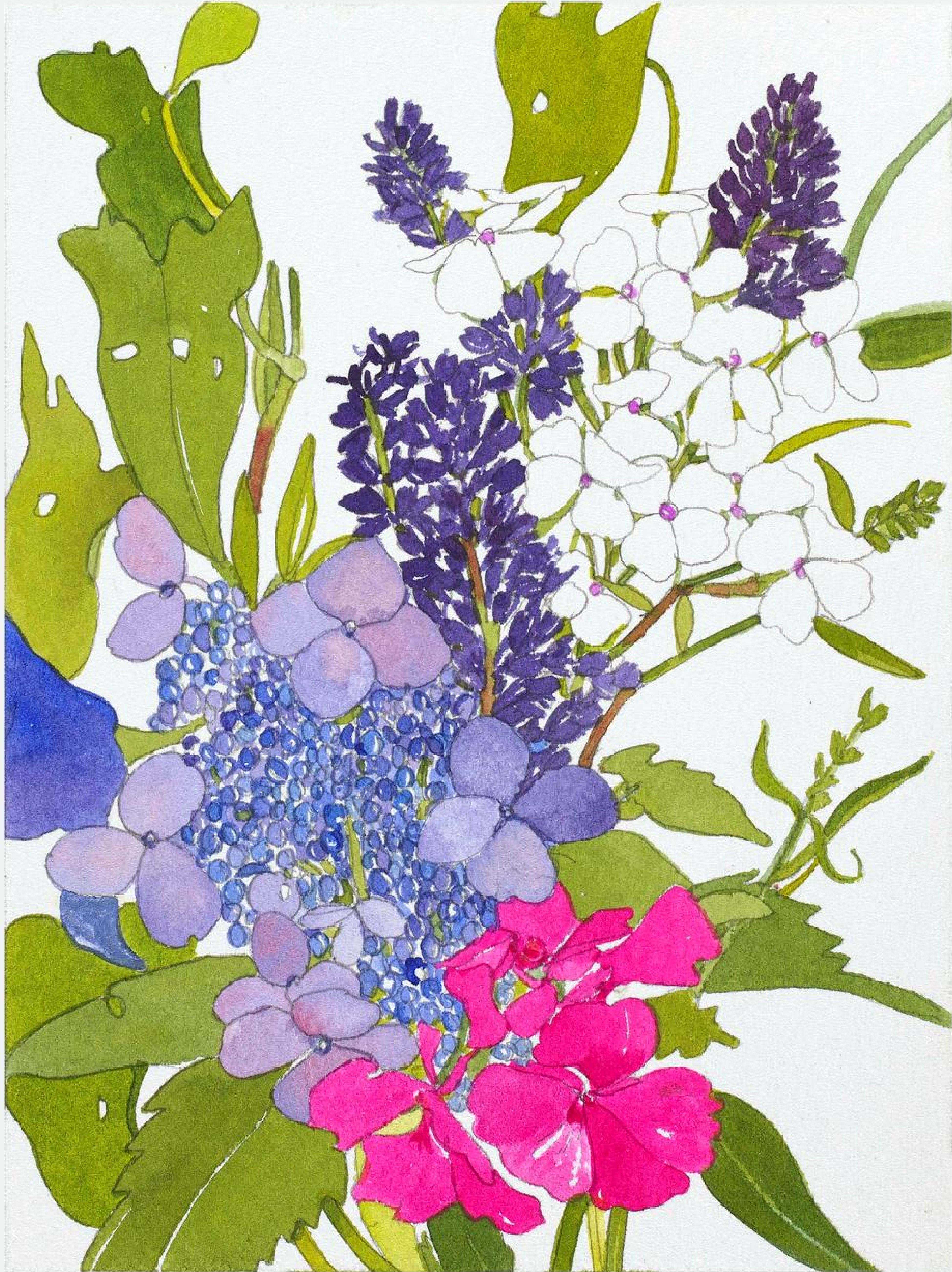
Lacecap, Buddleia 7 3 / 4 x 5 3 / 4 inches