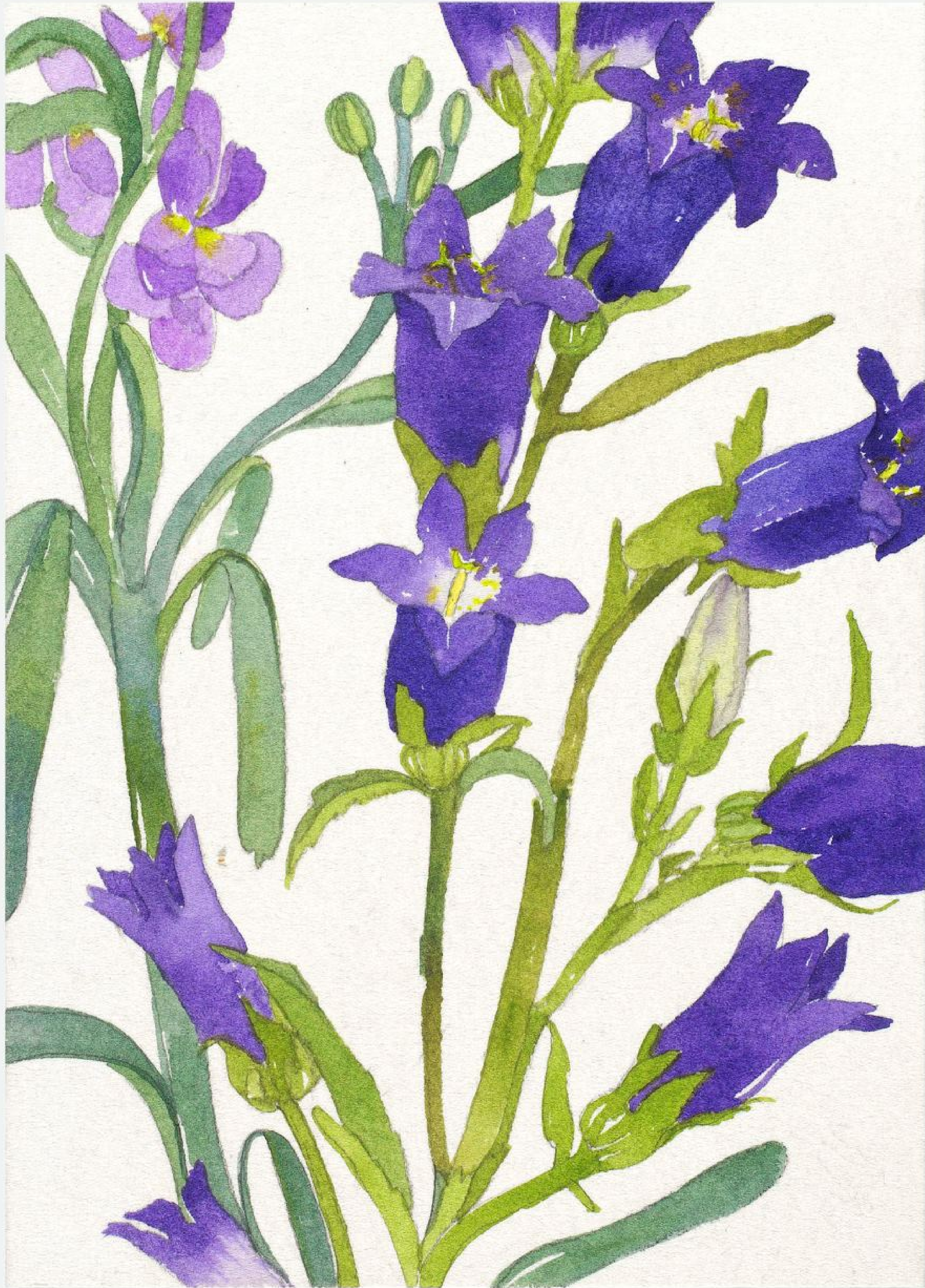
Campanula 7 x 5 inches