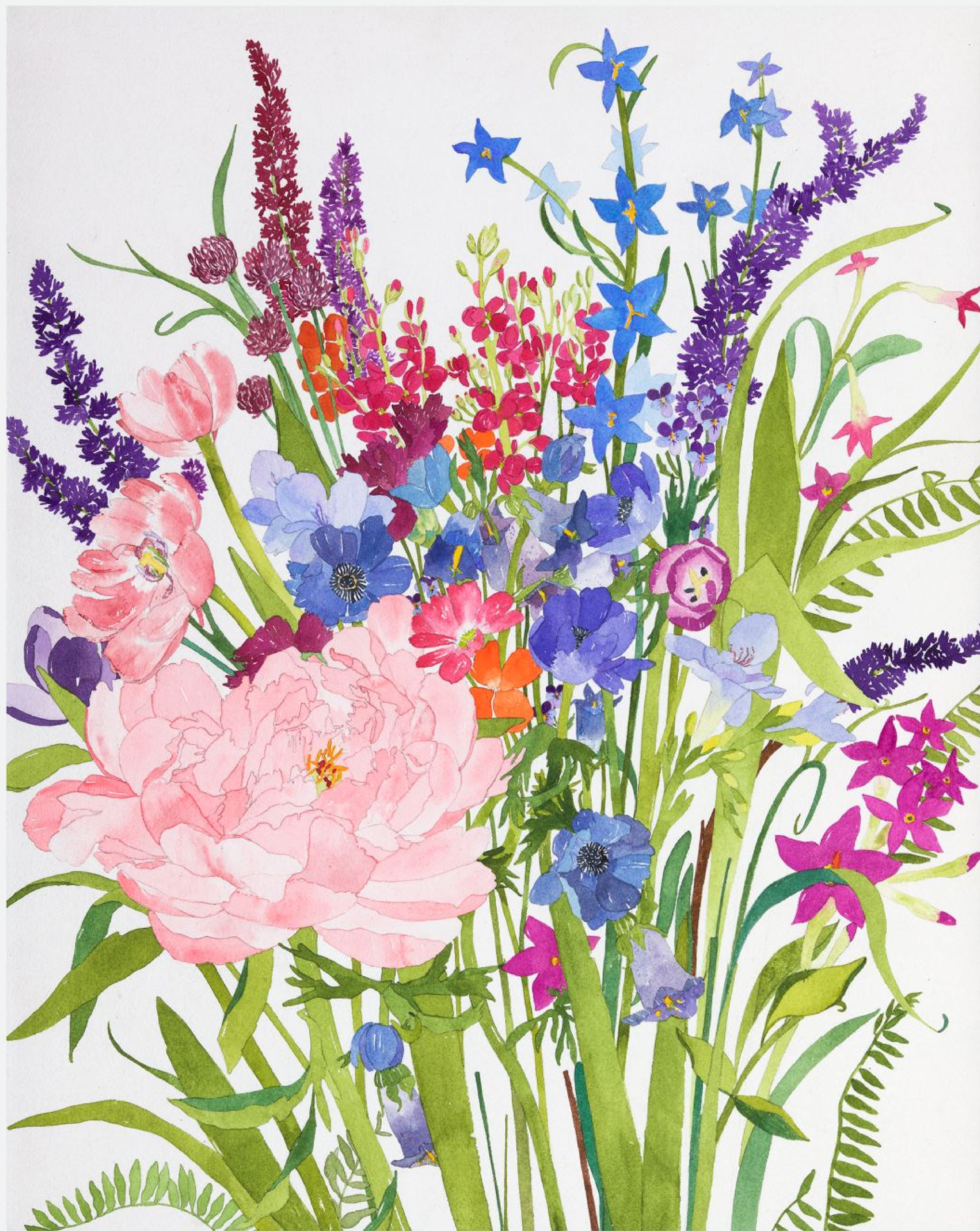
Pink Peony 19 1/2 x 15 3/4 inches