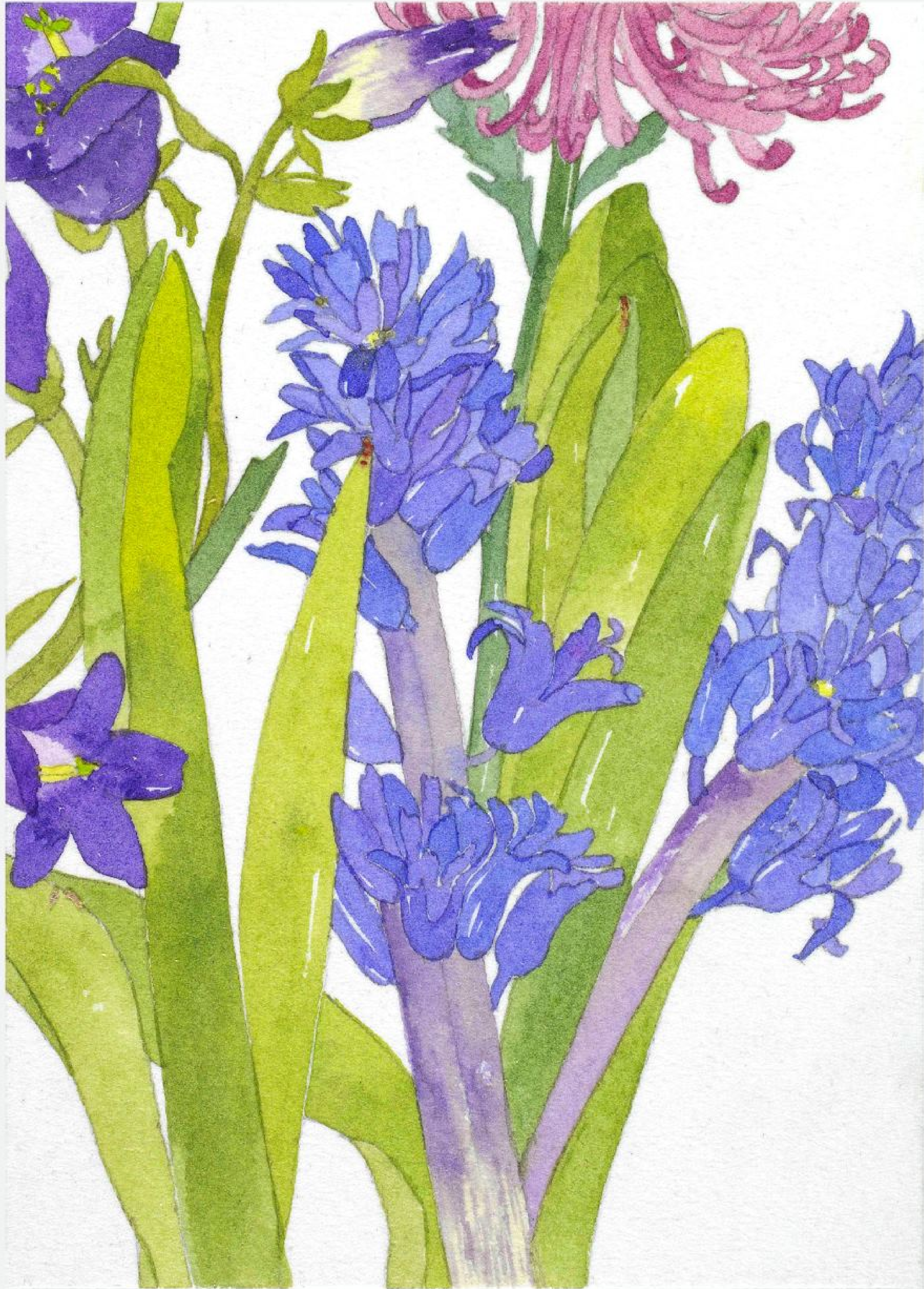
Hyacinth 7 x 5 inches