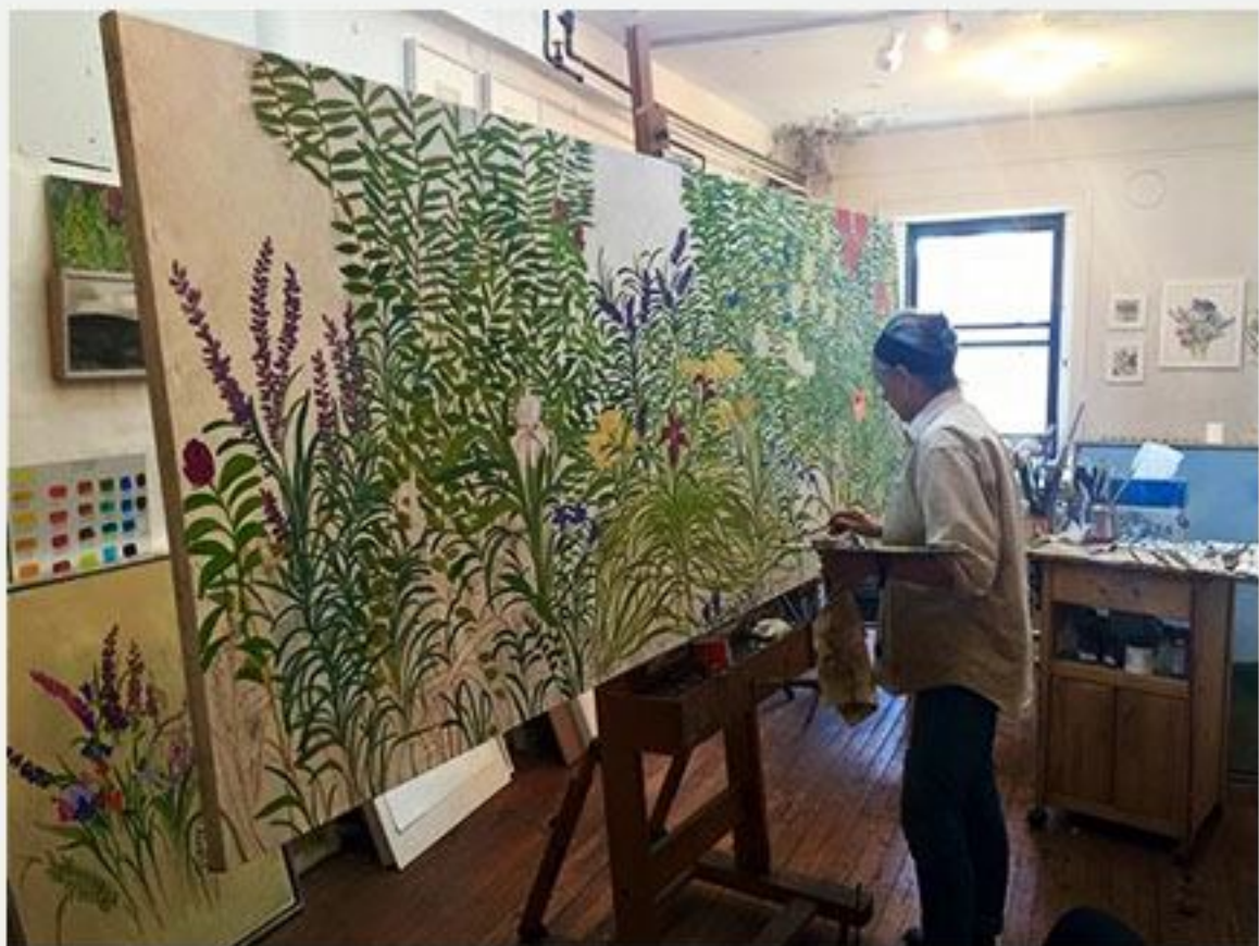
The Artist in her Studio