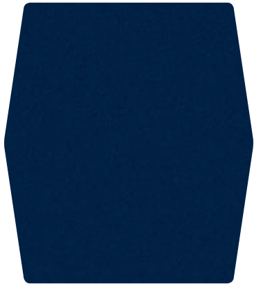
Midnight Sapphire Metallic