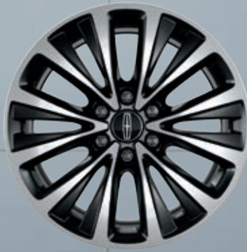
20" Ultra Bright-Machined Aluminum Standard on Select