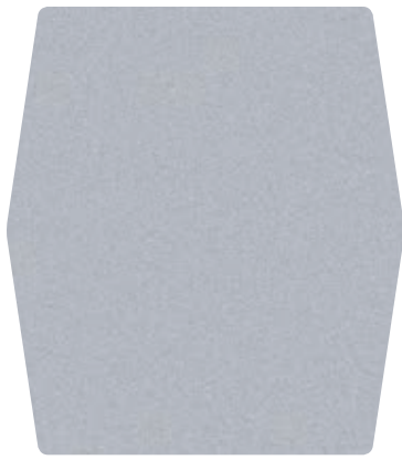
Ingot Silver Metallic