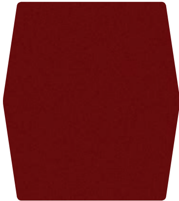
Bronze Fire Metallic