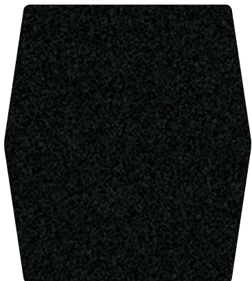
Tuxedo Black Metallic