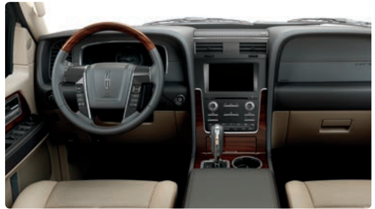
Trevino Premium Dune Leather Not available with Midnight Sapphire Metallic