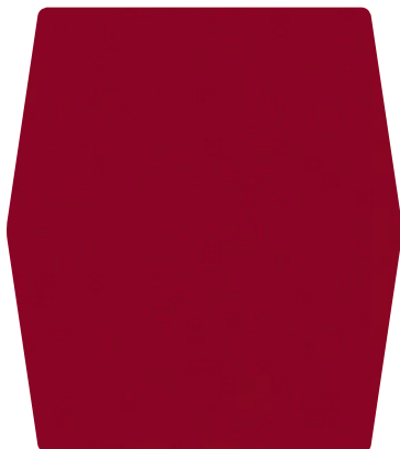
Ruby Red Metallic Tinted Clearcoat 1