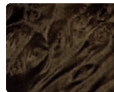
Prussian Burl Wood