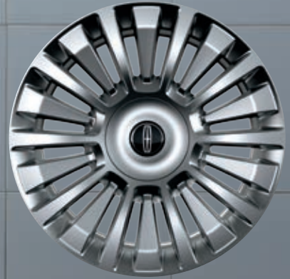
22" Polished Aluminum Standard on Reserve Optional on Select (includes Lincoln Drive Control)