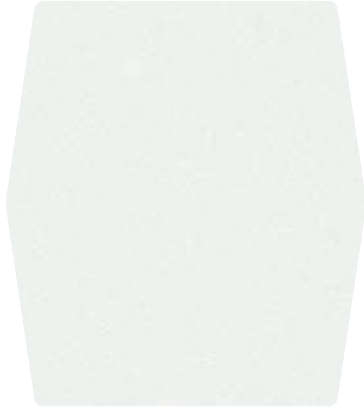
White Platinum Metallic Tri-coat 1