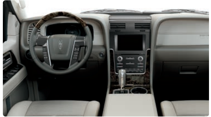
Medium Light Stone Leather