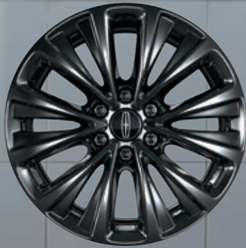
20" Dark Finish Aluminum Optional on Select