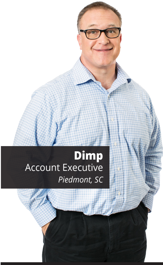
Dimp Account Executive Piedmont, SC