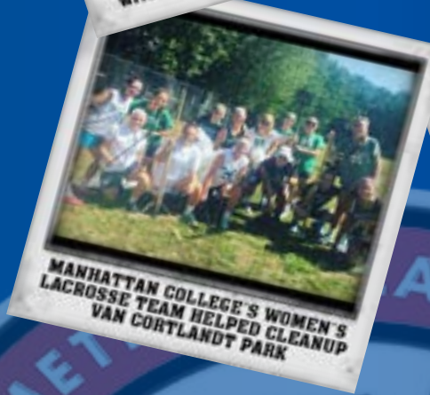
MANHATTAN COLLEGE'S WOMEN'S LACROSSE TEAM HELPED CLEANUP VAN CORTLANDT PARK