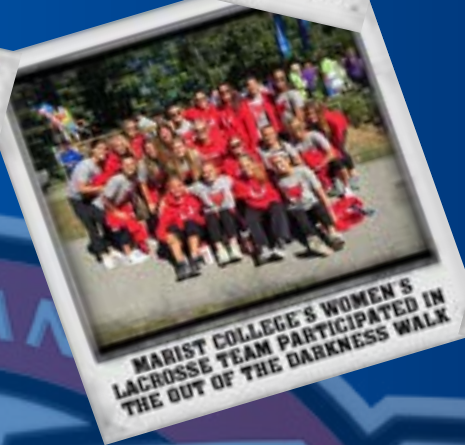
MARIST COLLEGE'S WOMEN'S LACROSSE TEAM PARTICIPATED IN THE OUT OF THE DARKNESS WALK