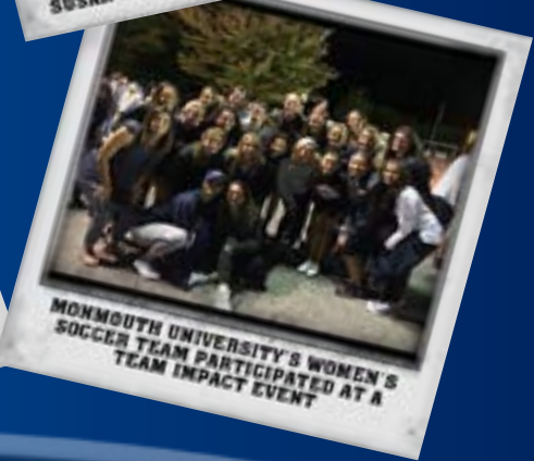
MONMOUTH UNIVERSITY'S WOMEN'S SOCCER TEAM PARTICIPATED AT A TEAM IMPACT EVENT

Under the MAAC Goodworks Program structure, MAAC member schools who have completed community service projects will be featured each month throughout the academic year. Monthly releases will be published and archived on MAACSports.com that highlight the volunteer efforts of MAAC schools during that month.