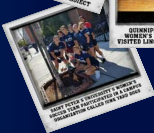
SAINT PETER'S UNIVERSITY'S WOMEN'S SOCCER TEAM PARTICIPATED IN A CAMPUS ORGANIZATION CALLED JUNK YARD DOGS