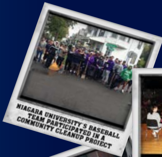
NIAGARA UNIVERSITY'S BASEBALL TEAM PARTICIPATED IN A COMMUNITY CLEANUP PROJECT