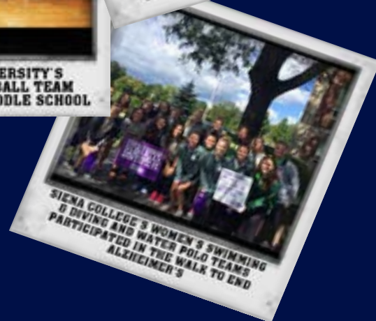
SIENA COLLEGE'S WOMEN'S SWIMMING & DIVING AND WATER POLO TEAMS PARTICIPATED IN THE WALK TO END ALZHEIMER'S