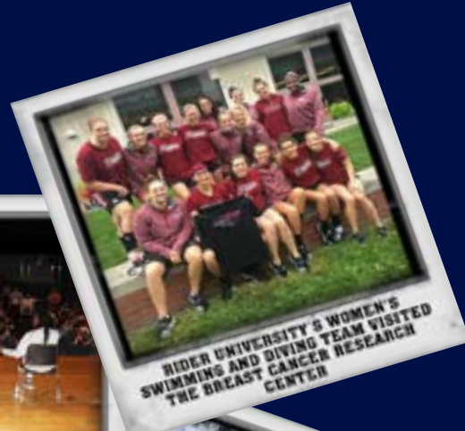
RIDER UNIVERSITY'S WOMEN'S SWIMMING AND DIVING TEAM VISITED THE BREAST CANCER RESEARCH CENTER