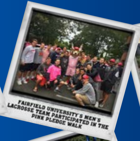
FAIRFIELD UNIVERSITY'S MEN'S LACROSSE TEAM PARTICIPATED IN THE PINK PLEDGE WALK