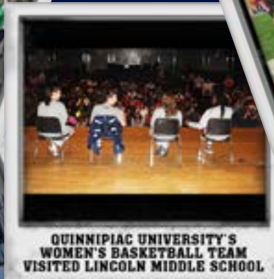
QUINNIAC UNIVERSITY'S WOMEN'S BASKETBALL TEAM VISITED LINCOLN MIDDLE SCHOOL