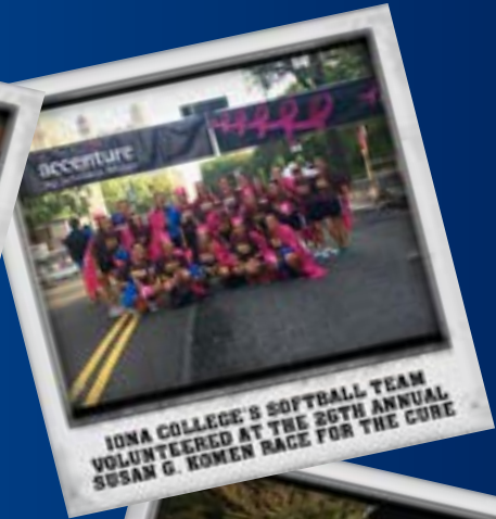
IONA COLLEGE'S SOFTBALL TEAM VOLUNTEERED AT THE 26TH ANNUAL SUSAN G. KOMEN RACE FOR THE CURE