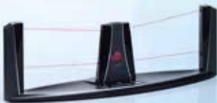
Beamz Interactive Music System