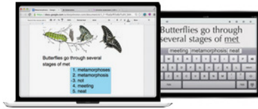
Don Johnston Universal Software