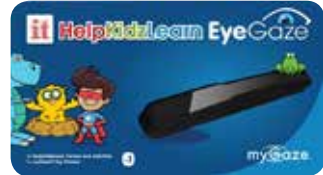
HelpKidzLearn and EyeGaze