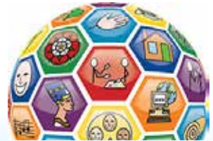
Wigit Symbol Software