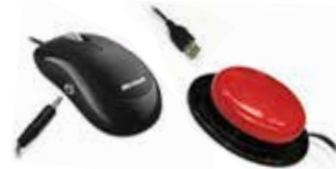
Switches and Switch Interfaces