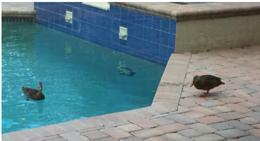
Even the ducks like SUSAN and SYDNEY KATZ' pool.