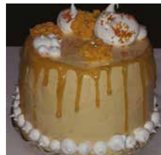
Amalfi Lemon Cake