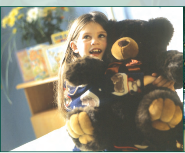
Children's Medical /Surgical Nursing