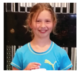
Myia Rubner Bluetooth Speaker