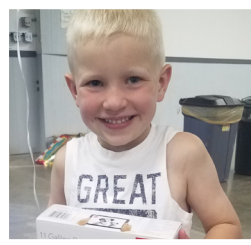
Beau Takes Tablet