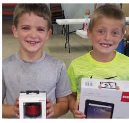
Jack Wessels Bluetooth Speaker Devin Schlichte Tablet