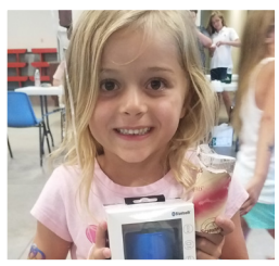
Lucy Rahe Bluetooth Speaker