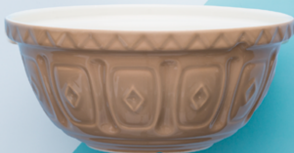
Size 12 Cane Mixing Bowl