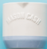
Bakewell Egg Separator