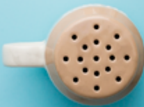
Original Cane Flour Shaker