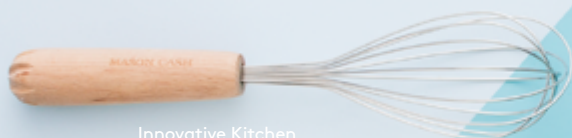
Innovative Kitchen Balloon Whisk + Reamer

From breakfast to dessert, it's no secret we're fans of making food healthier. Bakes can often be healthy with the simplest of tricks and an understanding of what ingredients and which products to use. Mason Cash has wide, comprehensive product ranges that combine quality and function which can become your helping hand in preparing healthy bakes. These products have innovative features which make them a perfect addition.