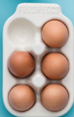
Bakewell Egg Store