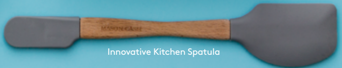
Innovative Kitchen Spatula