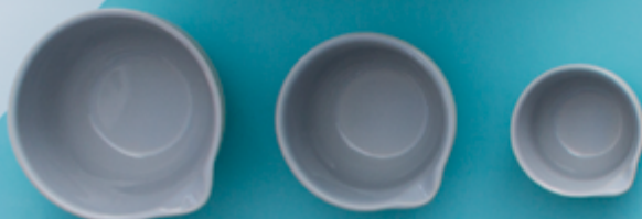
Bakewell Measuring Cups