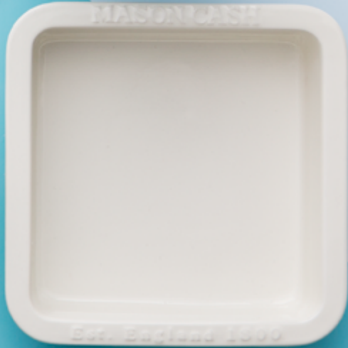
Original Cane 24cm Square Dish