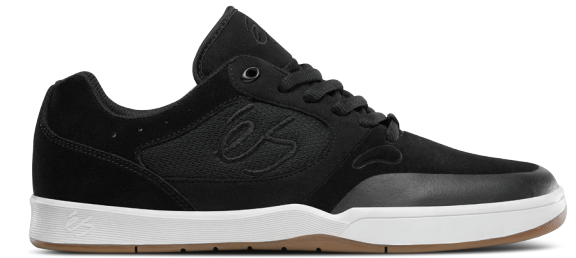
BLACK / WHITE 976 | Suede, Textile, Synthetic