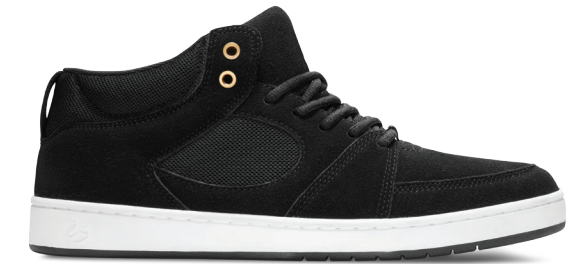
BLACK 001 | Suede / Mesh