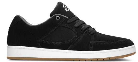
BLACK / WHITE 976 | Suede