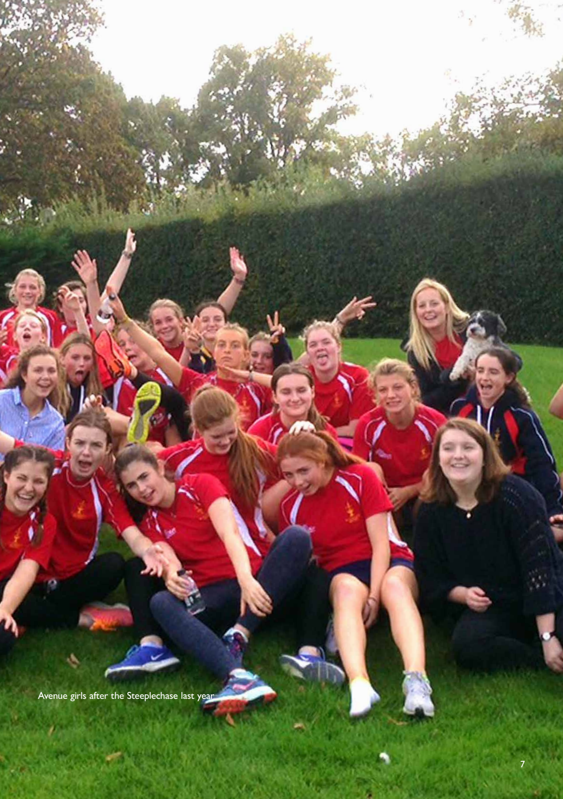
Avenue girls after the Steeplechase last year