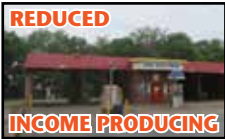
REDUCED INCOME PRODUCING Ride with Pride six-bay, self-serve car wash on West Front Street in Statesville. GI for 11 mo. in 2016 = $39,700 $185,000 $179,000.