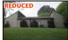
REDUCED 797104 Turn-key medical office in Jonesville. 3 exam rooms, 3 offices, procedure room. Could convert to duplex or other office space. $175,000