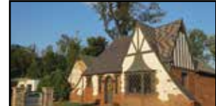
808843 - Dutch Castle commercial bldg on N. Bridge St, Elkin. 3467 SF, LG parking lot in back. $270,000