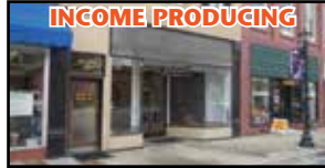
INCOME PRODUCING Income producing, restored, HW floors, 13'9" ceilings on W. Main St. downtown Elkin. Main level 2,840+/- SF. 2nd level has 2 furnished residential lofts. $299,000