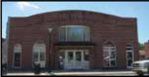
Updated building 9,359 SF on E Main St. Downtown Elkin. Part of building occupied by the Elkin Tribune, majority of lower level is vacant. $34.73 SF or $325,000