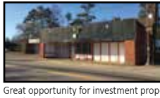
Great opportunity for investment property in Roaring River on HWY 268. Includes commercial building and vacant land on Highway 268 and a single family dwelling located on WO Blackburn Road. $99,900