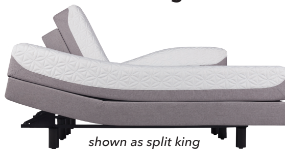
shown as split king

Queen Size TEMPUR-Cloud® Prima mattress on a TEMPUR-Ergo™ Premier Adjustable Base